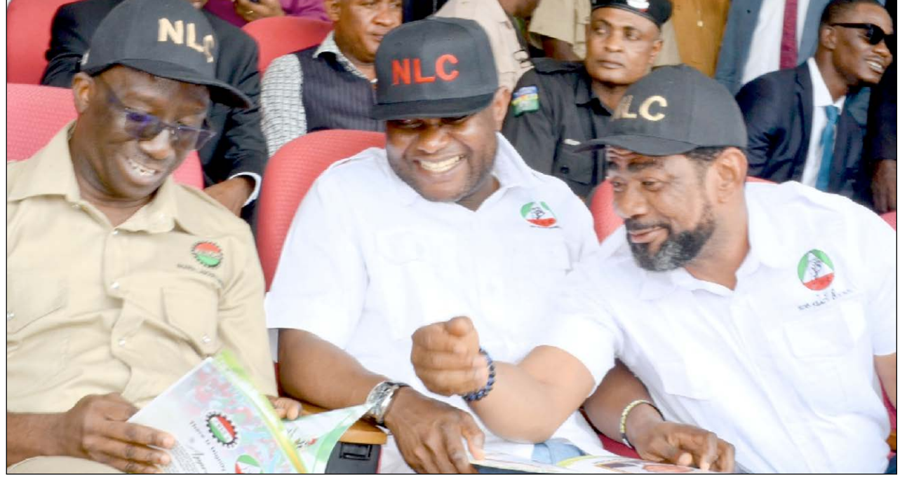
2025 MAY DAY CELEBRATION:

"In light of this and your failure to clarify inconsistencies raised in our first letter, we demand that you retract your sexual harassment allegation against our client," he added.