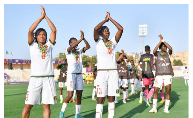
DR CONGO PLAYERS

The 25-year-old's goal stood out not just as a technical feat, but as a symbol of defiance and belief, earning her a place in the hearts of fans and in the annals of the tournament.