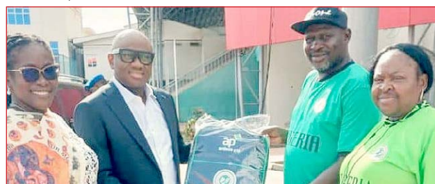
HON. ENABULELE AND HANDBALL FEDERATION MEMBERS

He emphasised the importance of strategic partnerships and sustained investment in grassroots sports development, in line with Governor Monday Okpebholo's vision for sports advancement in the state.