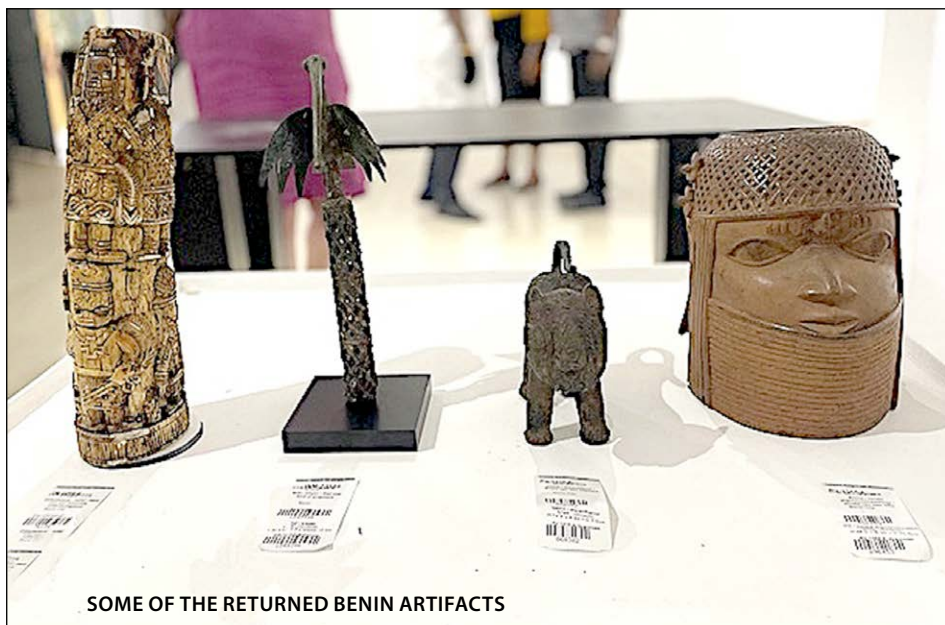
SOME OF THE RETURNED BENIN ARTIFACTS

Exhibition remains one of the most impactful ways museums communicate with the public. While there are other methods of engagement, exhibitions possess a unique ability to connect audiences with culture and heritage. Their influence on museum architecture and resource planning cannot be overstated and must be sustained.