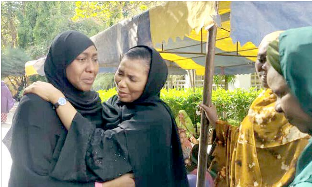
Buhari's daughter (left) weeps as she arrives Daura for burial.

Items recovered from the suspects include four locally made firearms, 19 rounds of live cartridges, and ₦5 million in cash.