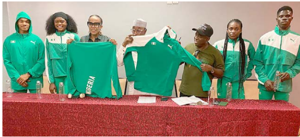
AFN UNVEILS KITS AHEAD 3RD AFRICAN U-18,U-20 ATHLETICS CHAMPIONSHIP

The city of Abeokuta is already alive with colour and culture. Traditional dancers and cultural troupes have been entertaining visitors with vibrant