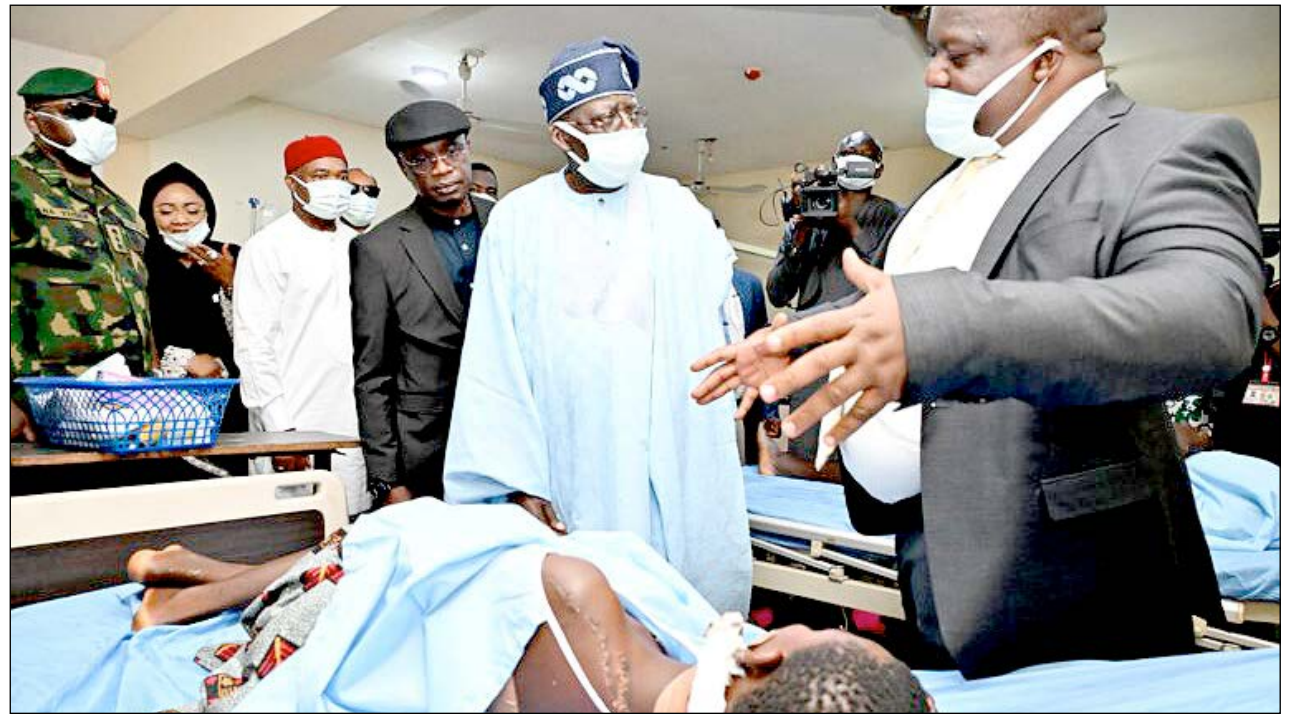
VISIT TO MAKURDI:

He added that the Plateau delegation also sought to learn from Benue's response strategies to humanitarian crises.