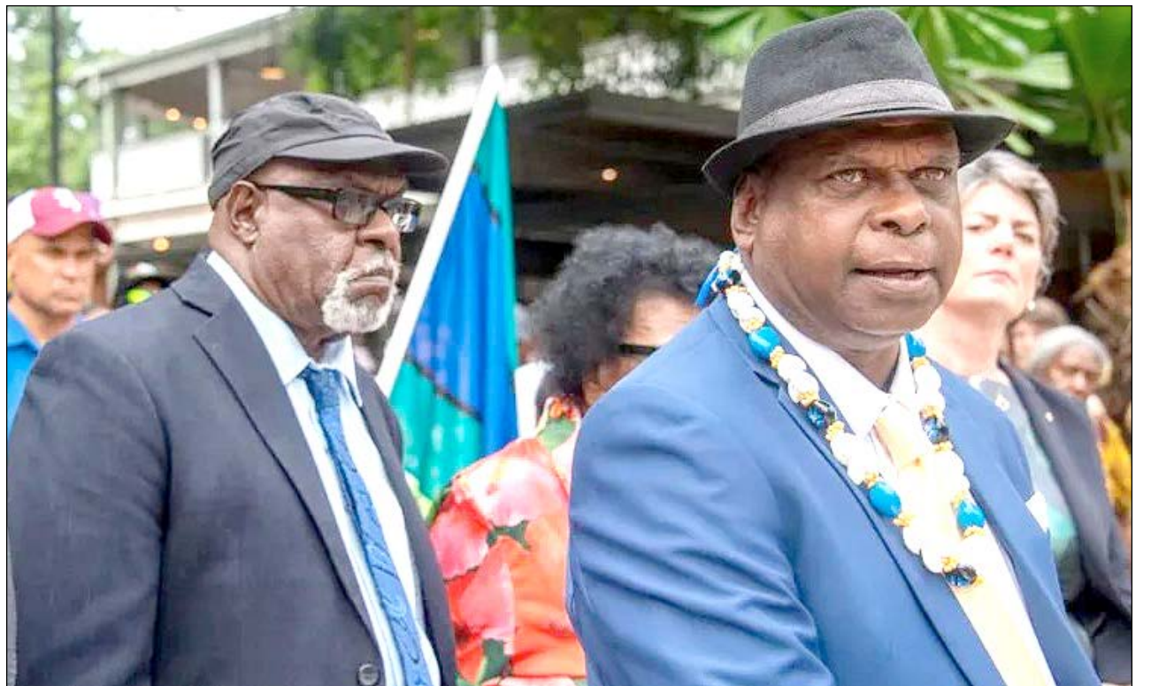
CASE AGAINST AUSTRALIAN:

Arap has already been heavily criticised in the years since it was launched, with a 2022 inquiry by the Foreign Affairs Committee finding it was a "disaster" and a "betrayal".