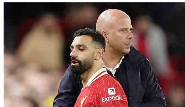
MOHAMED SALAH AND ARNE SLOT

"Someone wants me to get all the blame. The club promised