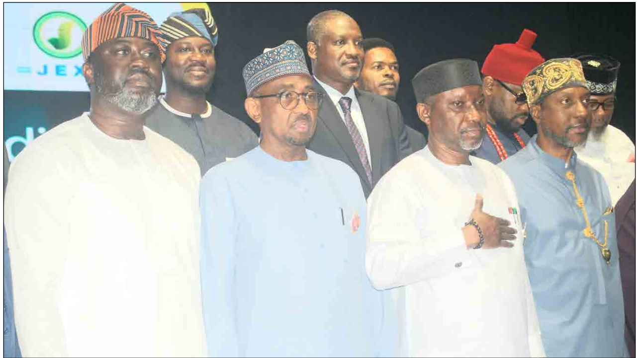
PRESENTATION OF GAS TRADING LICENSE: