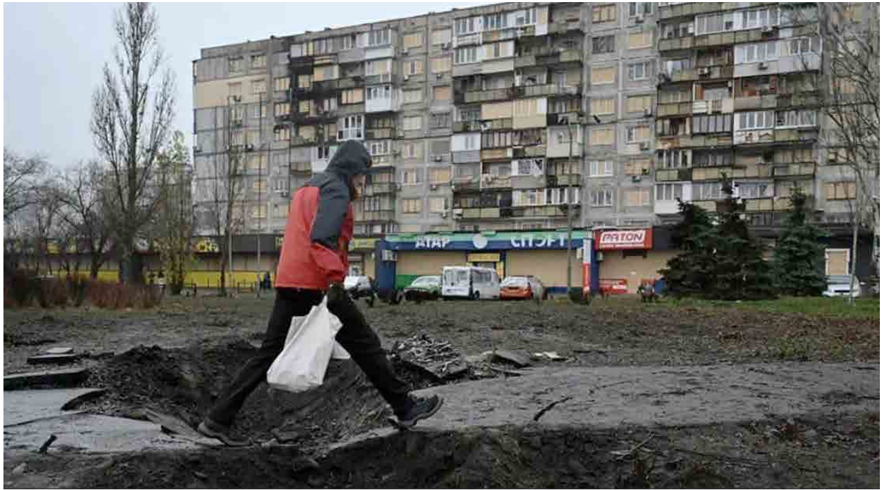
US REVISED PEACE: Scenes of devastated Ukraine settlements.

The IGGÖ said it would review "the constitutionality of the law and take all necessary steps"