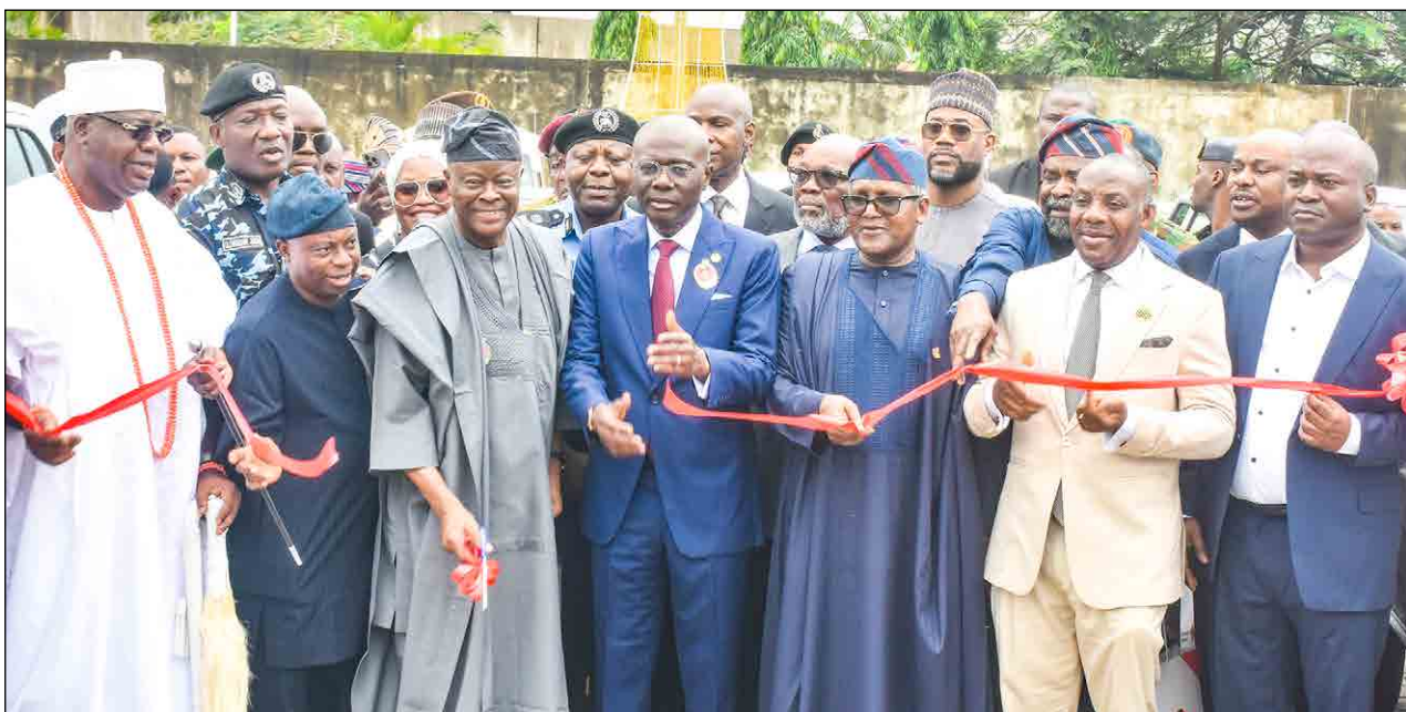
19TH ANNUAL TOWN HALL MEETING:

Deputy Speaker Benjamin Kalu directed the House Committee on Aviation to engage the Aviation Minister and airline operators and report back within one week for further legislative action.