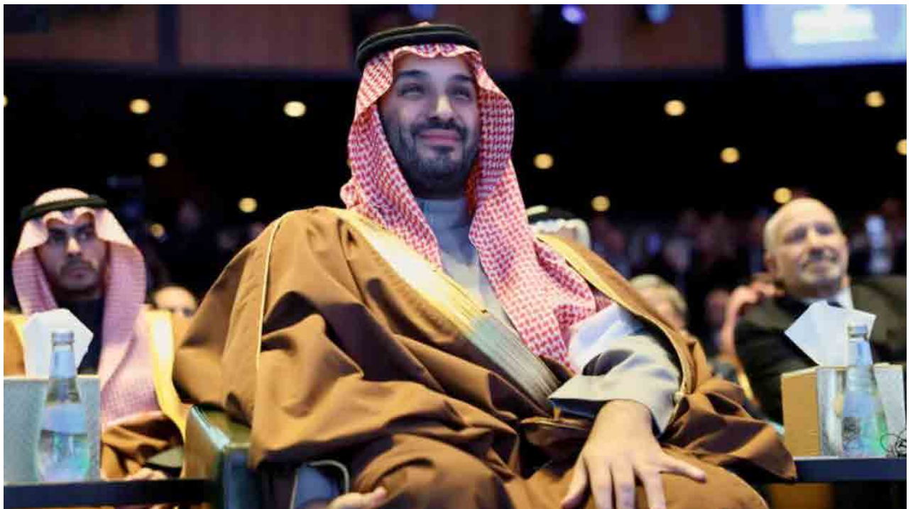
SAUDI ARABIA PRINCE: