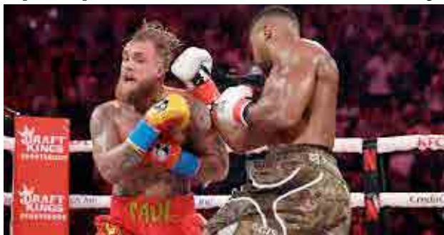
ANTHONY JOSHUA AND JAKE PAUL

The event, streamed globally by Netflix, drew celebrities including Rory McIlroy ringside.