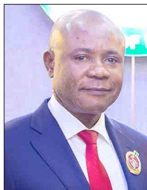
ENUGU GOV. PETER MBAH

He urged residents of the state to appreciate the gesture of the state government, noting that empowerment packages have also been put in place to support the people