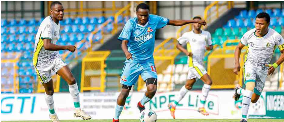
Bendel Insurance FC Humble Defending Champions Remo Stars