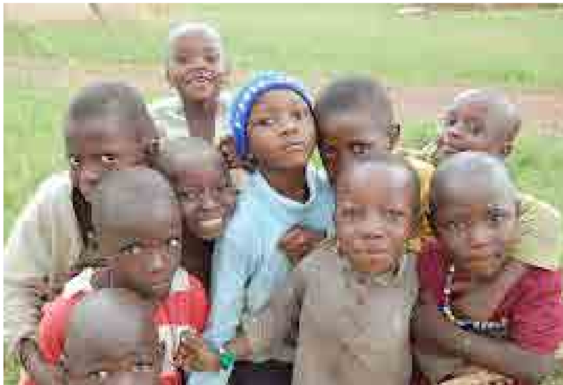
Nigeria children in the street

While her guardian was later convicted by a Benue State High Court, the long legal process and initial delays underscored the systemic weaknesses in Nigeria's child protection framework — from poor law enforcement to lack of safe reporting channels for victims.