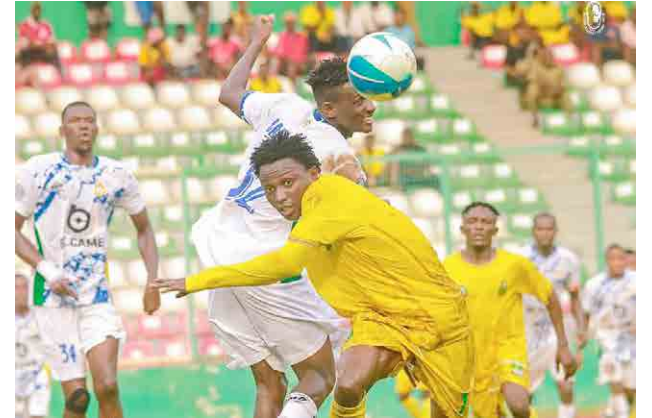
BENDEL INSURANCE FC

"I'm happy with the result and the performance of the players. It was important for us to end the first round of the season in a convincing victory and our last home game of the year on a positive note.