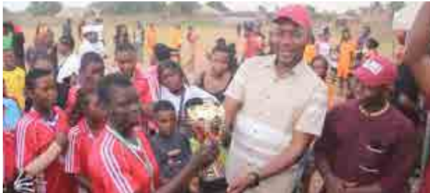
CROWNS BUDDY GROUP OF SCHOOLS WITH THE TROPHY

Speaking after the event, ULMI Financial Secretary, Mr