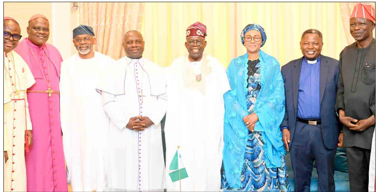
CAN VISIT TINUBU:

If you want, I can tighten them further for front-page national newspaper style or rewrite any single story for lead placement.