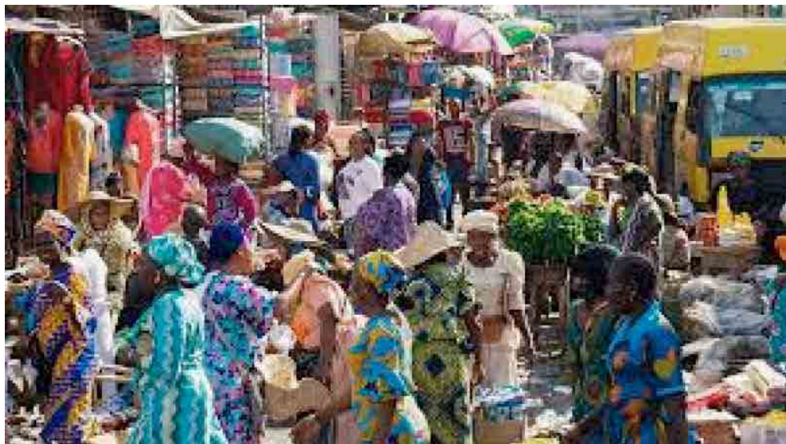
ITEMS ON DISPLAY IN LAGOS, WAITING FOR BUYERS

“The crave to take advantage of others or cash in on a season such as Yuletide to exploit others through in-