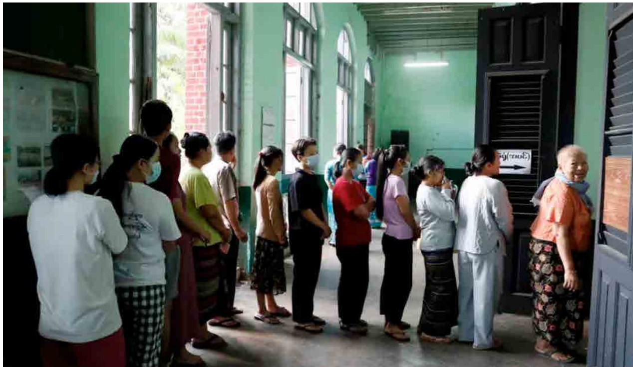
MYANMAR VOTERS QUEUE:

Voters queue to cast their ballots in Yangon, Myanmar.