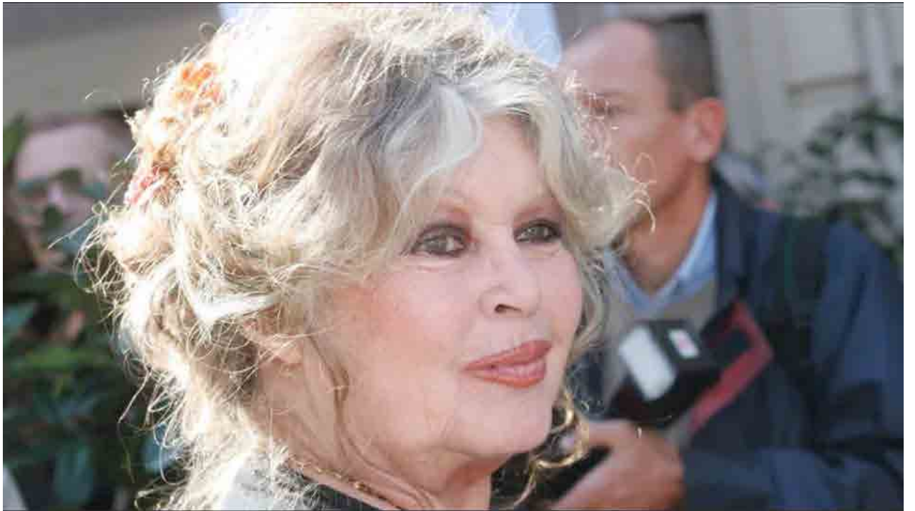
FRENCH ACTRESS DIES @ 91:

Their offensive into Uvira on December 10 forced tens of thousands of people to flee across the border into Burundi, overwhelming its capacity, according to the United Nations refugee agency, UNHCR.