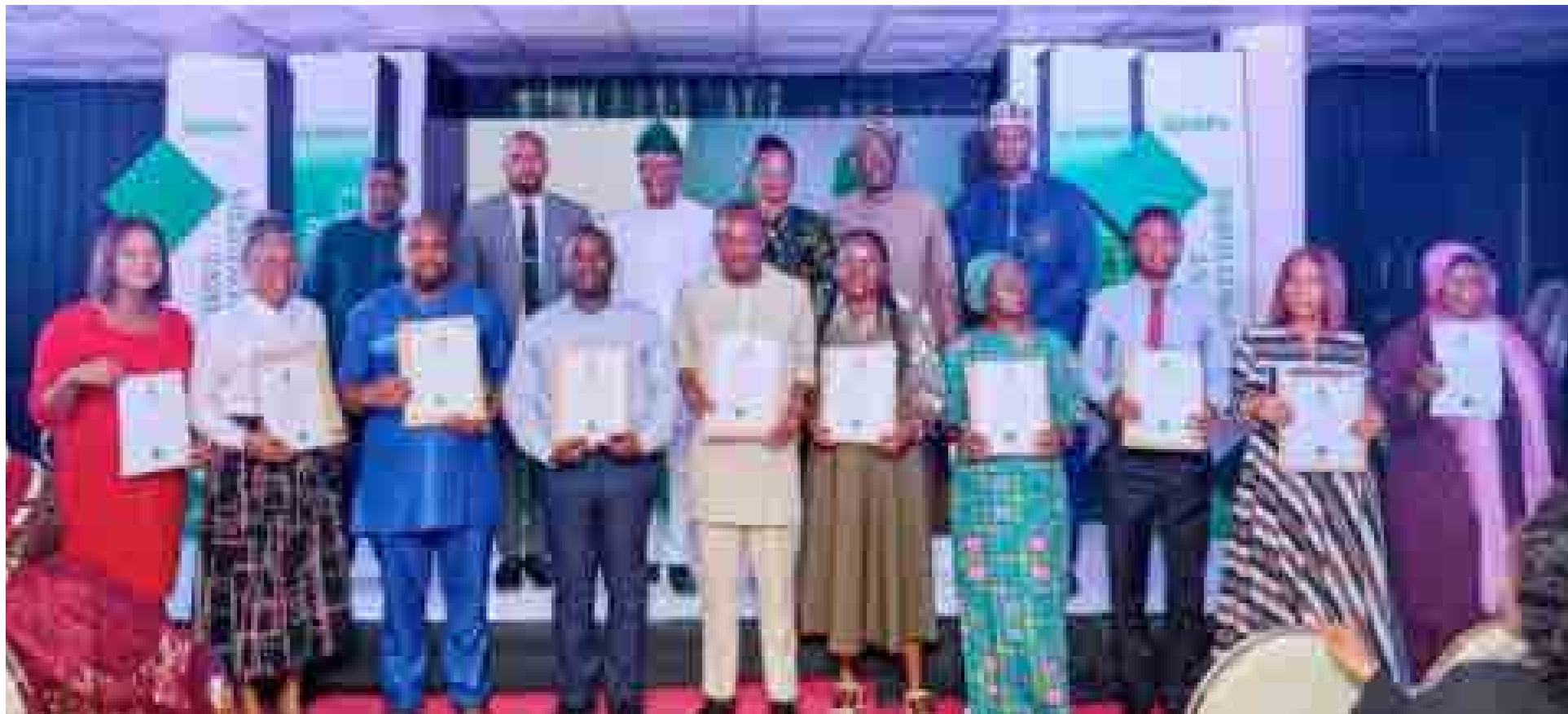
SMEDAN trains new BDSPs to boost SME growth nationwide. In a strategic move to strengthen Nigeria's small business ecosystem, the Small and Medium Enterprises Development Agency of Nigeria (SMEDAN) has inducted a new cohort of certified Business Development Service Providers (BDSPs)..