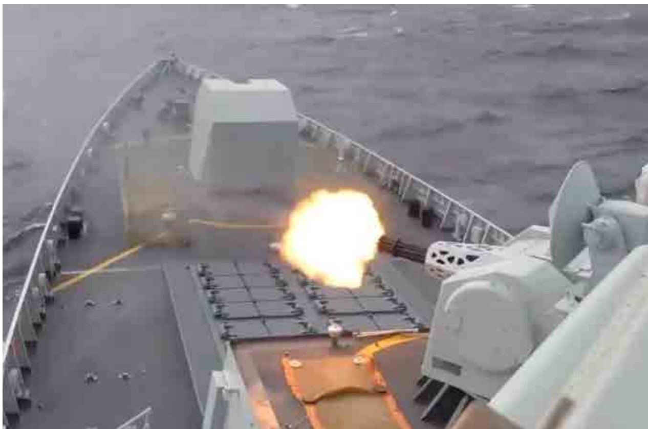
WARSHIPS BEING DEPLOYED:

The Chinese military published a video on Monday showing warships being deployed as it announced drills in the Taiwan Strait.