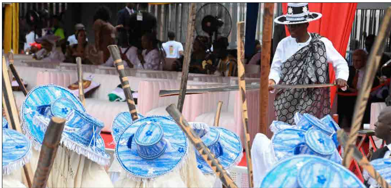
X: Lagos State Governor, Babajide Sanwo-Olu (right), in his cultural regalia, during the 73rd Adamu Orisa Play , popularly known as the Eyo Festival, at the Tafawa Balewa Square (TBS), Onikan, Lagos.

"As government cannot do it all alone, we call on public-spirited individuals, groups and organisations to partner with the Nigerian Correctional Service to sustain these reformation programmes," he said.