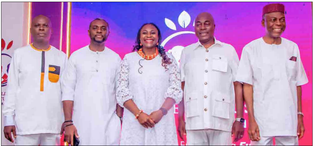
LAUNCH OF CLM FOUNDATION:

"Kaltungo stands to benefit significantly from improved transport infrastructure, which will enhance agricultural value chains, commerce, tourism and overall socio-economic development," he said.