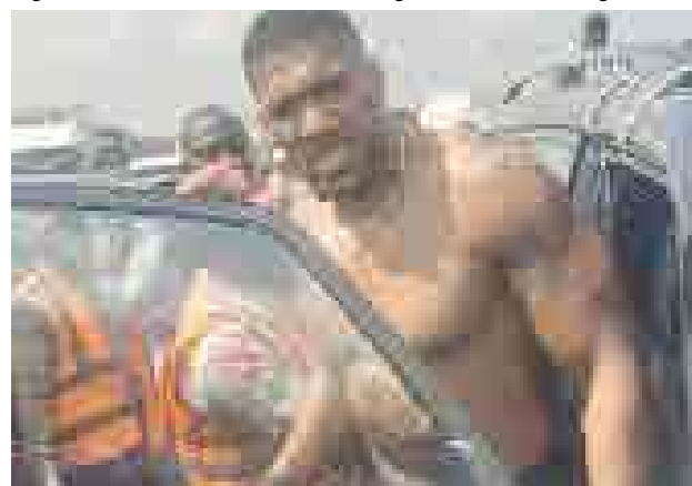
ANTHONY JOSHUA AFTER THE ACCIDENT

Nigerian-British boxing star Anthony Joshua was involved in a road accident on Monday in Makun, Ogun State.