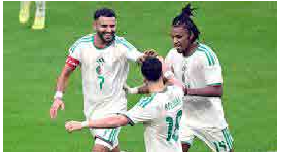
RIYAD MAHREZ WITH HIS TEAM MATE CELEBRATING

With goals flowing and margins tightening, the final group matches promise contests defined by composure as much as flair, a familiar AFCON pattern as the knockout stage looms