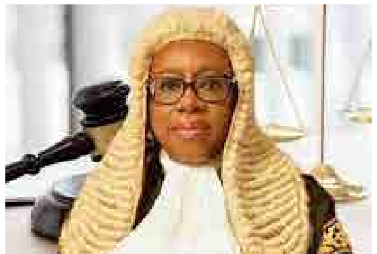
JUSTICE KUDIRAT KEKERE-EKUN

The question remains: can Nigeria's judiciary reclaim its role as an impartial arbiter, or will politics continue to overshadow justice?