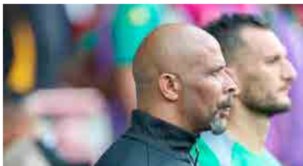
SUPER EAGLES COACH ERIC CHELLE

Super Eagles coach Eric Chelle says Nigeria's final Group C match against Uganda will be decided by intelligent player management, not complacency.