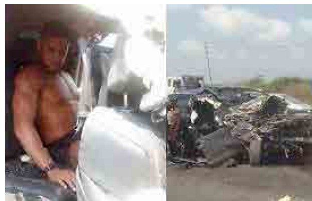
FATAL ROAD ACCIDENT

Preliminary findings indicate that the Lexus Jeep, which was suspected to be travelling beyond the legally prescribed speed limit on the corridor, lost control during an overtaking manoeuvre and crashed into a stationary truck well packed by the side of the road. The primary causes of the crash being excessive speed and wrongful overtaking constitute serious traffic violations and remain among the leading causes of fatal road crashes on Nigerian highways.