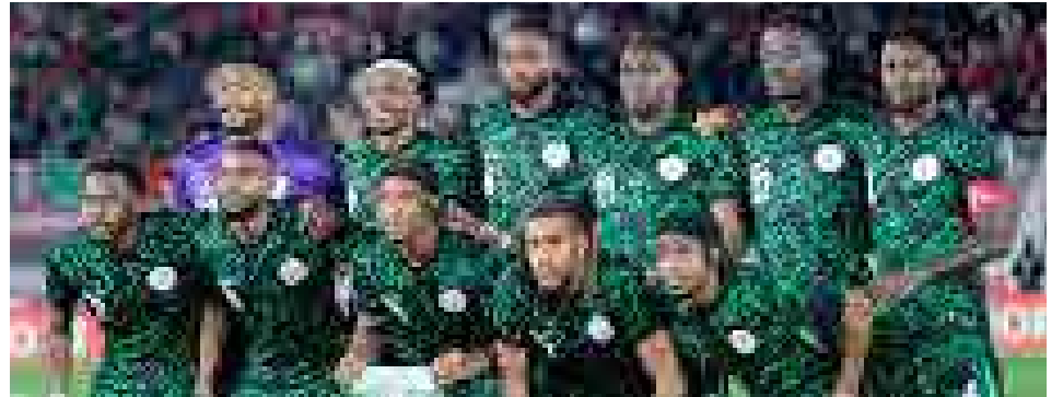
SUPER EAGLES PLAYERS

A final call on the duo's availability is expected to be made after further medical assessments ahead of the match on Tuesday.