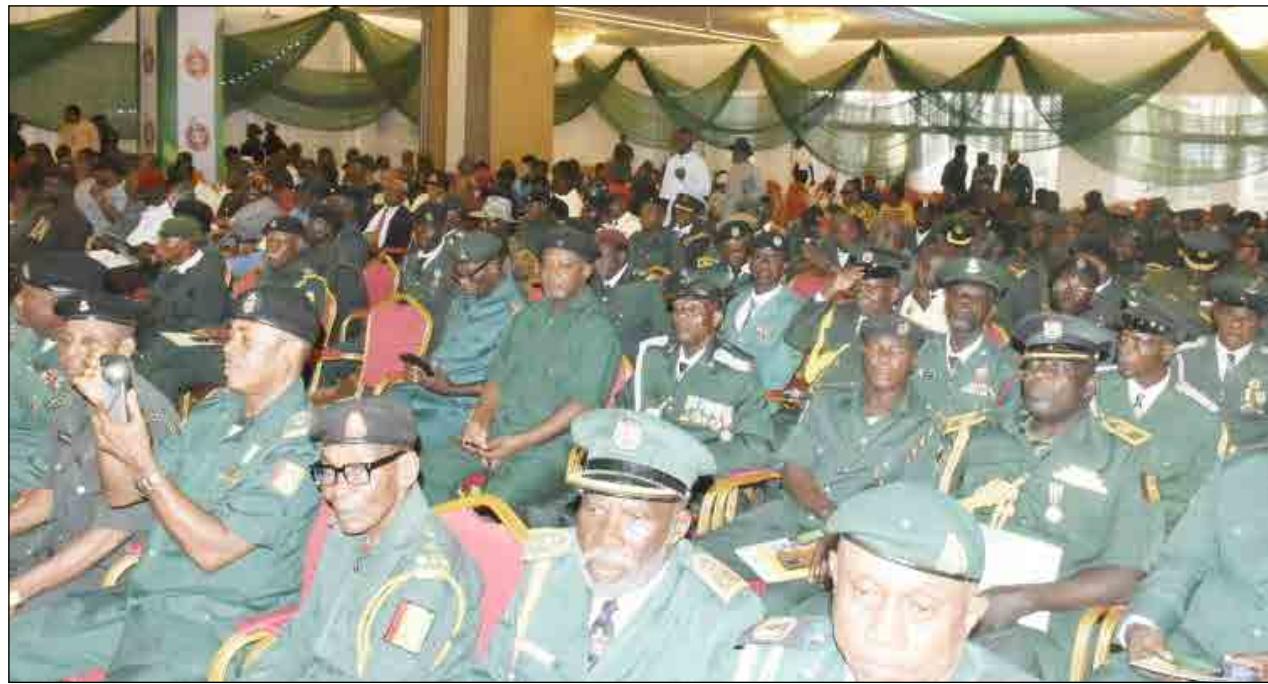
LUNCH OF 2026 EMBLEM APPEAL FUND:

Ezeamama warned that irreparable loss would be suffered if the defendants were allowed to proceed with the allocation of the fields to third parties.