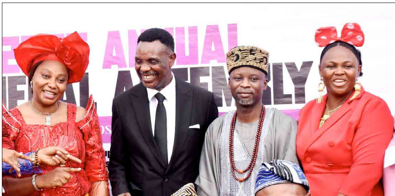
CHRISTMAS WOMEN EMPOWERMENT OUTREACH: