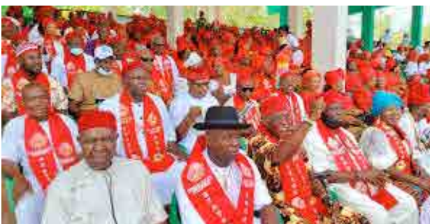
IGBO CULTURAL DEVELOPMENT

“We are ensuring the Igbo narrative is documented, defended, and dignified,” the president-general emphasised.