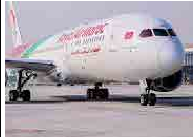
ROYAL AIR MAROC

For Team Nigeria, the bright spots were clear. Weightlifting delivered crucial gold medals, while athletics once again proved to be a reliable medal factory, keeping the country firmly inside the top six.