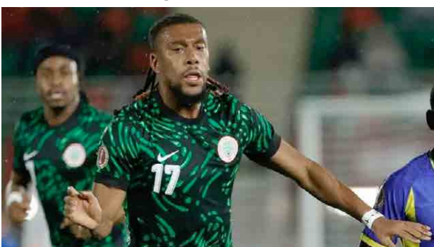
LOOKMAN AND IWOB

Tanzania threatened sporadically on the counter, with Stanley Nwabali called into action to deny Simon Msuva and Tarryn Allarakhia, but Nigeria’s pressure continued to build.