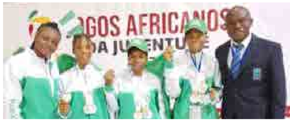
NIGERIA WEIGHTLIFTING ATHLETICS

"Onboard comfort also allows you to work mid-flight," he said.