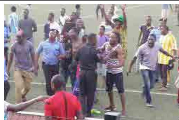
INCIDENTS AT GOMBE UNITED