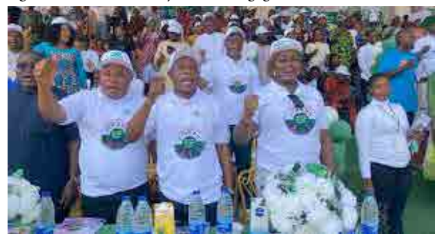
GRASSROOTS MOVEMENT FOR TINUBU COMMITTEE

Banjo commended the initiative behind the sports festival, noting that it would engender grassroots development end engagement.