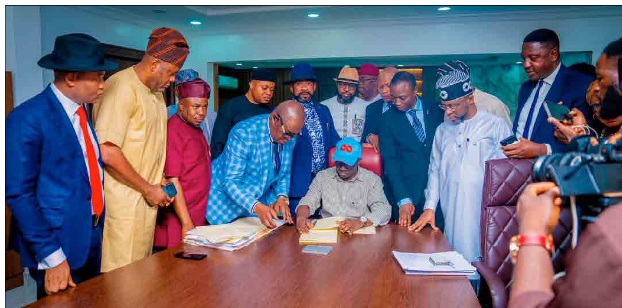
SIGNING THE 2026 APPROPRIATION BILL:

He then formally presented the 2026 Appropriation Bill to the governor for assent, marking another milestone in the state's drive for growth, stability and inclusive development.