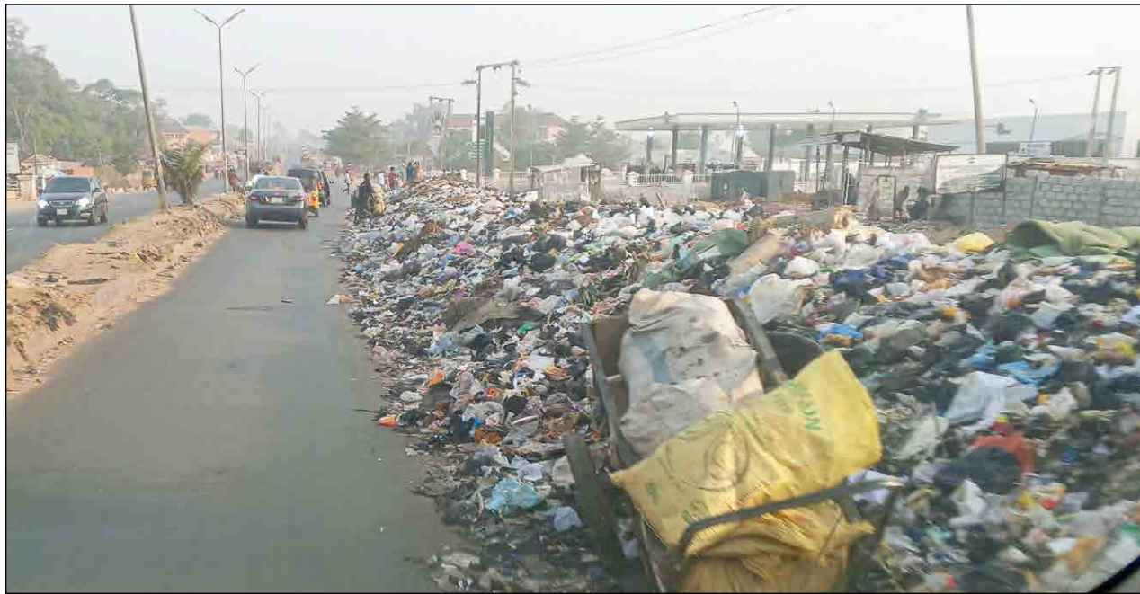
JIKWOYI-KARSHI ROAD ABUJA:

The technical session was formally declared open, with participants expected to contribute to shaping a business-friendly environment that drives investment, job creation and inclusive economic growth in the state