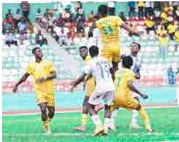
BARAUCFC AND NASARAWA UNITED

Nasarawa United United Football Club on Tuesday played a goalless draw with Barau FC of Kano in the matchday 18 fixture of the 2025/2026 Nigeria Professional Football League (NPFL).