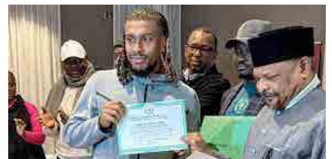
IWOBI RECEIVED CERTIFICATES FOR THE ALLOCATED PLOTS OF LAND AND HOUSING UNITS PROMISED BY THE PRESIDENT