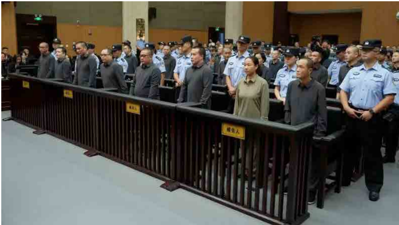
MEMBERS OF THE MING MAFIA:

Russia has intensified its strikes on key infrastructure targets in recent months, leaving many people in Ukraine to face freezing temperatures without heating or power.