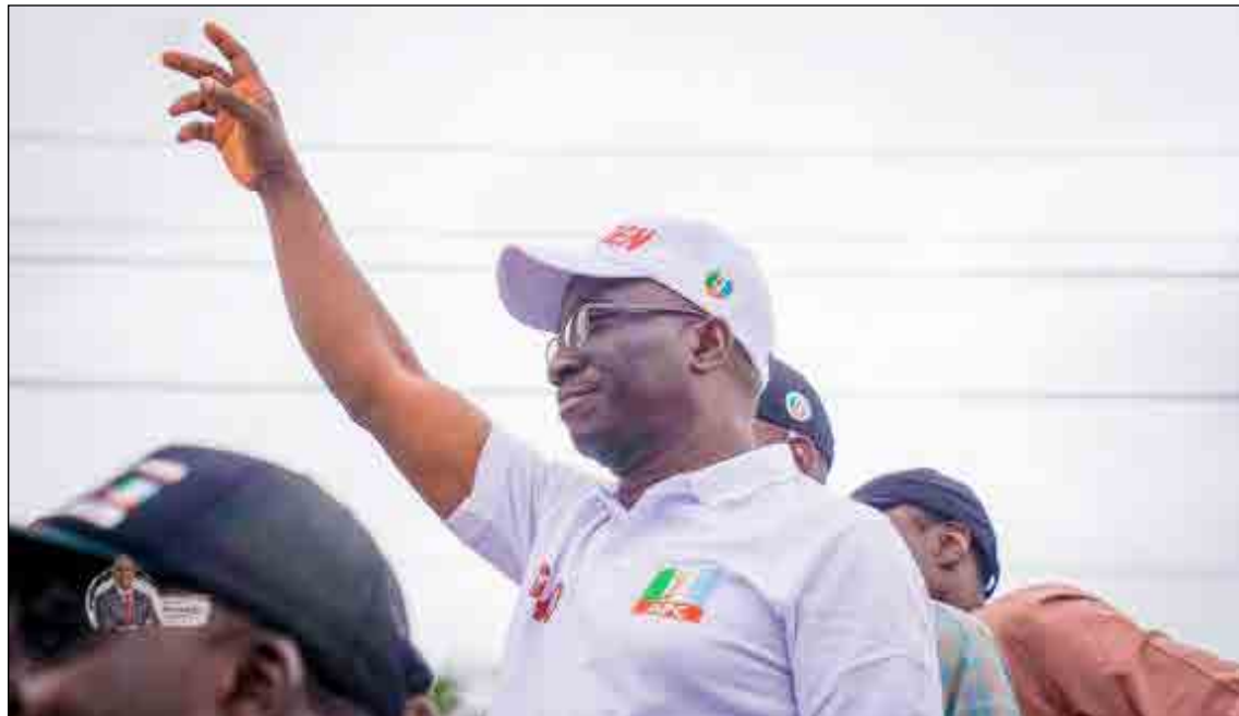
EDO STATE GOVERNOR, SENATOR MONDAY OKPEBHOLO

These shortcomings might have been avoided had an Orhionmwon indigene occupied the senatorial seat. With effective representation, the road project would likely have been com-