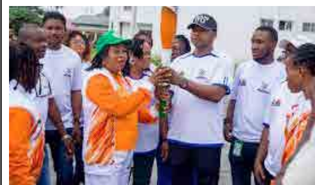
AKWA IBOM LIAISON COMMITTEE

achievements recorded for the State in the Sports, an official approval was granted by the Ministry of Education to formally introduced rugby to 15 secondary schools as a pilot program of integrating Rugby into the school sports system. This has been the results of the "Catch Them Young" Rugby initiative planted since 2012 in Edo State, which has led to consecutive gold medal wins at the National U-15 Youth Games and beyond.