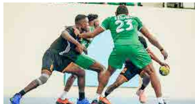
HANDBALL AT NIGER DELTA GAMES

"The first Niger Delta Games in Uyo was U-25. We needed the elite class to embrace the program. We all know that anything above 20 years are close to retirement depending on levels of injuries, bringing us back to the problem we intend solving. Talents discovered in this U-20 category has longer competition years," he stated.