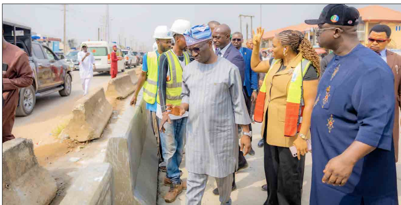
INSPECTION OF PROJECTS:

While commending security agencies for deploying personnel to Kajuru, Ayuba stressed the need for proactive, sustained and intelligence-driven preventive operations, especially in vulnerable rural communities.