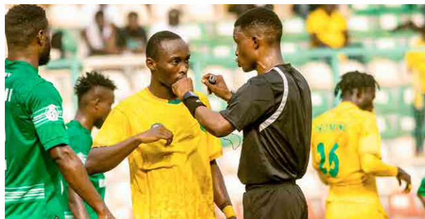
BENDEL INSURANCE FC

Recall that Bendel Insurance FC and Barau FC in their first round meeting on September 7, 2025 also settled for a 1-1 draw this season.