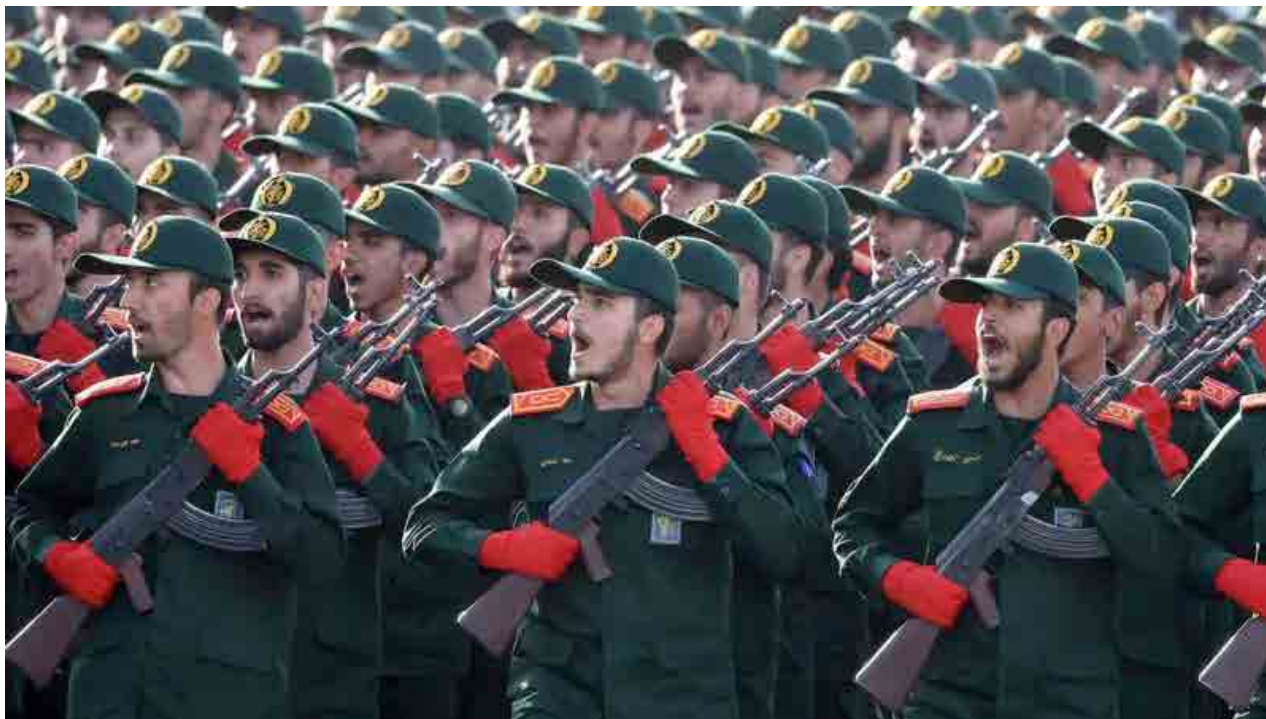
IRAN GUARD CORPS:

"The situation is under control. There is no need to worry," the Anadolu news agency quoted a foreign affairs ministry official as saying, without elaborating.