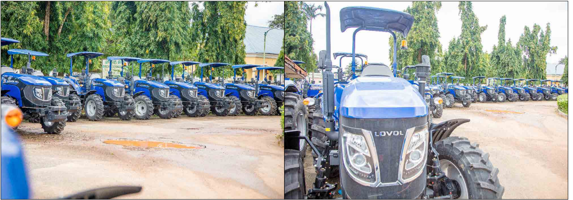
THE 30 TRACTORS COMMISSIONED EQUIPMENT