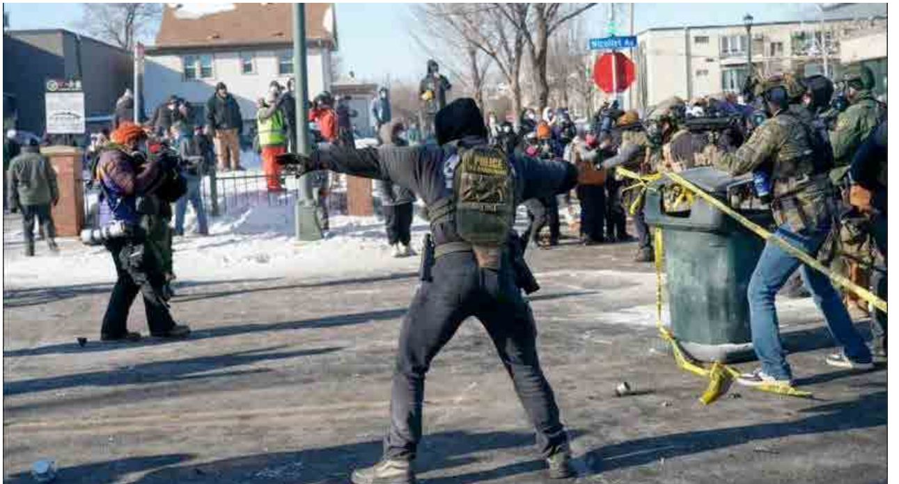
POLICE CLASH PROTESTERS: Protesters and police clash at the scene of the shooting

"On behalf of the African National Congress, we really want to salute workers under the leadership of NUMSA for uniting all of us under one banner of international solidarity, a stand against imperialist aggression, as well as the dictatorship of one man who wants to break the sovereignty of each and every nation."