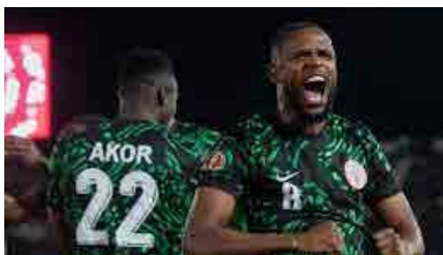
EAGLES PLAYERS CELEBRATE AFTER SCORING A GOAL

The Confederation of African Football (CAF) has appointed a predominantly Cameroonian officiating team for Nigeria's Round of 16 encounter against Mozambique at the ongoing Africa Cup of Nations (AFCON) 2025 in Morocco.