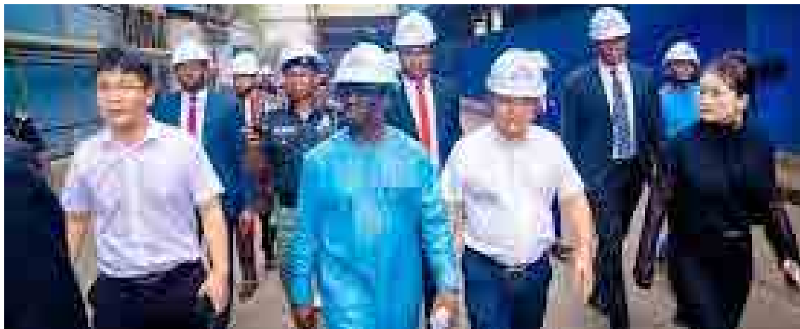
GOVERNOR MONDAY OKPEBHOLO WITH THE CONTRACTOR OF THE NEW EDO LINE

To appreciate the significance of this revival, one must recall the foundation