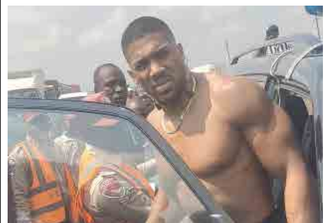
ANTHONY JOSHUA AT THE ACCIDENT SCENE

He sustained a leg fracture but was reported to be in stable condition and did not require emergency medical intervention. Joshua was discharged from hospital on New Year's Eve and returned to the United Kingdom on Saturday.