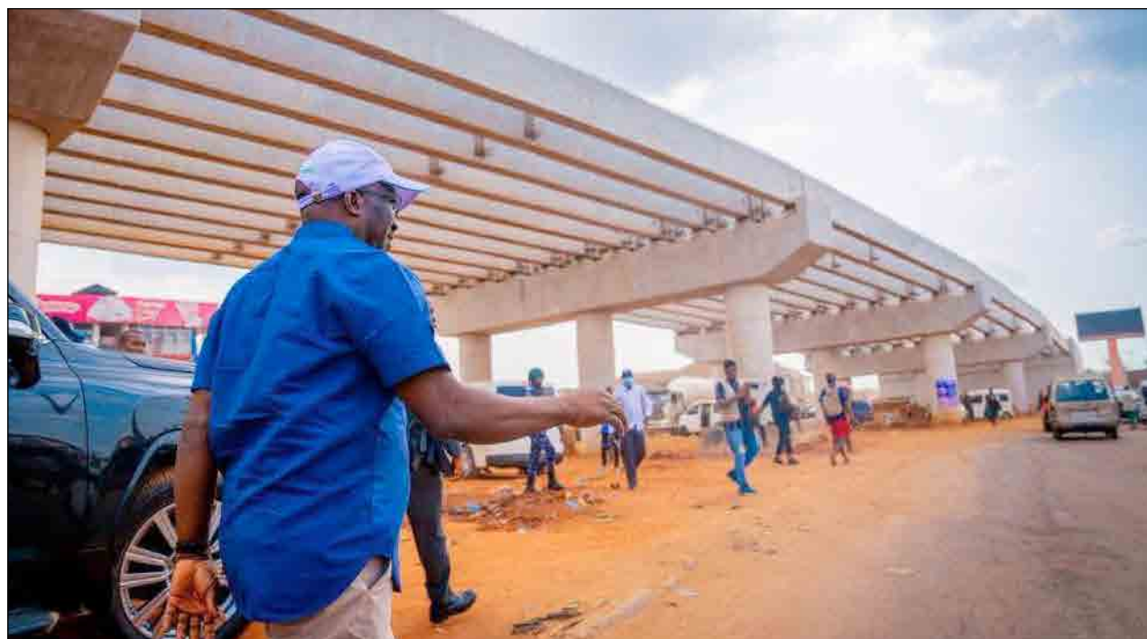
INSPECTING FLYOVER PROJECT: