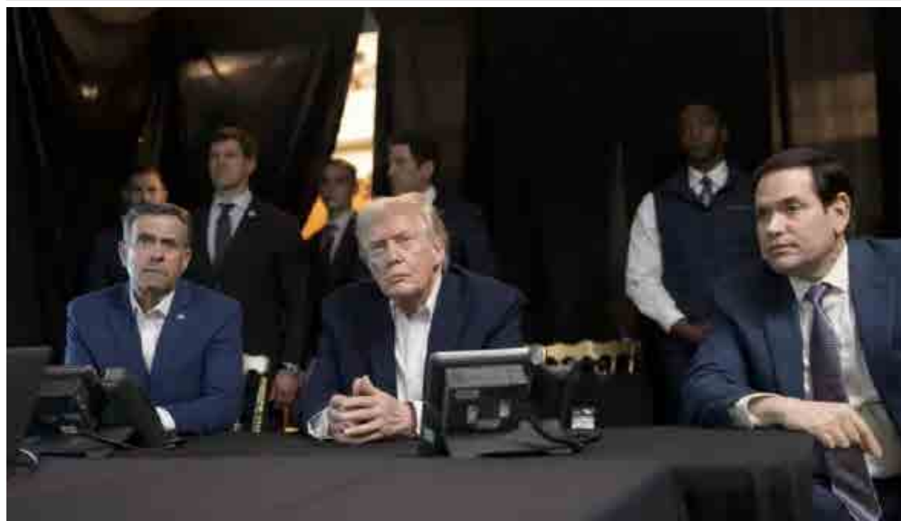
WATCHING A LIVE STREAM:

I was in Haiti in 1994 when President Bill Clinton sent in 25,000 troops and two aircraft carriers to enforce regime change. Then, the Haitian regime crumbled without a shot being fired. Far from ushering in a better future, the 30 years since then have been a period of almost unbroken misery for the Haitian people. Haiti is now a failed state dominated by armed gangs.