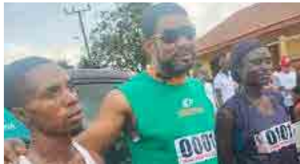
ABUJA 21KM MARATHON WINNER

sure him that by next year, we will do more," he assured.