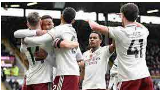
DECLAN RICE CELEBRATE WITH TEAM MATE

Declan Rice celebrated with his teammates after scoring his second goal for Arsenal.