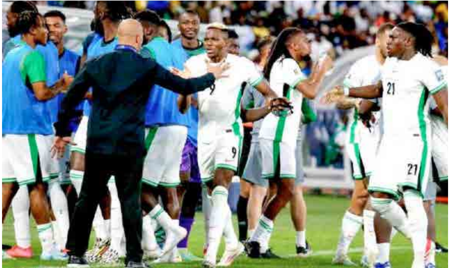
SUPER EAGLES CELEBRATING AFTER QUALIFY FOR THE ROUND 16