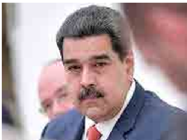
PRESIDENT NICOLÁS MADURO'S

The National Construction Authority found that 58% of the buildings in Nairobi were unfit for habitation.