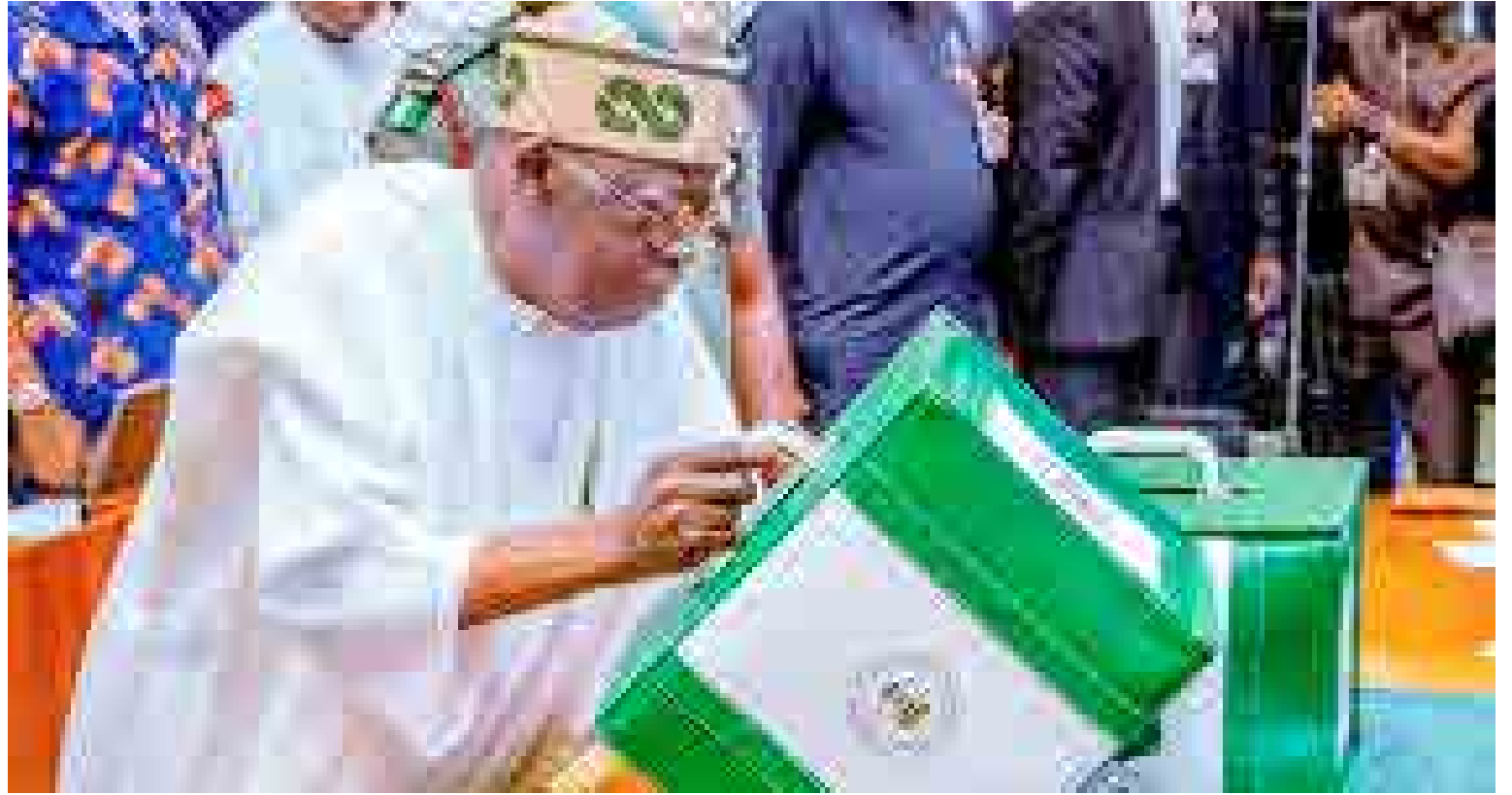
PRESIDENT BOLA TINUBU PRESENTED THE 2026 BUDGET

"Though necessary, the reforms have not been painless. Families and busi-