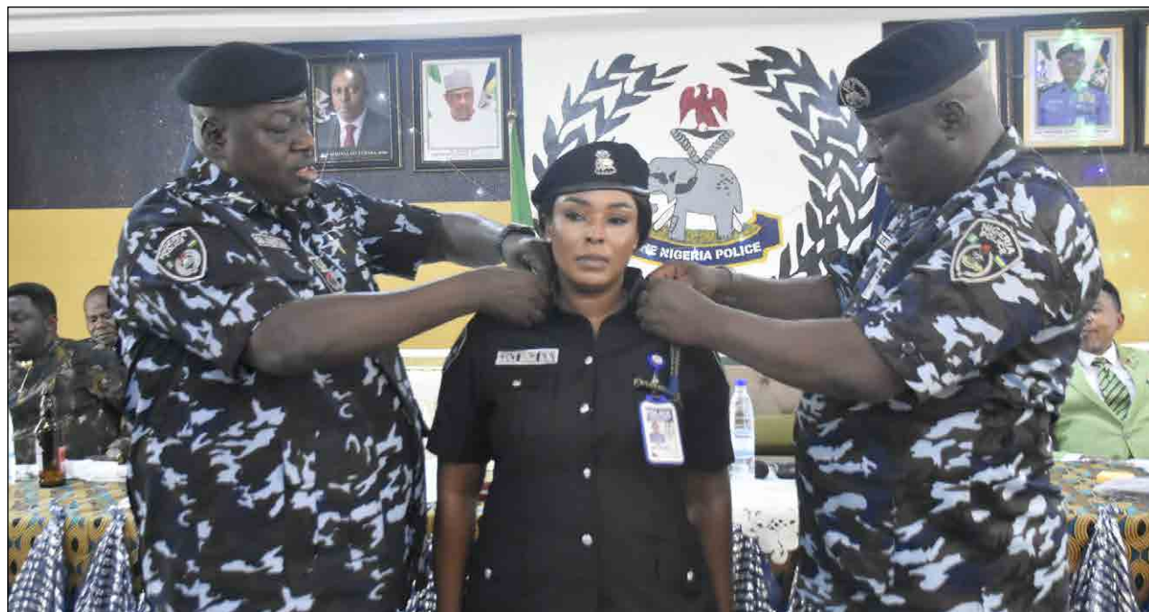
DECORATING THE PPRO:

Abang said the bill was expected to enhance the economic, ecological and developmental value of the Boki forest and its surrounding communities