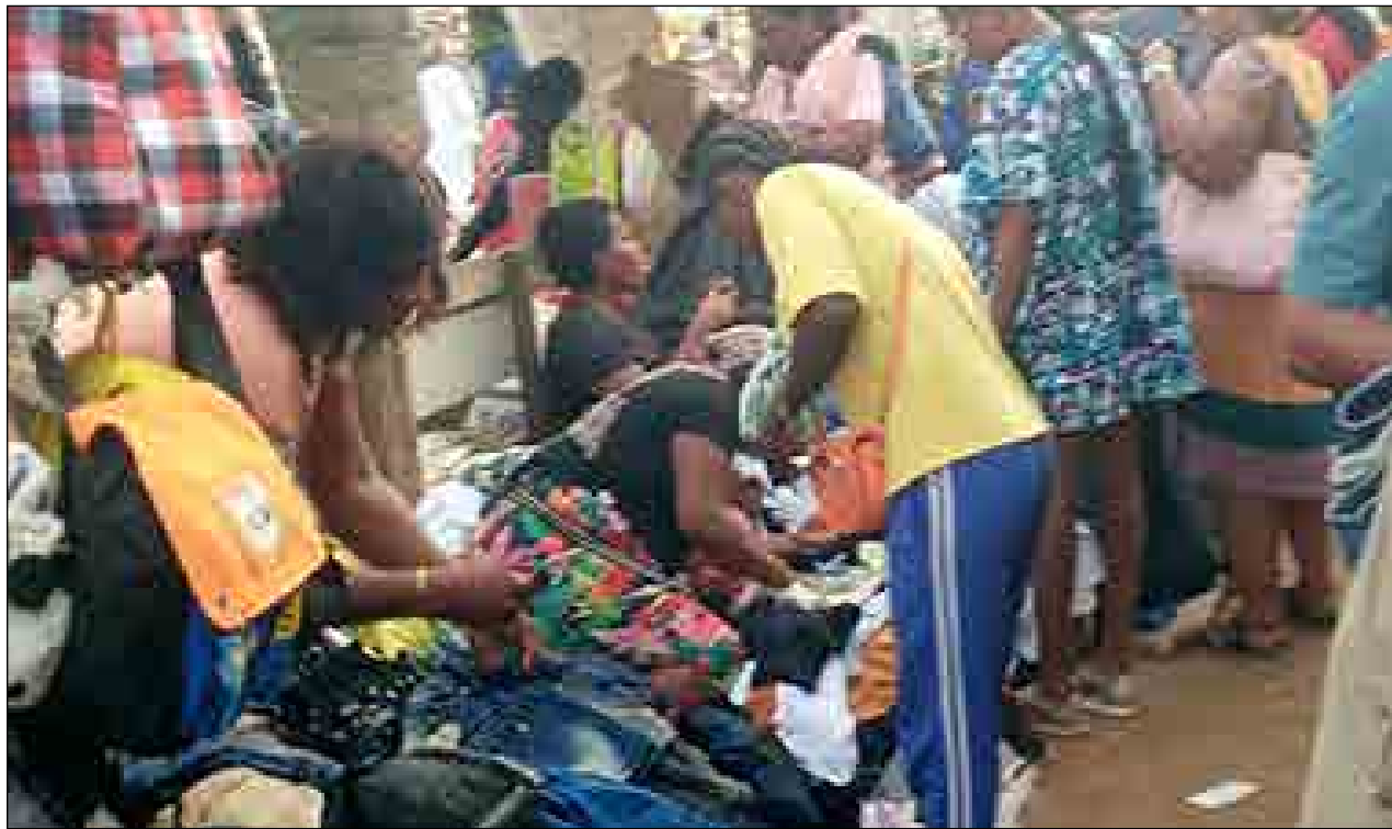
PATRONISING SECONDHAND CLOTHES: