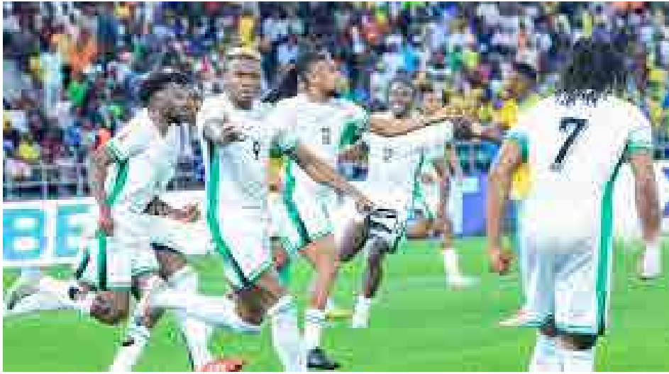
SUPER EAGLES OF NIGERIA

Super Eagles coach Eric Chelle has welcomed the pressure of the Round of 16, expressing excitement as Nigeria prepare for the knockout phase of the Africa Cup of Nations (AFCON).