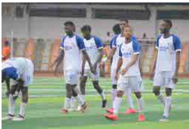
BAYELSA UNITED PLAYERS

"Survival is not the objective. Our target is to finish in the top half of the league and compete for continental tickets. Anything less will not justify the level of support and resources committed to this club," he said.