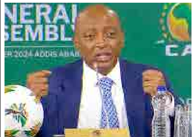
CAF PRESIDENT, PATRICE MOTSEPE

The source noted that North Africa hosted AFCON 2019 in Egypt and will host the 2025 edition in Morocco, while East Africa is set to stage the 2027 tournament in Kenya, Tanzania, and Uganda. West Africa, through Ivory Coast, and Central Africa, through Cameroon, hosted the 2021 and 2023 editions respectively.