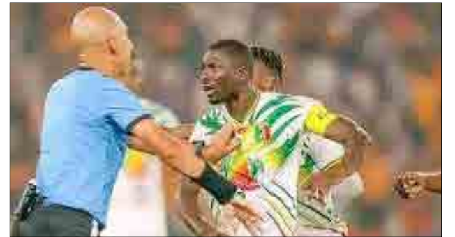
EQUATORIAL GUINEA PLAYER WITH REFEREE

With AFCON entering its decisive stages, the message from CAF is simple, emotions may run high, but referees are firmly off-limits.