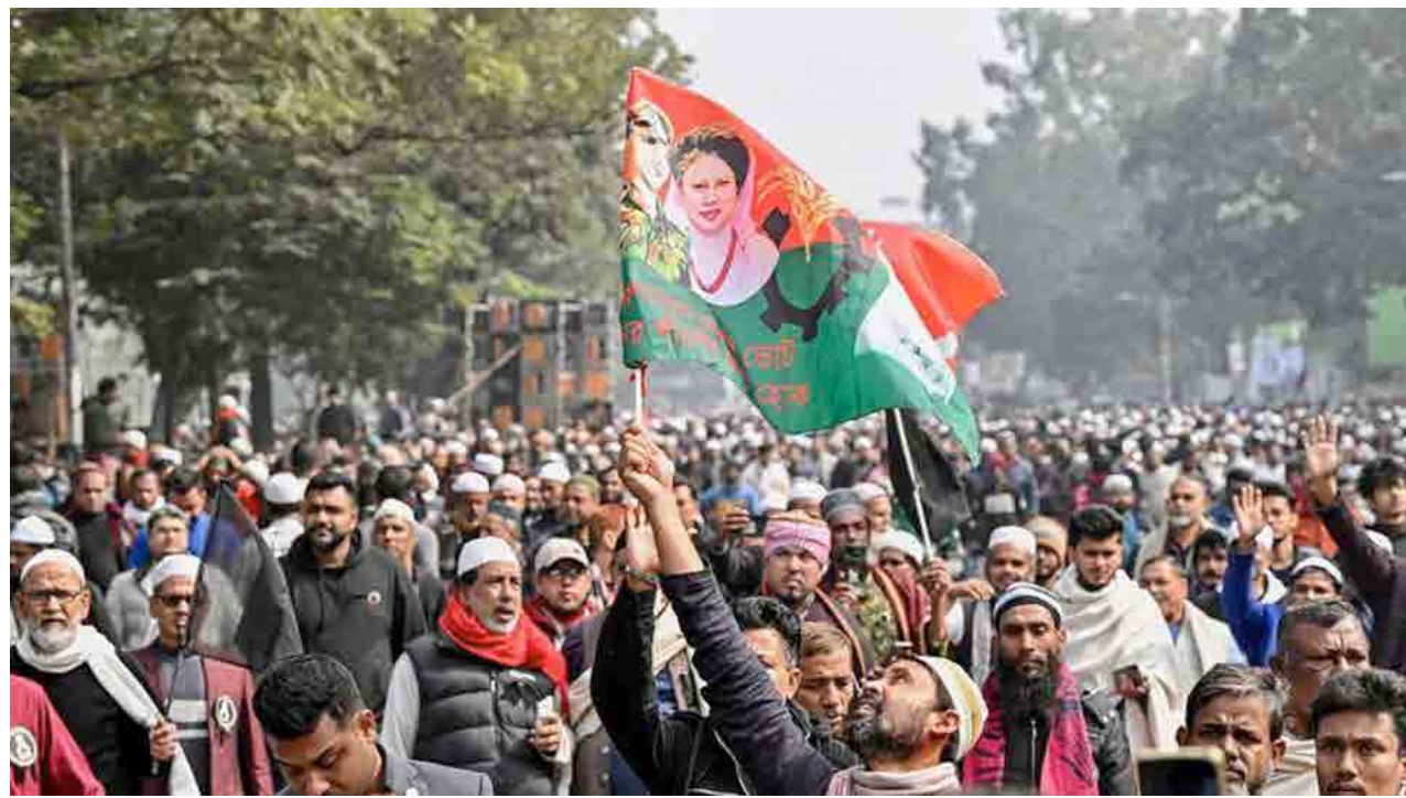
PEOPLE GATHERED AS A MOTORCADE:

In 2011, officials implemented a daily cap on visitors to protect and preserve the site, but concerns remain about overtourism.