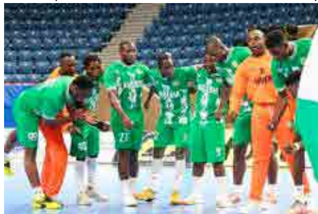
NIGERIA'S SENIOR MEN'S HANDBALL TEAM CELEBRATING