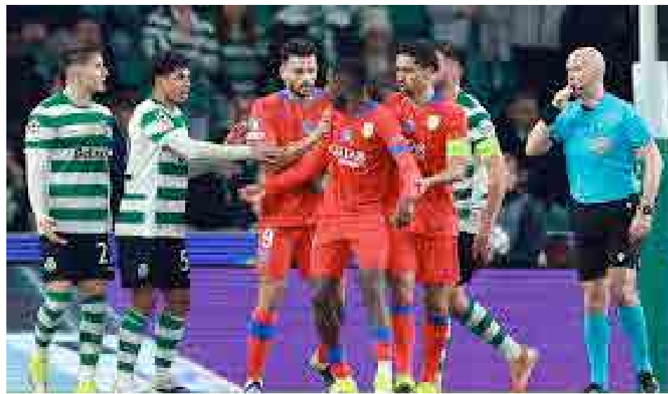
PARIS SAINT-GERMAIN FALTERED IN PORTUGAL