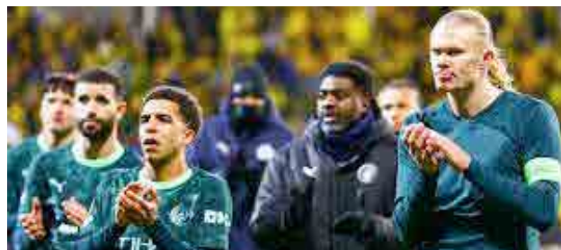
MAN CITY PLAYERS

"Our supporters mean everything to us ... it was a lot of travelling for the fans who supported us in the freezing cold throughout a difficult evening for us on the pitch," they said on Wednesday