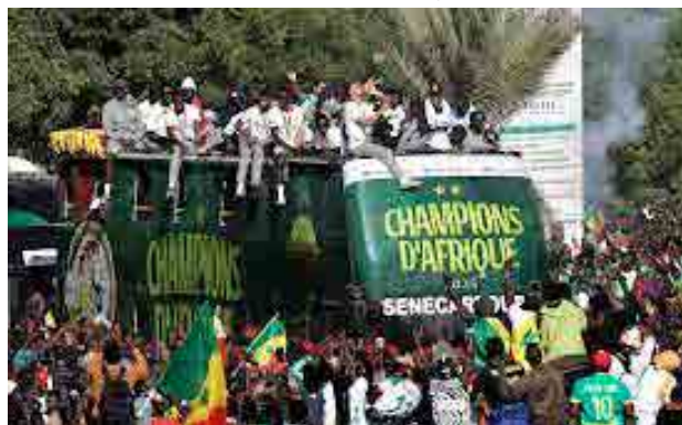
SENEGAL VICTORY PARADE

The new IMF mission chief travelled to Senegal for an introductory visit this week.