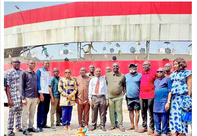
NIGER DELTA DEVELOPMENT COMMISSION (NDDC)

"Samuel Ogbemudia Stadium is as good as the Uyo Stadium and should be considered for international fixtures," he said.