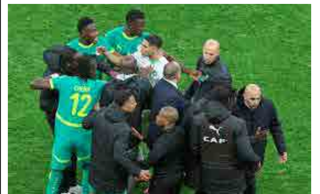
MOROCCO TEAM IN CONTROVERSIES

He added that the unfortunate open disputations of decisions by referees almost marred the AFCON 2025, saying that was unacceptable.