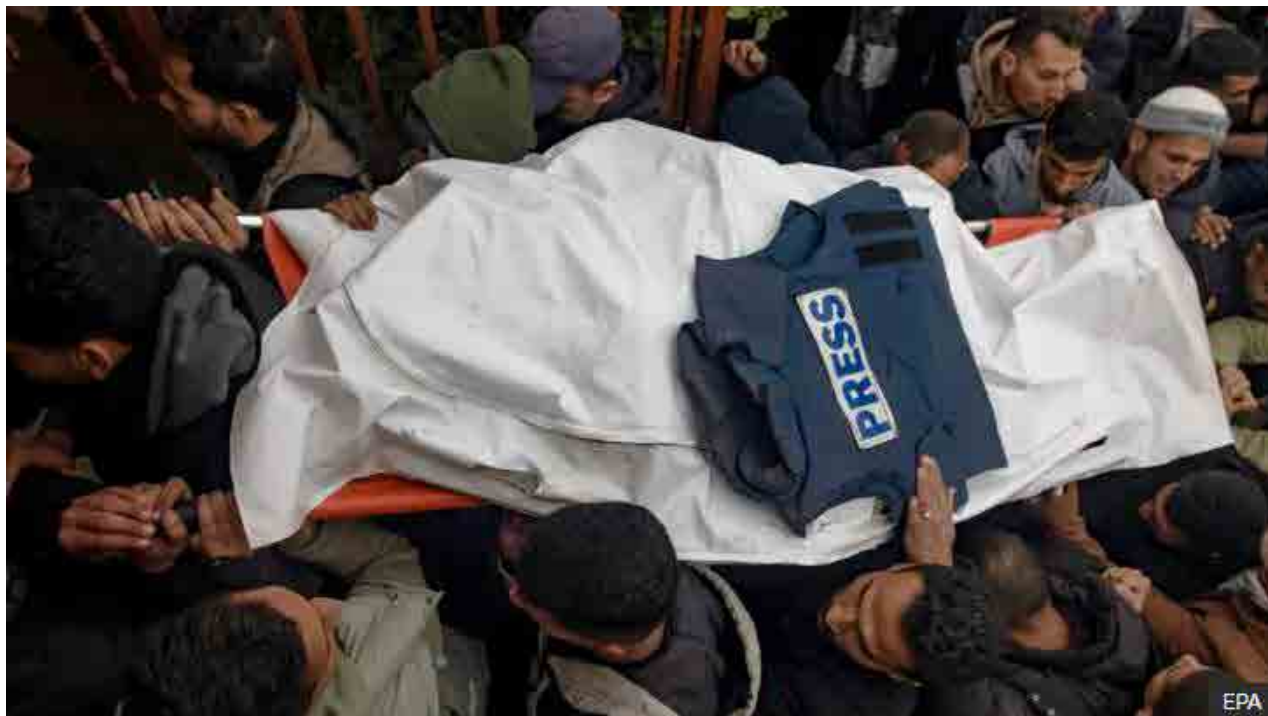
BODY CARRIED BY MOURNERS:

In the US, the Dow Jones, S&P 500 and the Nasdaq all rose by around 1% in early trading on Wednesday. Meanwhile the FTSE 100 in London was around 0.25% higher.