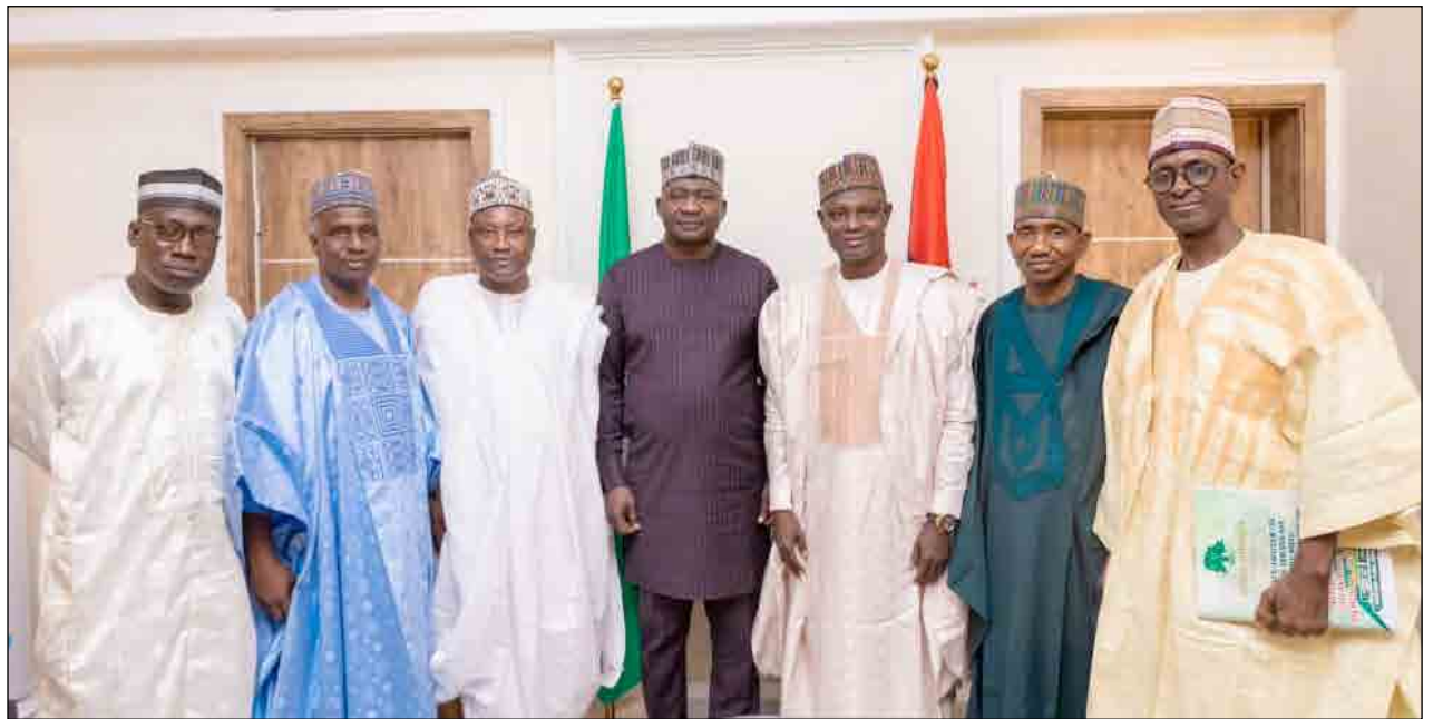
VISIT TO MINISTER OF DEFENCE:

The academy is part of DHL's broader GoHelp Programme partnership with IOM, which includes humanitarian logistics initiatives worldwide.