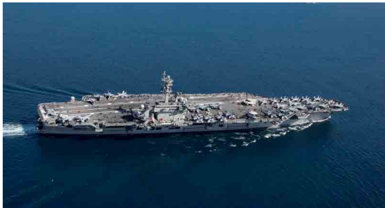
AIRCRAFT CARRIER USS:

He added: "Part of the reason for engaging with China is so that issues where we disagree can be discussed, and the issues where we agree can be progressed, and so that's the approach."