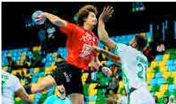
AFRICAN MEN'S HANDBALL CHAMPIONSHIP

Morocco rallied strongly after trailing by five goals, with Amjad Saa and Mohammed Ezzine scoring eight and seven goals respectively.