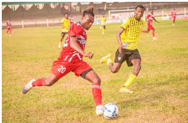
Plateau United vs Rangers