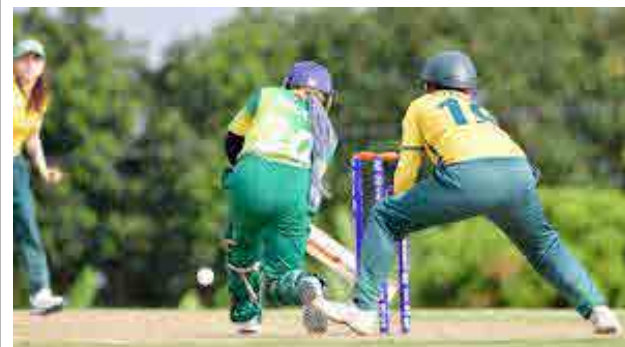
UNDER 17 CRICKET CHAMPIONSHIP

"The zonal qualification for the six geo-political zones is scheduled for a window period of between Feb. 10 to Feb. 23.