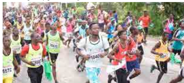
ACCESS BANK LAGOS CITY MARATHON

Organisers explained that while all registered runners are permitted to compete at their own pace within the official race window, the stipulated cut-off time applies strictly to medal qualification and not to partici-