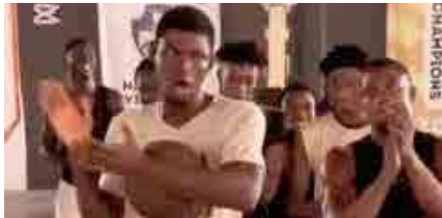
RIVERS STATE BASKETBALL PLAYERS