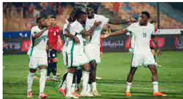
SUPER EAGLES CELEBRATING

Super Eagles face hosts Morocco in a blockbuster AFCON 2025 on Wednesday at the 70,000-capacity Prince Moulay Abdellah Stadium, from 8 p.m. (Nigerian time).