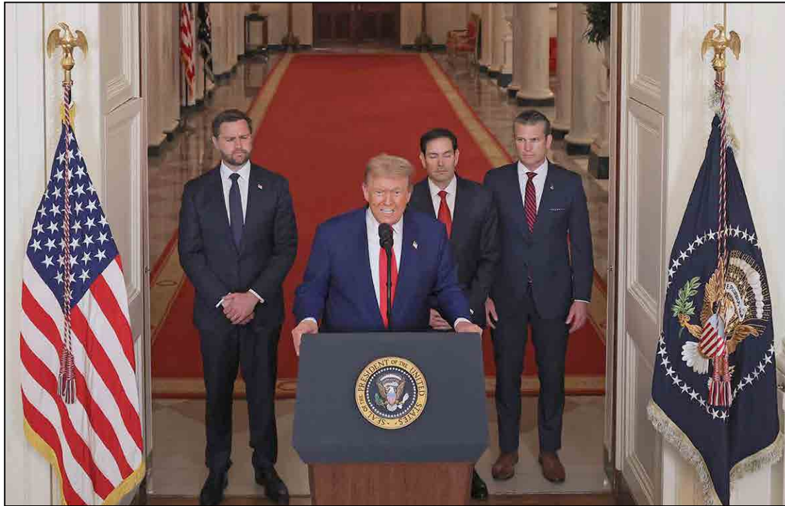
PRESIDENT OF THE UNITED STATES OF AMERICA, DONALD TRUMP, DURING A STATE OF THE UNION ADDRESS IN WHITE HOUSE

Critics argue that the use of domestic criminal law as a tool to effect regime change undermines the foundational prohibition on the use of