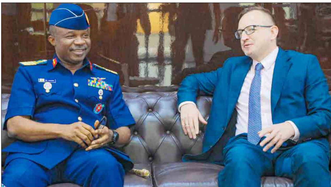
AMBASSADOR VISITS NAF: