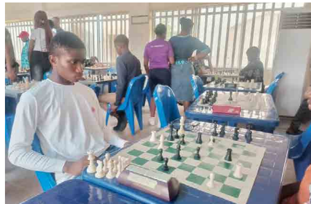
1ST BENIN CITY U-25 RAPID CHESS TOURNAMENT

The Edo Chess Association secretary called on well-meaning Edo people, particularly those in the diaspora to support the Association which yearns for regular competition for the athletes which is only possible through sponsorship of tournaments to sharpen the skills of the athletes