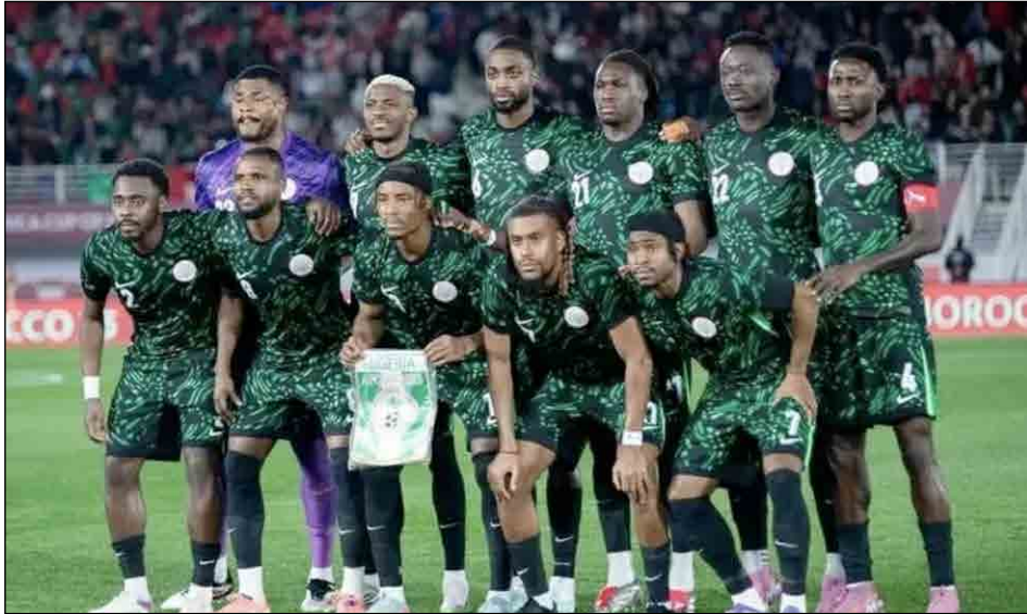
The Nigerian Super Eagles in one of the games in AFCON 2025.