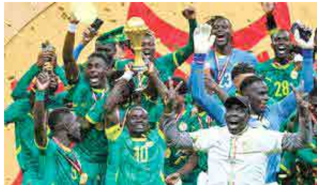
AFCON 2025 CHAMPION

The 2025 Africa Cup of Nations (AFCON), hosted by Morocco, combined high-scoring football, strong organisation and intense controversy, as the continent's flagship tournament unfolded across four weeks.