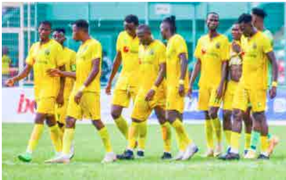
Bendel Insurance FC

The Benin Arsenal remained gallant in defeat to 3SC with 32 points and will now shift their focus to the midweek (January 28) fixture against Barau FC at the Samuel Ogbemudia stadium in Benin. Kick off time is 4pm.