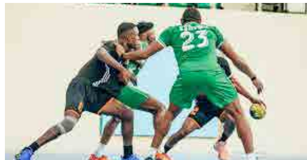
NIGERIA HAND BALL PLAYERS

T he National Sports Commission (NSC) has confirmed Nigerian athletes will attend a four-week residential training camp in Scotland ahead of the 2026 Commonwealth Games.