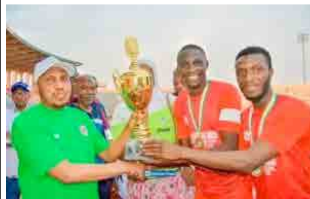
KATSINA SWAN LIFT DIKKO CUP

Presenting the trophies, the Commissioner of Sports, Sirajo Yazid-Abukur, commended the organisers for not only bringing participants, spectators and other people together but also fostering unity amongst them.