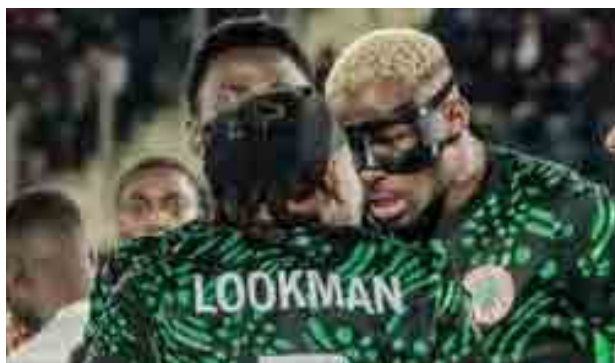
LOOKMAN AND VICTOR OSIMHEN

"These are big players like Osimhen and he must be careful about that," he advised.