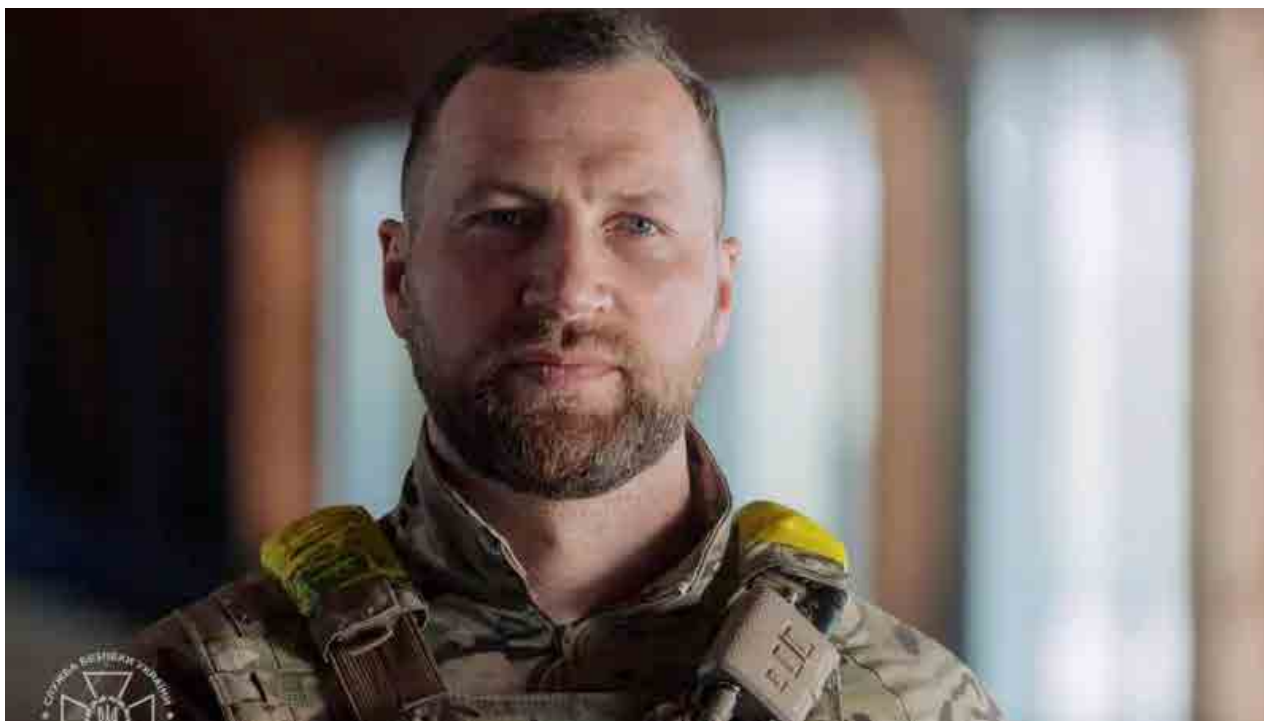
SECURITY SERVICE CHIEF: