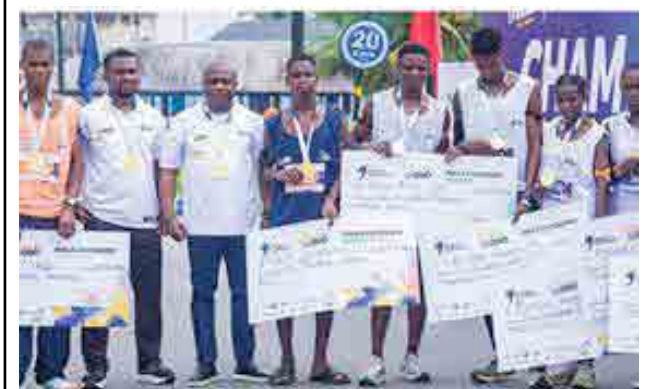
OPOBO MARATHON COMPETITION