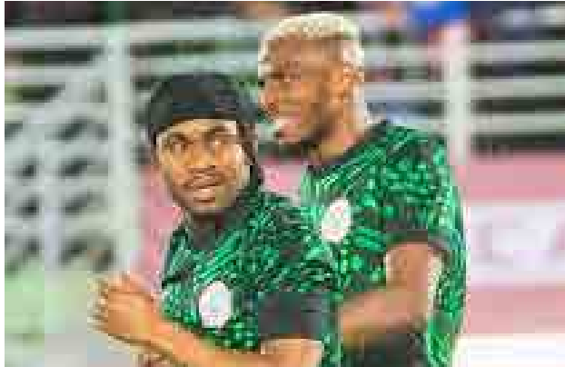
LOOKMAN AND VICTOR OSIMHEN