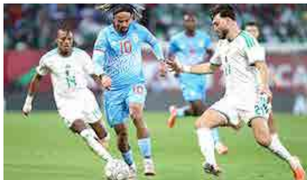
ALGERIA VS DR CONGO

DR Congo, however, looked more incisive on the counter. Cedric Bakambu went close in the 25th minute after breaking quickly, only for Luca Zidane to smother his low drive.