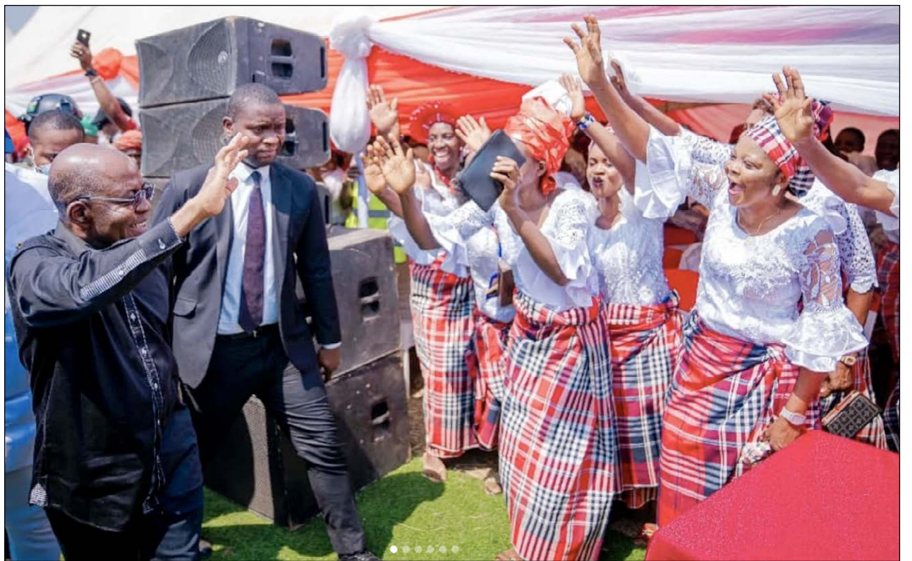
FLAG OFF OF RECONSTRUCTION:

The World Bank and the International Monetary Fund have consistently advocated the removal of energy subsidies and the floating of the naira, saying failure to effect the two economic policies has plunged Nigeria into severe inflationary pressure.