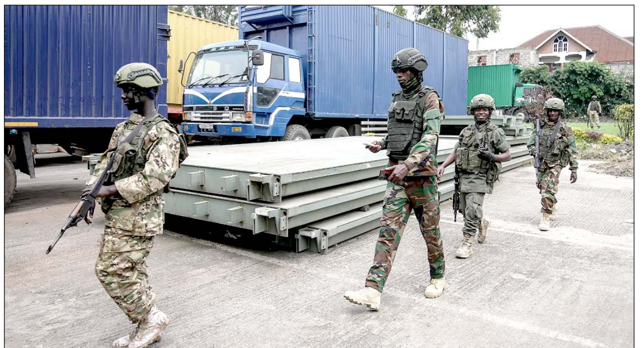
The M23 have been advancing to other areas after their offensive in Goma.

Mali and Burkina Faso criticised Ecowas' "inhuman" sanctions and vowed to defend Niger if the bloc intervened militarily.