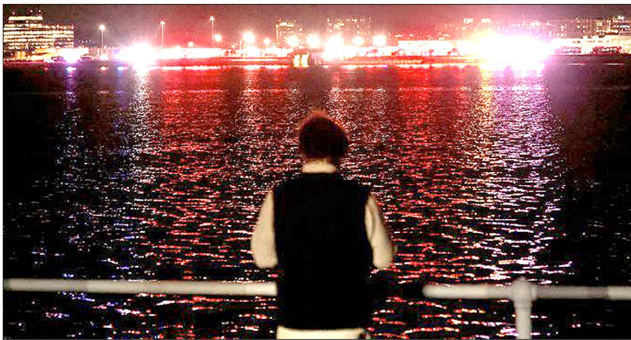
A person looks on as emergency service vehicles operate near the site of the crash on Wednesday, January 29.

He recalled seeing what looked like a "white flare" in the sky. He said planes flying into Ronald Reagan Airport appeared to have been flying in "irregular patterns".