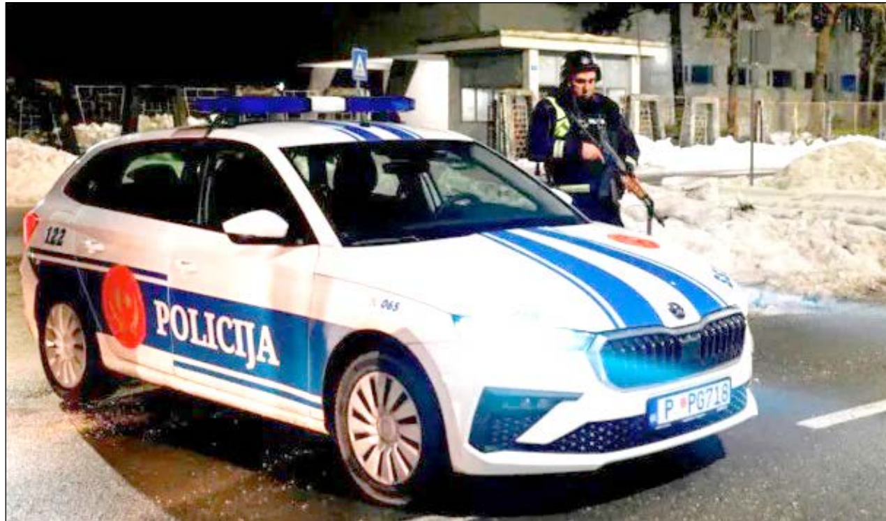
Police investigators surround a white truck that has been crashed into a work lift in the French Quarter of New Orleans, Louisiana, on January 1, 2025.

FBI has said the black flag of the Islamic State group was found inside the vehicle which ploughed into partygoers, along with two suspected improvised explosive devices discovered nearby.