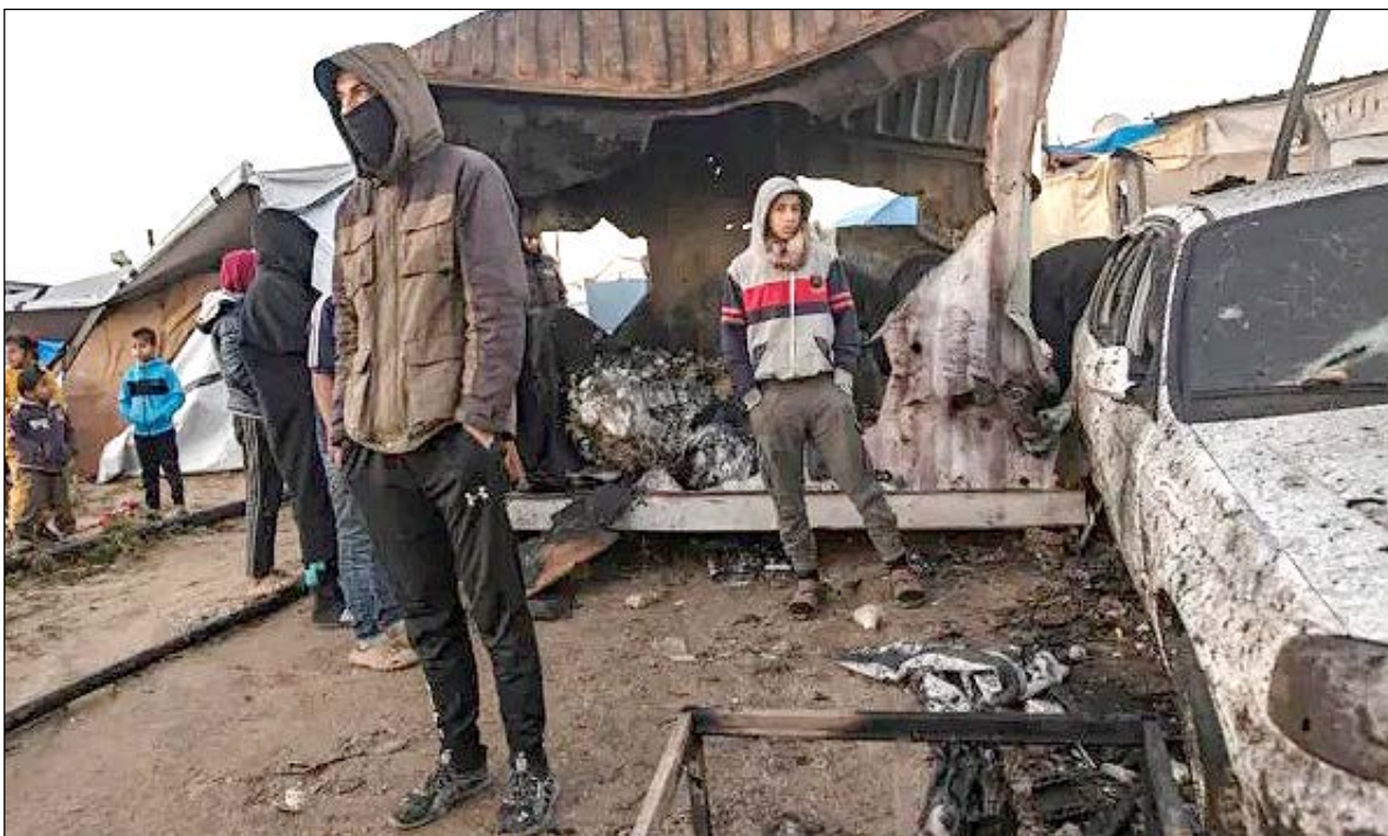
Toxic waste has been moved from the Union Carbide plant 40 years after the disaster

She told local media that the 19-year-old had snuck out with a cousin and friend, who both survived the attack.