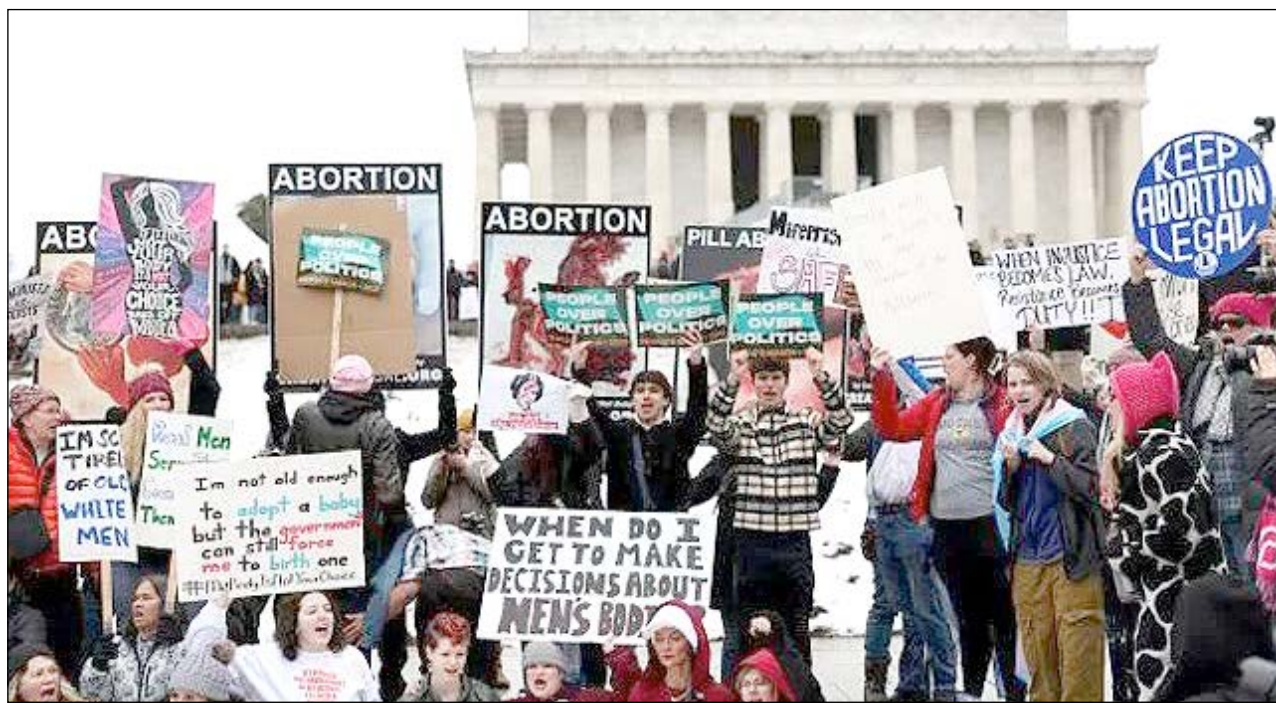
Protesters in Washington

Israel had reportedly prepared three potential locations near the Gaza border for the hostage exchange, but Hamas has cited "technical reasons" for the disruption.