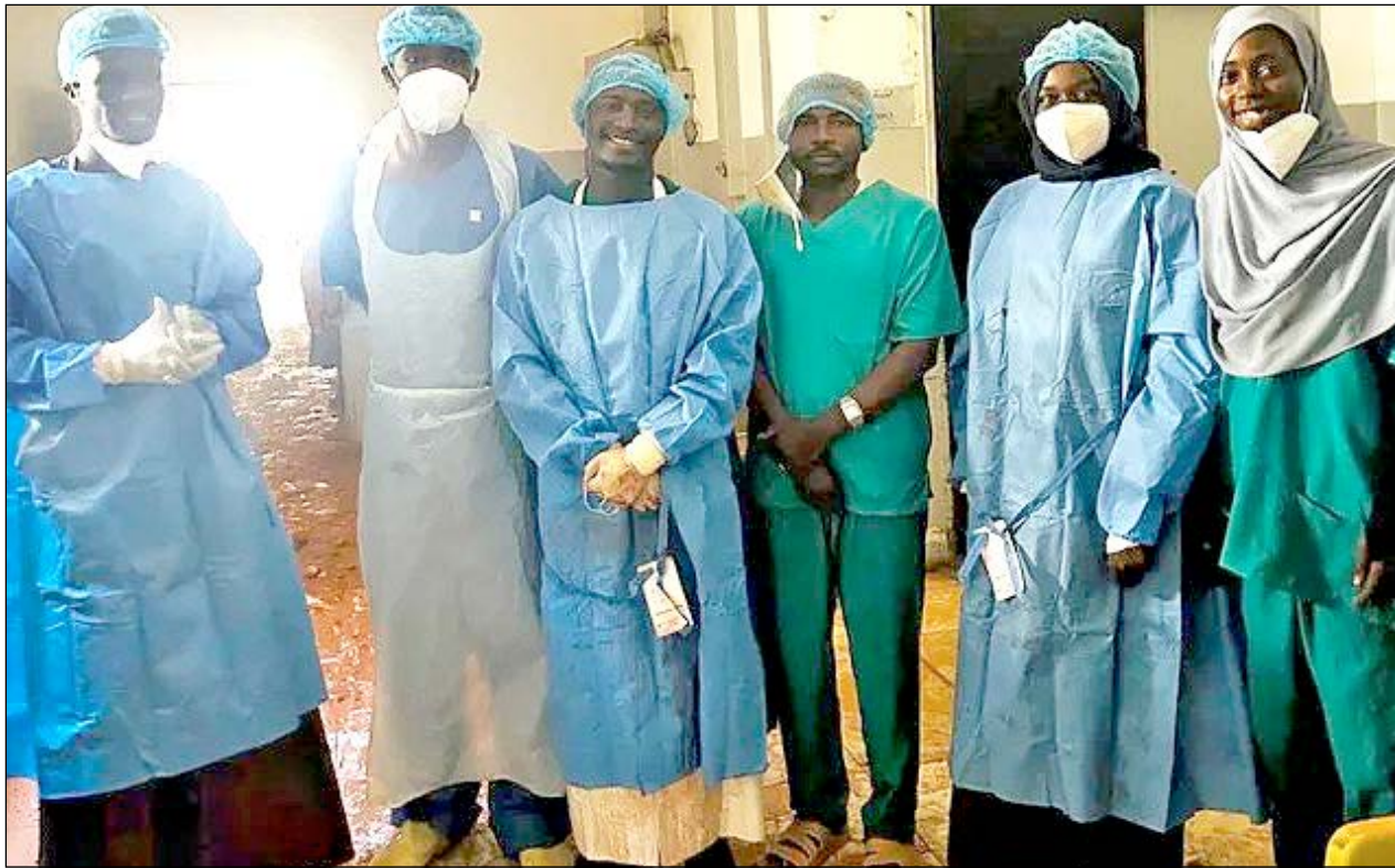
After successfully performing the two-hour emergency C-section under bombardment, the medics posed for a photo to mark the moment

The Astún resort, a popular skiing destination in the Aragon region of the Pyrenees near the French border, remains closed pending further investigations.