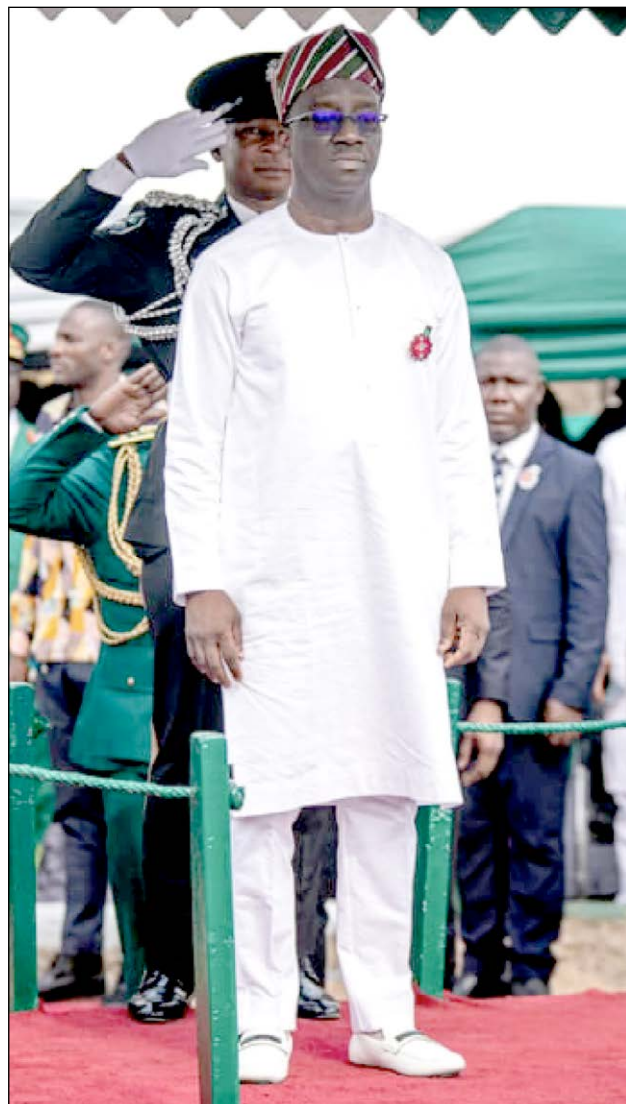
ARMED FORCES REMEMBRANCE DAY: Governor Monday Okpebholo of Edo State taking salute at the Armed Forces Remembrance Day celebration in Benin City.

ESOHE AIFUWA, ERHUVWU ETARHIENYO, AKINTIMOYE AJOKE