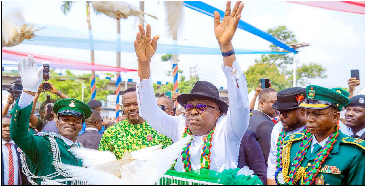
2025 ARMED FORCES REMEMBRANCE DAY:

The crash has reignited calls for stricter enforcement of traffic laws and increased public awareness on safe driving practices to prevent such avoidable tragedies.