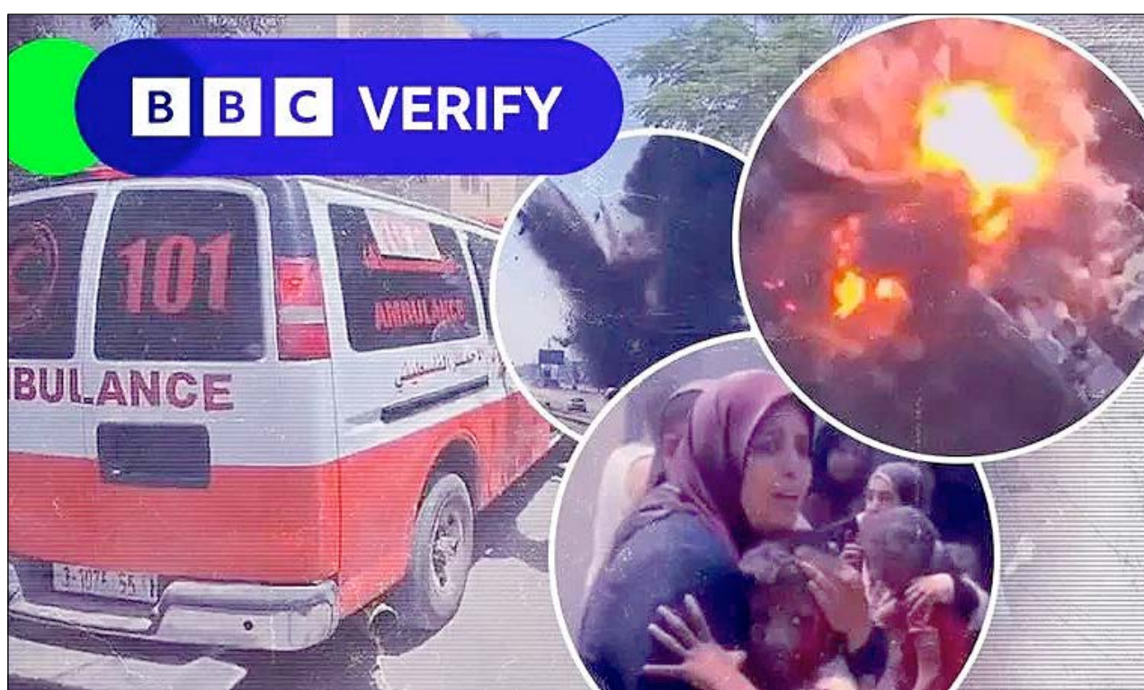
Palestinians inspect damaged tents following a strike in Deir el-Balah on 4 January which is within the "humanitarian zone" in Gaza.

The political saga has also pitted two branches of executive power against each other: law enforcement officers armed with a legal arrest warrant and presidential security staff, who say they are duty bound to protect the suspended president.