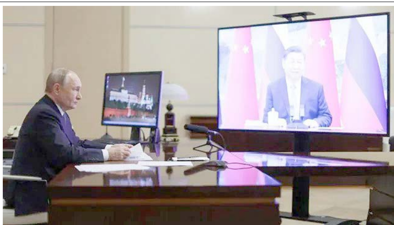
Putin addressed Xi as his "dear friend" during the call, which lasted about one-and-a-half hours

But many economists say such measures could lead to higher prices for Americans and harm companies hit by foreign retaliation.