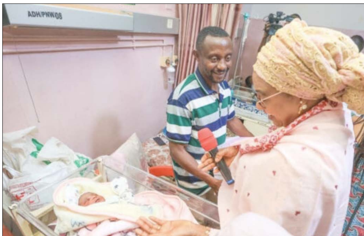
ABUJA'S FIRST BABY: