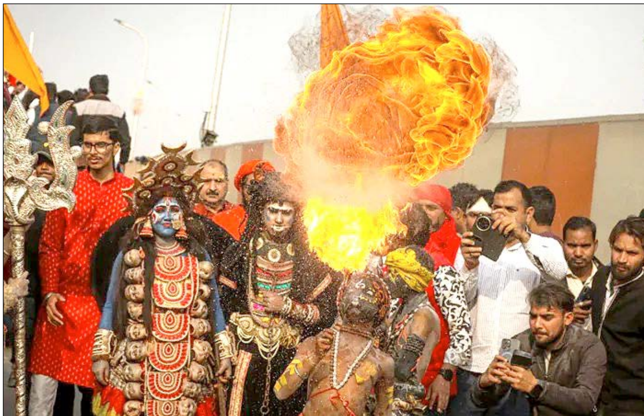
The Mahakumbh Mela is taking place in the northern city of Prayagraj

Petrol and diesel car sales are still permitted in Norway. But few are choosing to buy them.