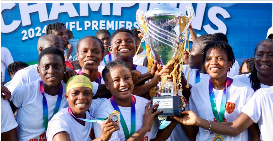
@EdoQueensFC crowned the Nigeria Women's Football League Premiership champions for the first time in their history!

Their campaign will kick off with a highly anticipated clash against the formidable Robo Queens in Lafia, Nasarawa State, on January 15, 2025, marking their debut in Nigeria's top-flight women's league.