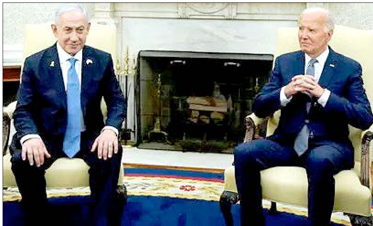
The White House is pushing for a deal as Biden ends his term in office this week

The buildings have been hollowed out to make way for sewing machines, rolls of fabric and bags brimming with cloth scraps. The doors to their basements are always open for the seemingly endless cycle of deliveries and collections.