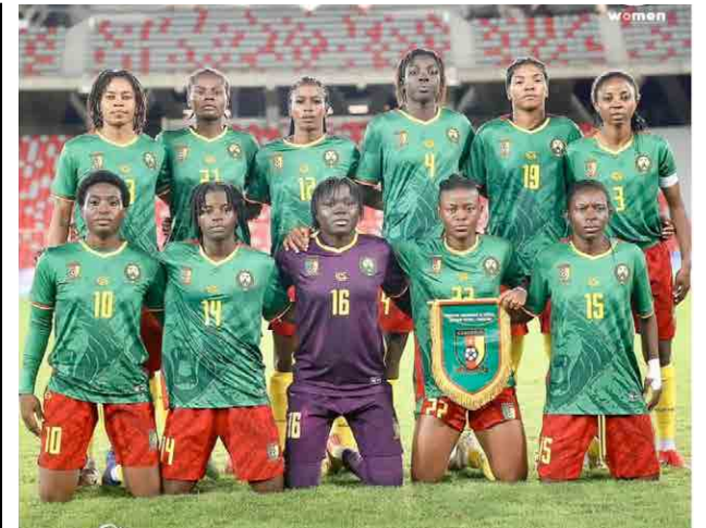
THE INDOMITABLE LIONESSES OF CAMEROON

"As you prepare ahead of the games, remember that discipline is our watchword. So, we admonish you to be disciplined throughout. When you work hard, aim higher, discipline should be added as that is the sure way to victory and success. Being Ambassadors of the host state, you must conduct yourselves in an orderly manner throughout.