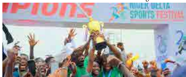
NIGER DELTA GAMES ATHLETES