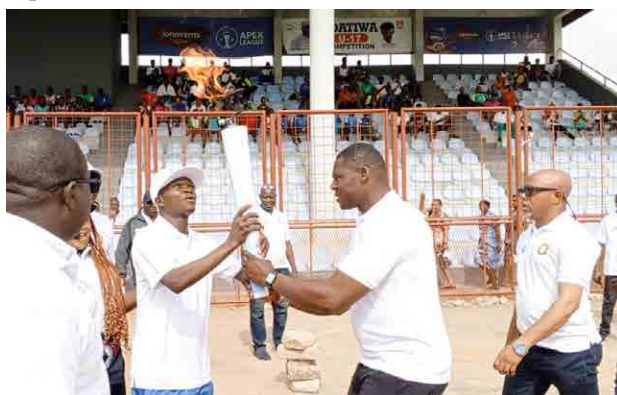
NDGS UNITY TORCH MOVES