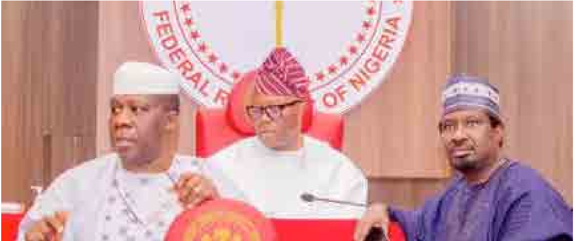
THE NIGERIAN SENATE COMMITTEE