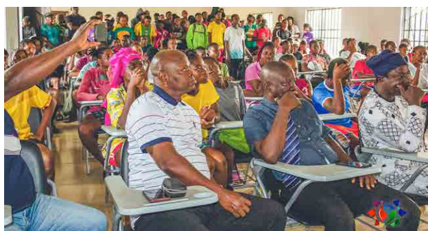
COMMONWEALTH BOUND ATHLETES