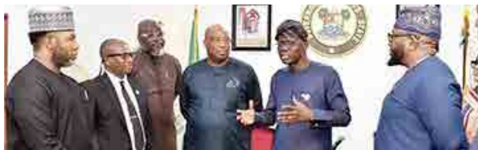
GOV SANWO-OLU OF LAGOS STATE SUPPORTS GRASSROOTS SPORTS

"The mandate is straightforward — to support funding in sports and establish strong institutions for today and future generations," the governor said. "I implore you to deploy resources into grassroots and school sports, and to enhance facilities across our divisions.