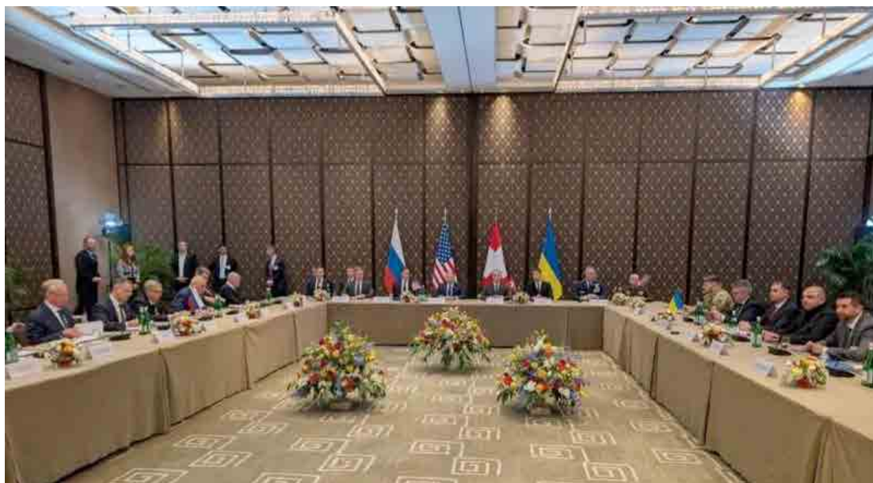
RUSSIA-UKRAINE PEACE TALKS:

Khamenei last month acknowledged that thousands had been killed during the protests and blamed the US for the deaths.