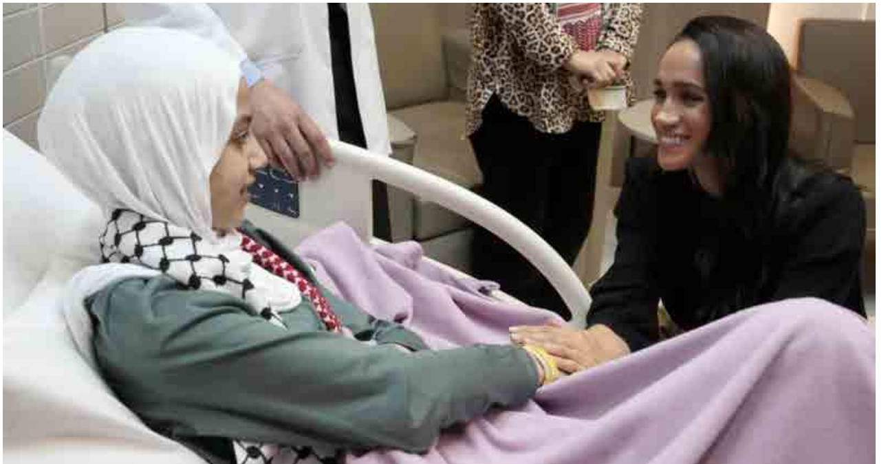
VISIT SPECIALITY HOSPITAL: