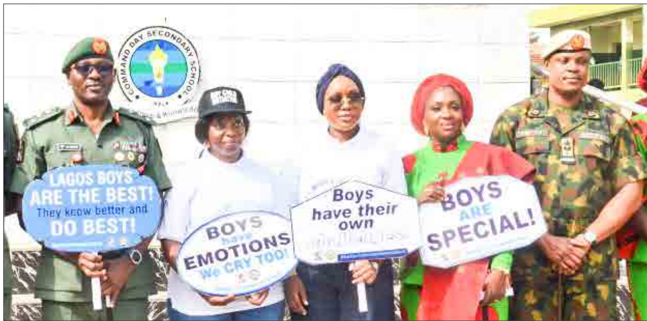
2026 WORKSHOP OF LAGOS BOY CHILD:

Bako assured that only duly verified victims would benefit from the intervention, noting that the exact number of affected traders and the total value of losses were still being determined.