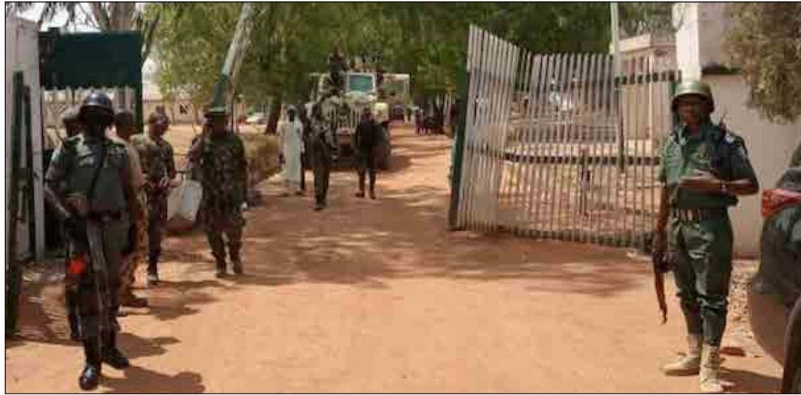
ARMY AT THE ENTERANCE OF THE BARACK

The main drivers of insecurity in Nigeria are multifaceted and intercon-