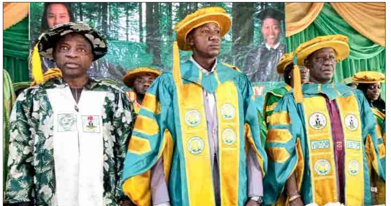
2026 MATRICULATION CEREMONY: