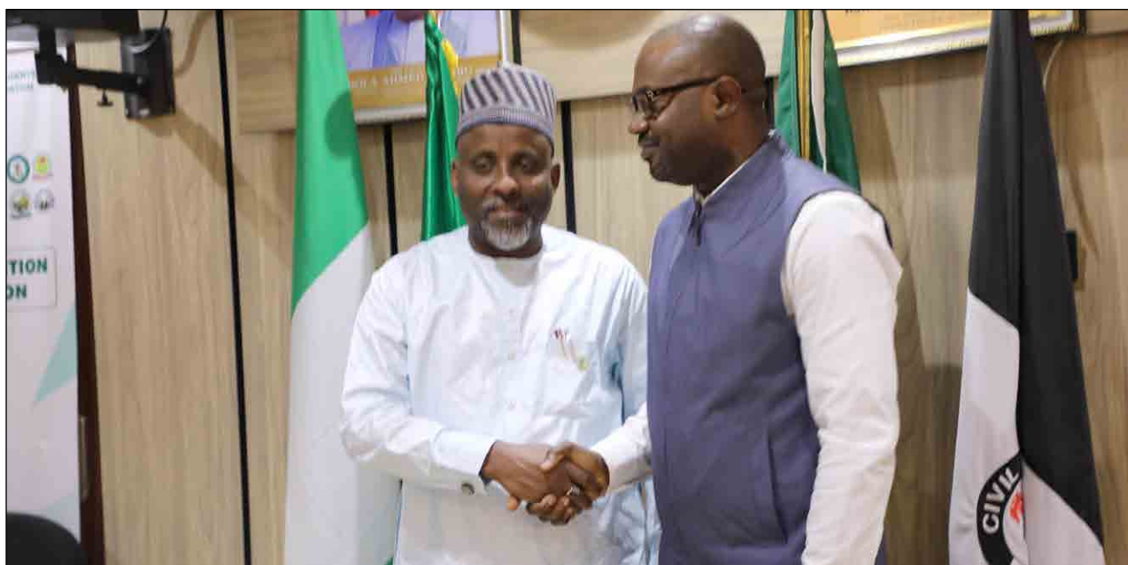
NUJ LEADERSHIP VISITS TUNJI-OJO:

With Edo's reputation as one of Nigeria's most peaceful states at stake, Okpebholo stressed that the government's focus remains on governance, public safety, and development, while welcoming healthy opposition that respects the law and democratic norms.