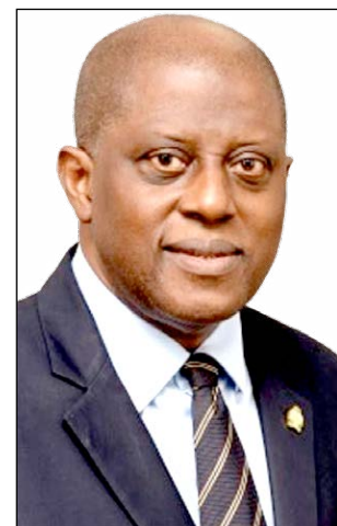
CBN GOV. YEMI CARDOSO

This intervention has helped ease pressure in the parallel market, with exchange rates moving closer to the official rate. The naira, which traded at N1,535/$1 at the end of December 2024, strengthened to N1,473/$1 by January 31, gaining N60 or 3.91% within the month.