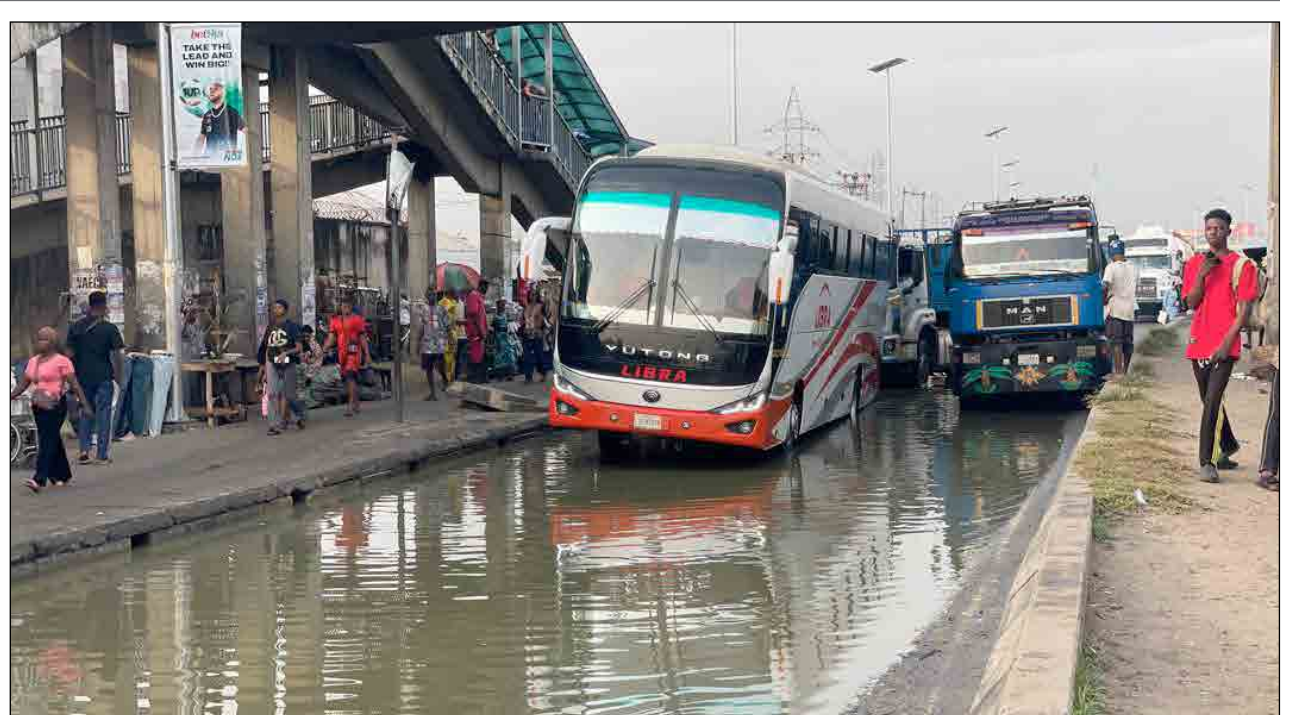
LAGOS' FLOODED ROAD:

Flooded road at Suru Bus Stop on Lagos-Badagry Express in Lagos on Tuesday.