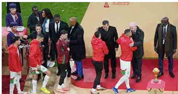
MOROCCO TEAM AT THE AFCON 2025

Morocco's football federation (FRMF) announced on Tuesday it would appeal the Confederation of African Football's (CAF) disciplinary rulings over last month's chaotic Africa Cup of Nations final against Senegal, which the hosts lost 1-0 after extra time.