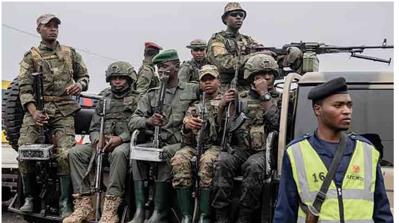
DR CONGO SOLDIERS:

In 2020, teacher Samuel Paty was murdered by a Chechen refugee outside the school where he taught in a suburb of Paris, an attack which was motivated by religious extremism.