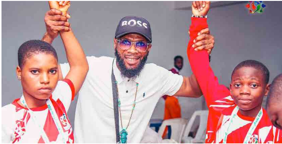
TEAM EDO ATHLETES READY FOR NDGS

The trials exercise which is expected to end on Friday, February 6, 2026 will have athletics association who already started about two weeks ago, returned to the field and track of the Samuel Ogbemudia stadium to complete their assignment. Other sports featuring include Tennis, Basketball, Volleyball, wrestling, boxing, weightlifting, gymnastics and more.