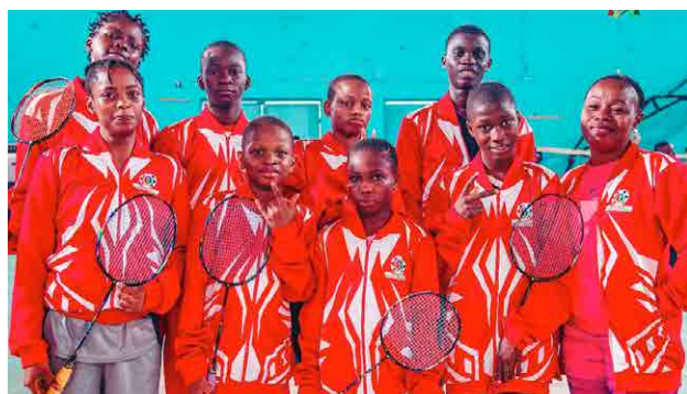
RIVERS STATE ATHLETES DURING TRIALS FOR NDGS

Trials for wrestling, volleyball, and taekwondo are scheduled to continue on Wednesday as the state's selection process gradually winds down.