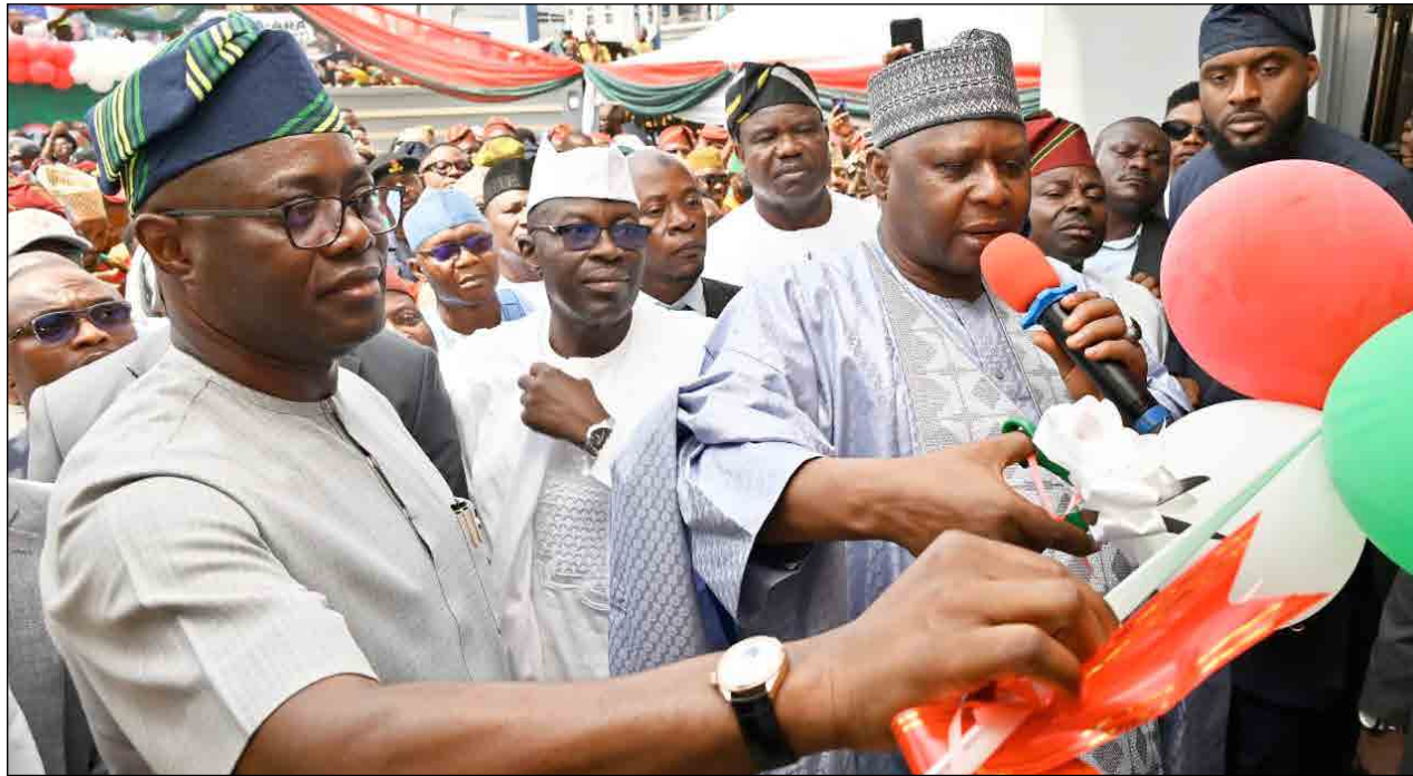
OYO STATE PDP SECRETARIAT INAUGURATION:

"He is busy with activities marking Oyo State at 50. I am not aware of the incident and cannot comment on behalf of the chairman," she said.