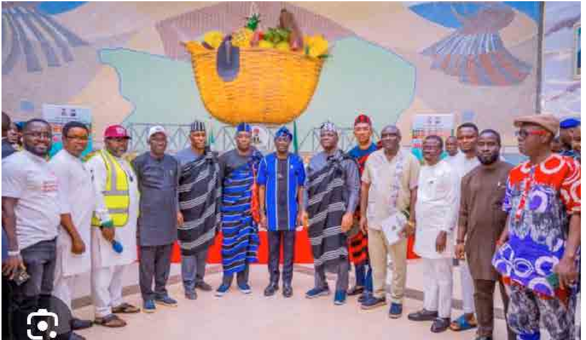
ACROSS SECTION AT THE BANQUET HALL OF THE BENUE GOVERNMENT HOUSE IN MAKURDI.