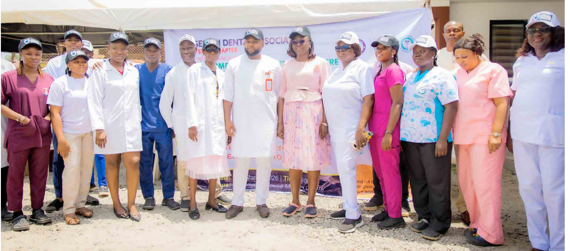
The 2026 World Oral Health Day through the Government House Medical Center collaborated with the Nigerian Dental Association, Edo State Chapter.