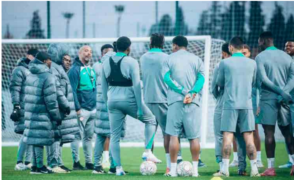
SUPER EAGLES COACH AND THE PLAYERS