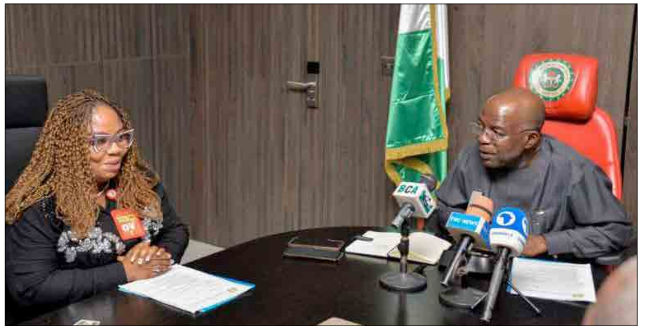
A COURTESY VISIT: