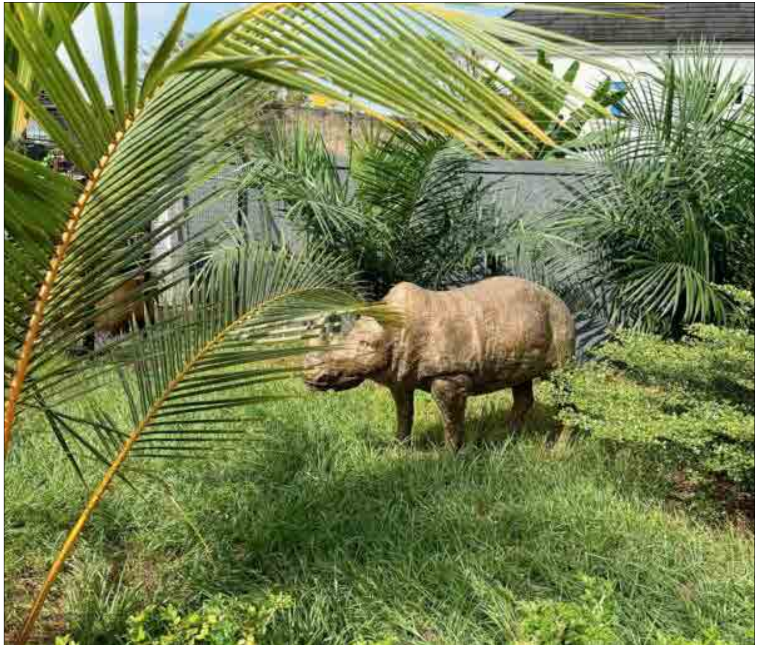
BLACK MUSE SCULPTURE GARDEN

A lyrical dialogue between sound and space, created by Grammy-nominated singer and songwriter Somi