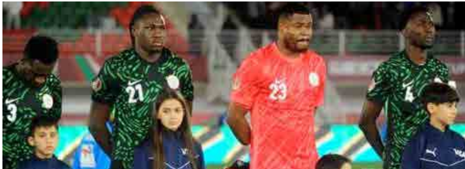
SUPER EAGLES OF NIGERIA

The Algerian body is specifically demanding the annulment of the sanctions, arguing that its right to a fair hearing has been violated in the handling of the case