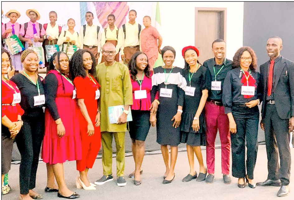
Ushers at the event