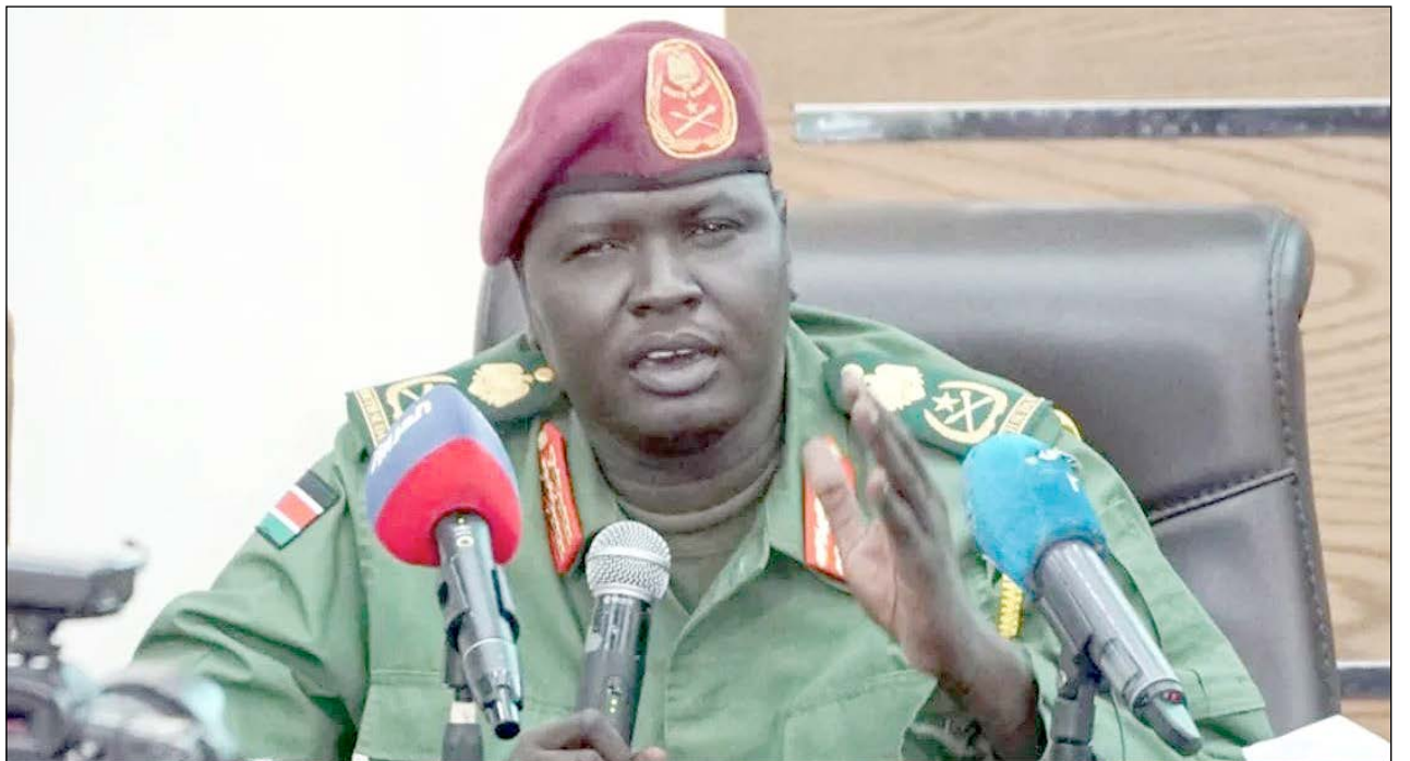
THE MILITARY WING:

Mozambique's former colonial power, Portugal, has condemned "the unacceptable attack on Venâncio Mondlane's convoy" while calling for "restraint from violence and respect for fundamental rights".