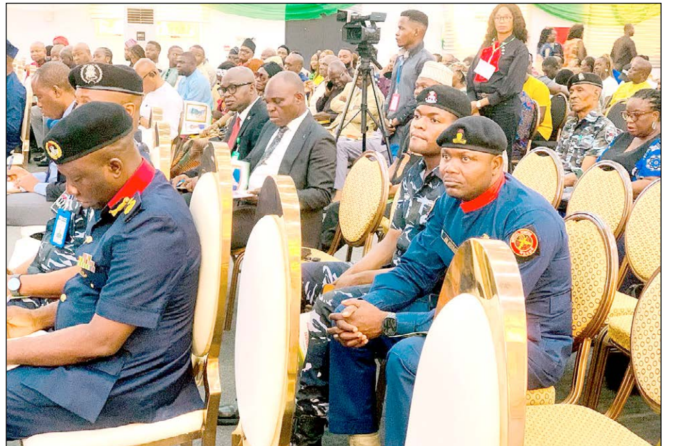
A cross section of participants