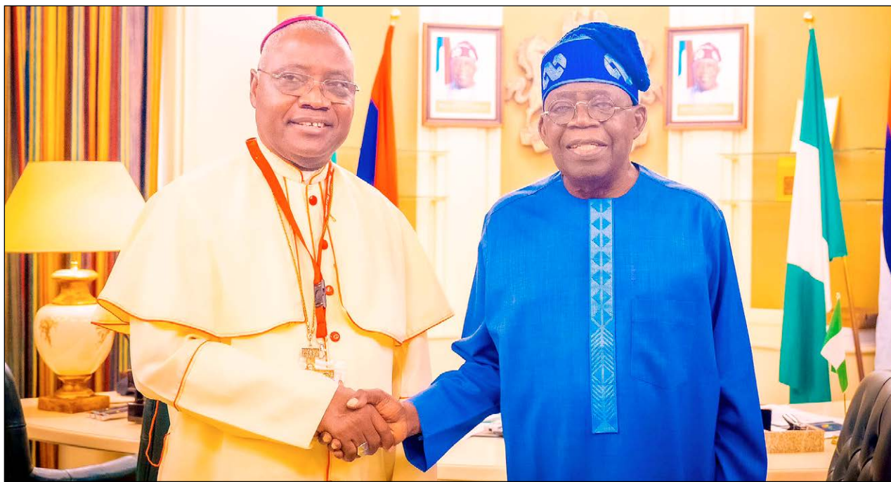
ARCHBISHOP OF ABUJA:

This is the second time Senator Akpoti-Uduaghan has raised similar allegations against the Senate President. A previous petition was dismissed on procedural grounds on Wednesday.