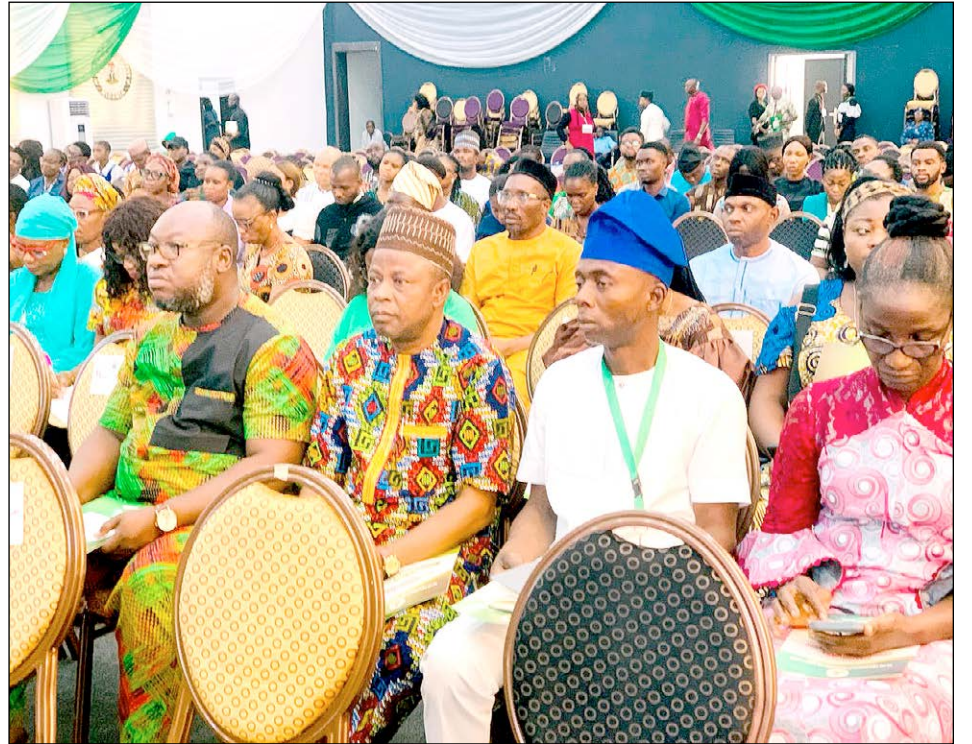
A cross section of participants