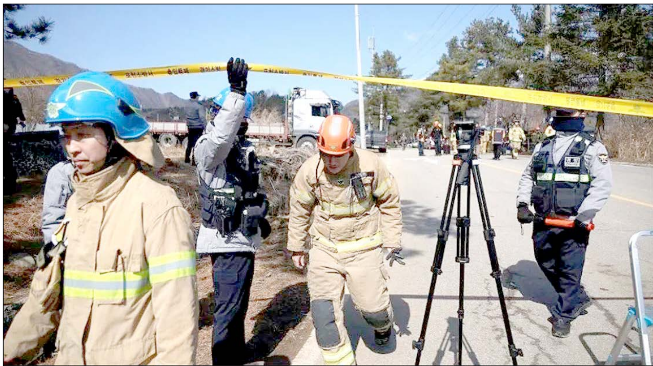
KF-16 FIGHTER JET:

According to von der Leyen, the plan could free up a total of €800bn ($860bn; £670bn) in defence expenditure.