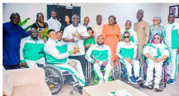
NIGERIA'S PARA ATHLETICS

The Games continue to serve as a platform for discovering new talents and strengthening Nigeria's position in global para-sports.