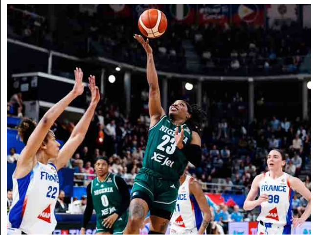
D'TIGRESS AND FRANCE