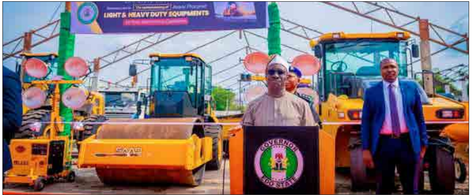
GOVERNOR MONDAY OKPEBHOLO LAUNCHES NEW TRACTOR FOR ROAD CONSTRUCTION

Many rural and community roads fall within the jurisdiction of local authorities. Historically, however, local