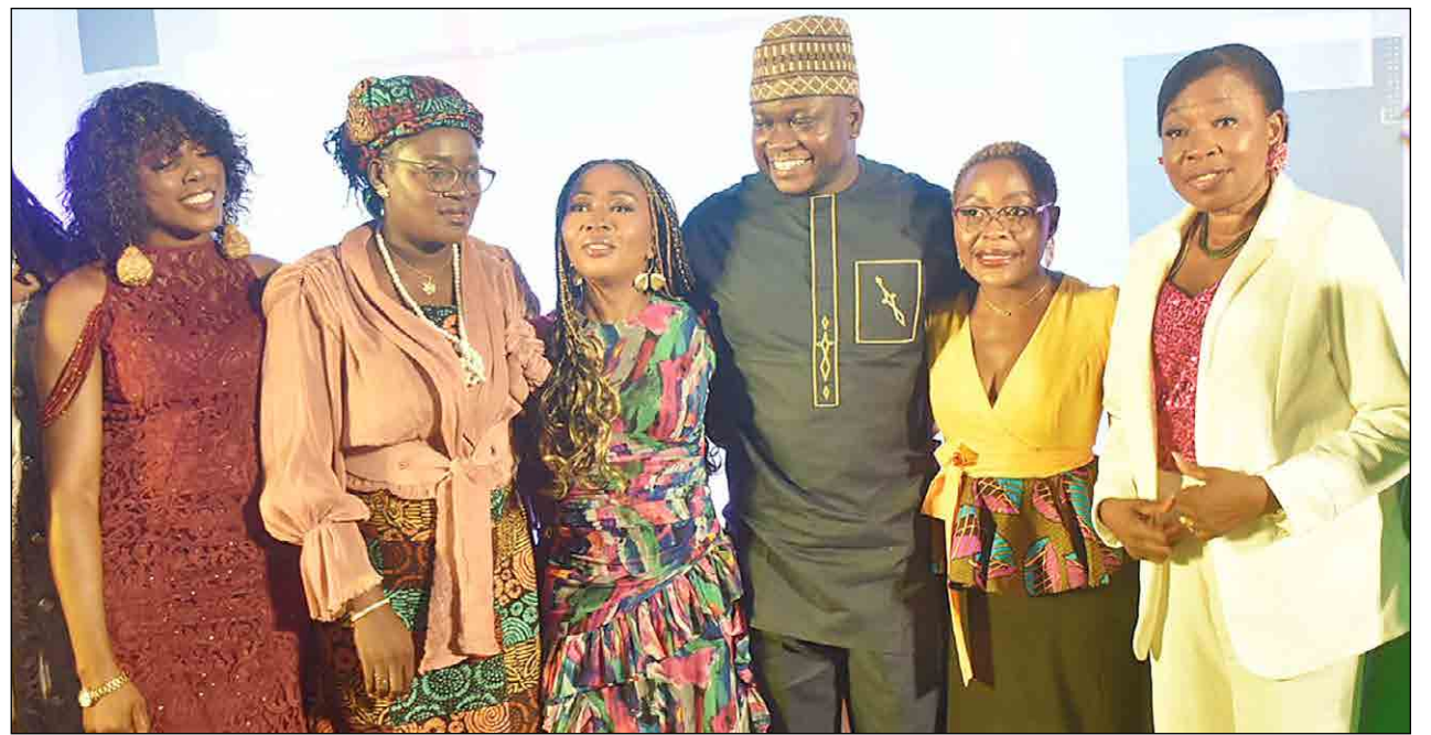
2026, CONFIDENCE SELF-AWARENESS:

Both parties agreed to continue engagements to develop workable frameworks for increased electricity exports, aligning with broader Economic Community of West African States (ECOWAS) efforts to strengthen regional electricity trade.