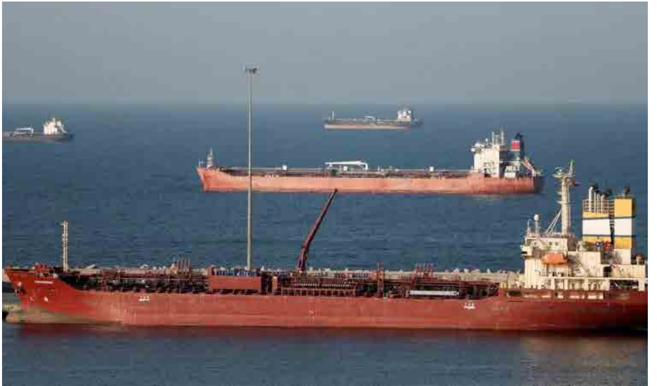
OIL VESSEL SHIP:

Most people with gas and electric powered heating will still see their energy prices fall for the next three months, following a shake-up of government charges, so any impact of the war will be delayed until the autumn - but bills could rise at that point.