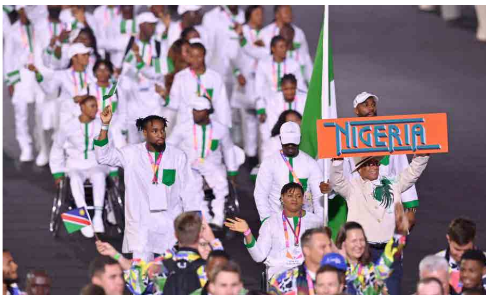
NIGERIA COMMONWEALTH ATHLETICS