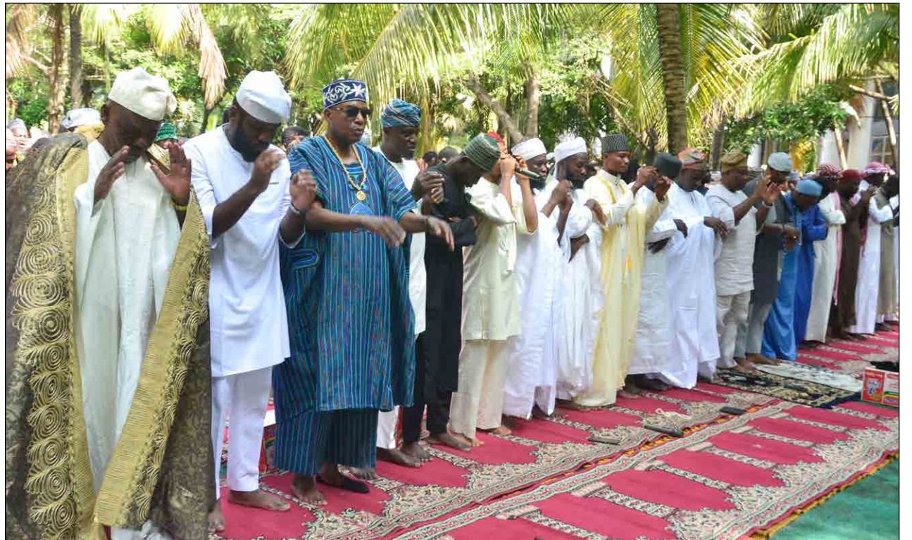
2026 ELD-EL-FITR PRAYER:

The NMGS president further stressed the need for resilient infrastructure capable of withstanding environmental pressures such as flooding, erosion and land degradation, adding that sound geoscientific knowledge must underpin national planning.