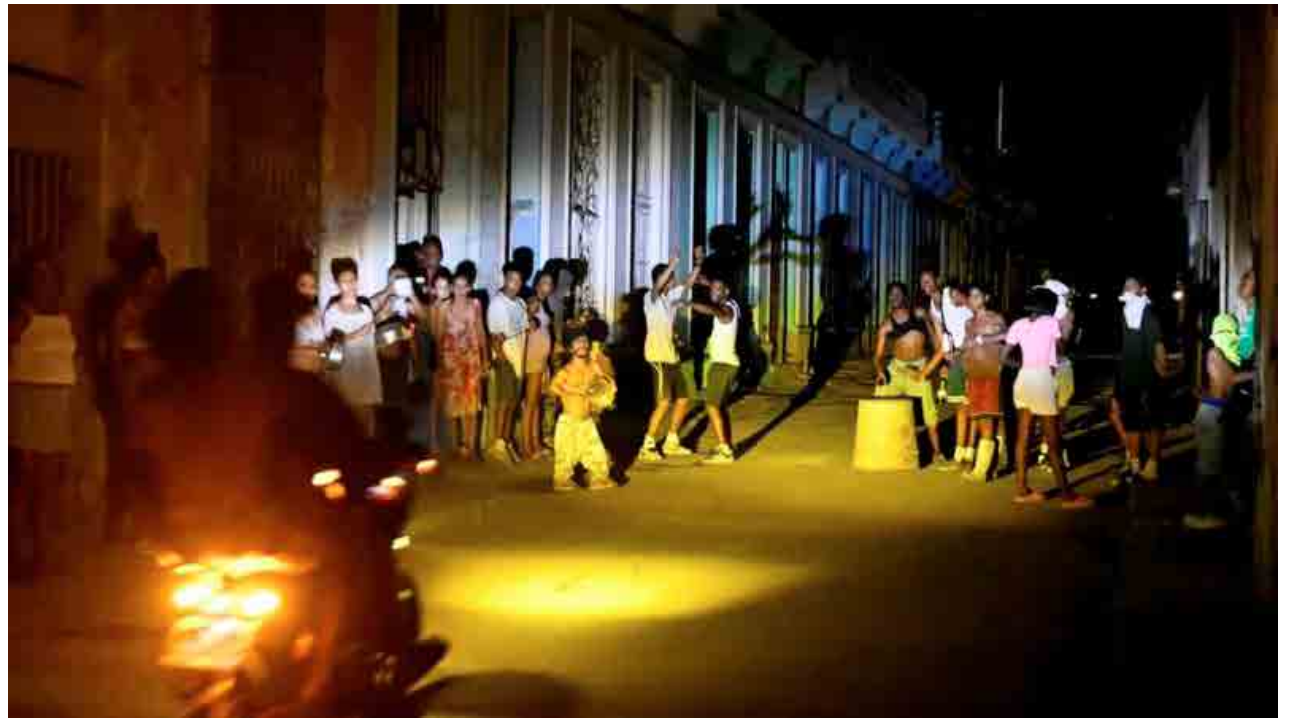
CUBA NATIONAL BLACKOUT: Power cuts leave millions of homes and businesses without power across Cuba.

The Chinese-funded extension is due to reach the border