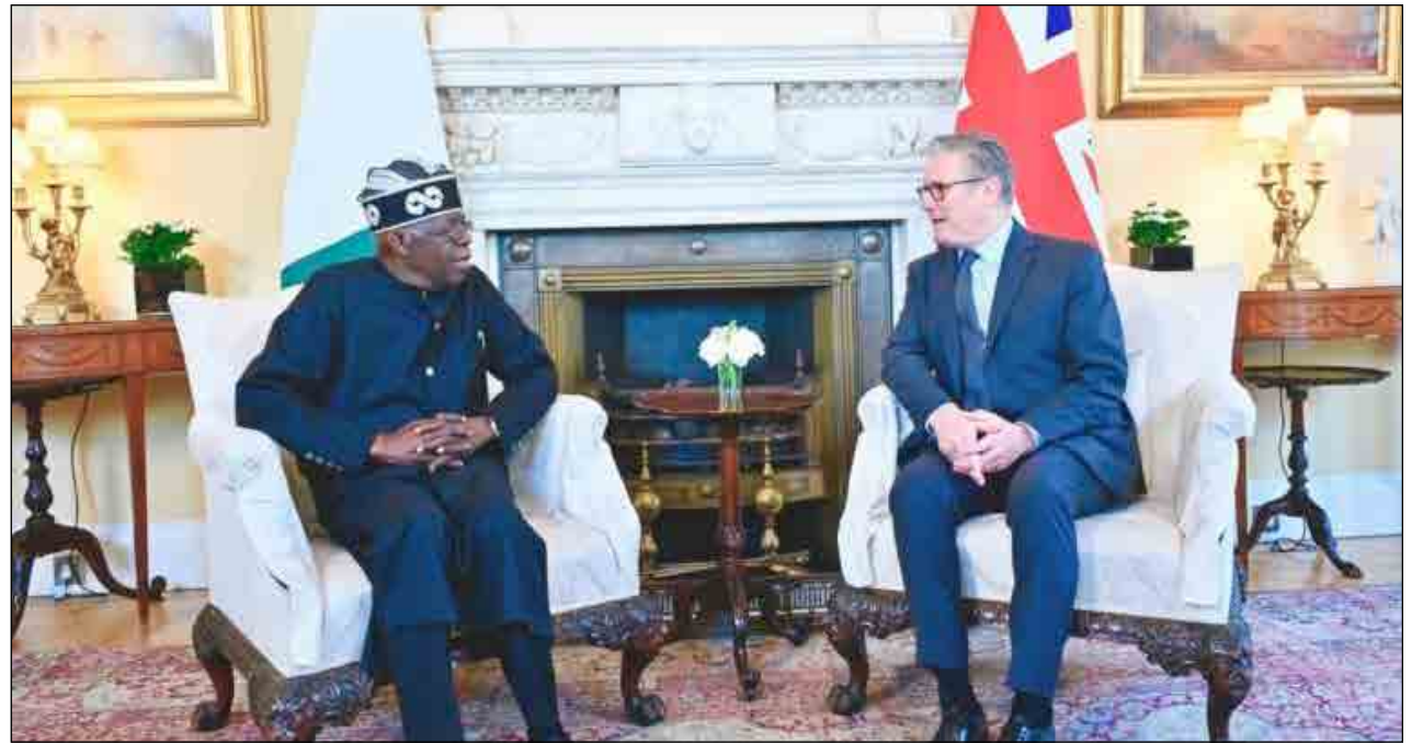
£746M PORTS REFURBISHMENT DEAL:

He added that AI continues to shape modern journalism practice and urged journalists to acquire the necessary knowledge and tools to remain competitive, relevant and capable of meeting the demands of a digital-first media environment.