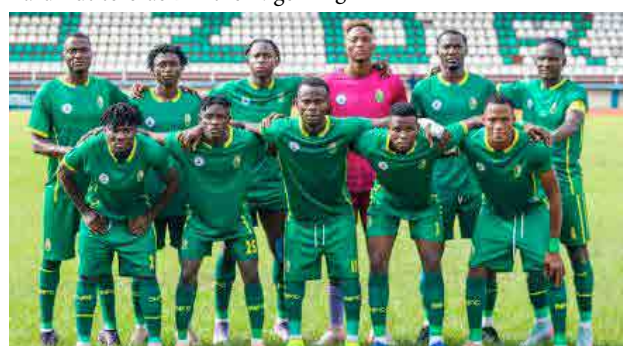
BENDEL INSURANCE FC

ria Premier Football League as they shared the spoils with their stubborn neighbours Warri Wolves in the Niger Delta derby which ended in a goalless draw.