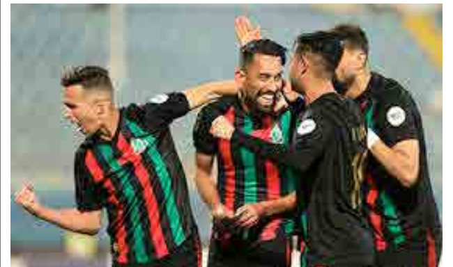
AL AHLY CELEBRATING