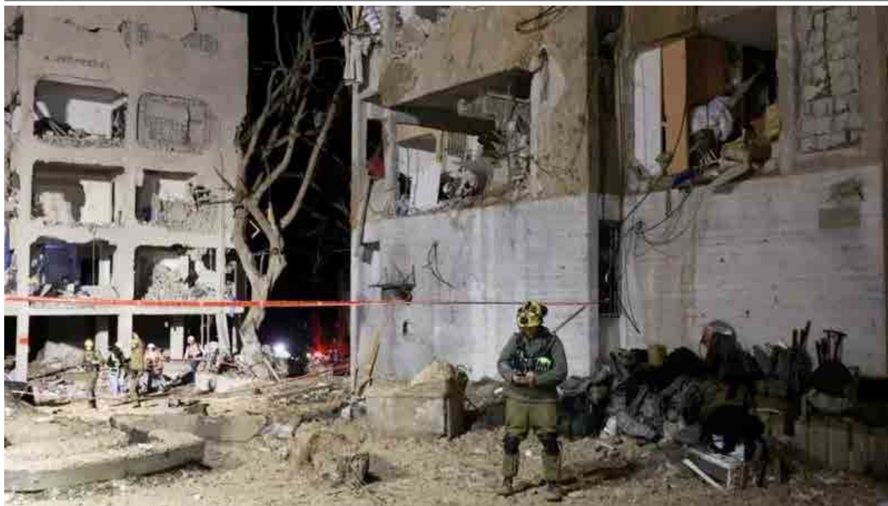
ISRAELI NUCLEAR SITE:

The crash comes as the US and Israel continue their wide-ranging strikes against Iran, while Tehran retaliates with its own attacks against Israel and US-allied states in the Gulf.