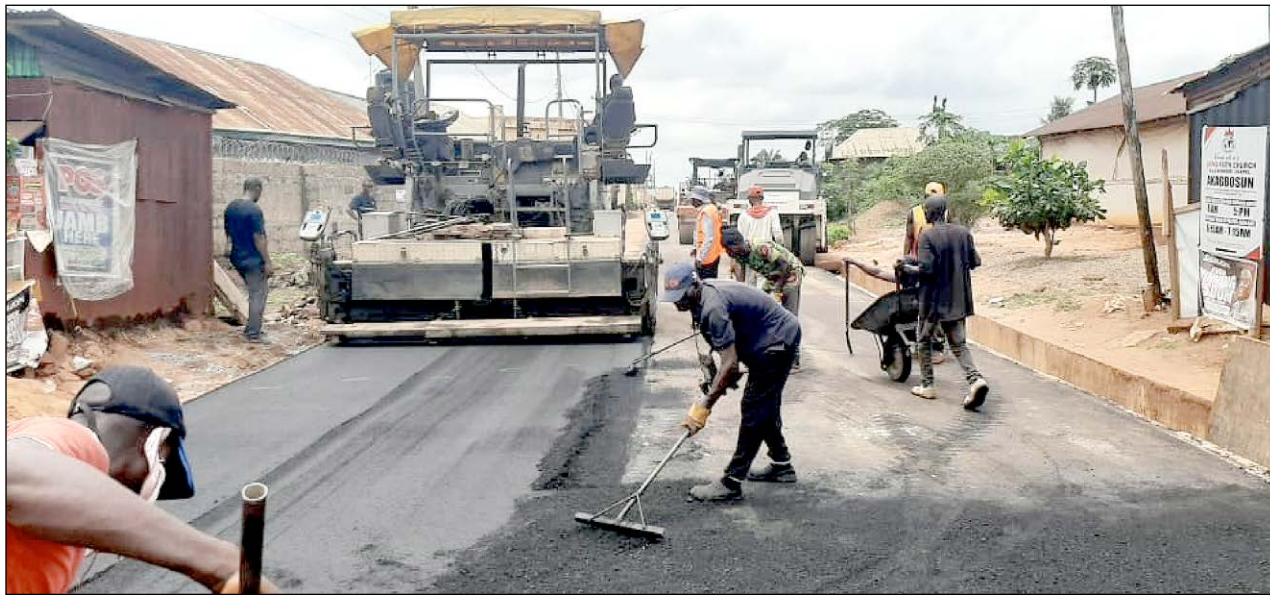
EKEHUAN ROAD: Asphalt Laying on Ekehuan Road, Benin City

It highlighted that such occurrences often stem from misinformation and a lack of awareness about the fundamental right to a fair hearing.