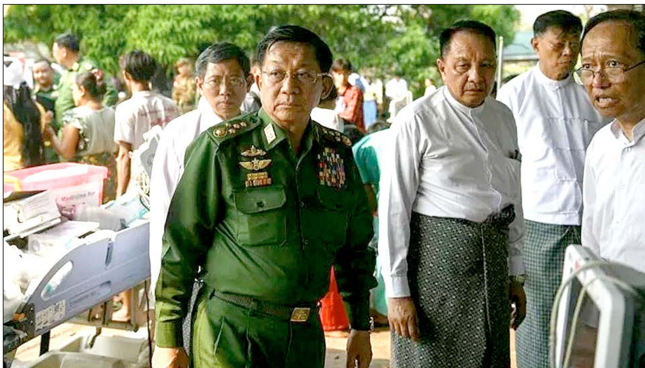
VISITED A HOSPITAL:

The military's aerial warfare is being sustained by continued support from Russia and China. Despite UN calls for an arms embargo in response to the coup, both China and Russia have sold the junta sophisticated attack jets and provided training on how to use it.