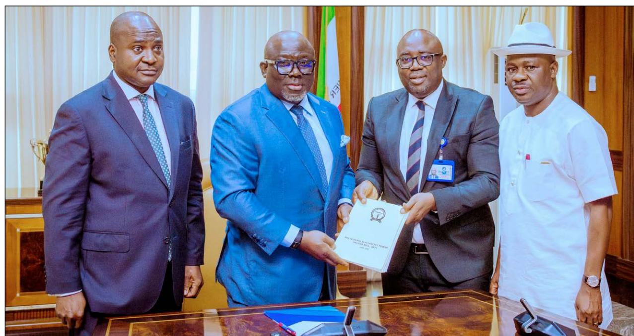
ASSENT TO SEVEN BILLS:

To this end, the SSANU called on the Nigeria Labour Congress and other stakeholders in the protection of the rights of Nigerians to wade into the matter, which, according to it, "has the potential of becoming a cause of national industrial unrest in our university system."