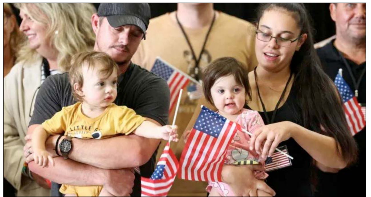
ABOUT 59 WHITE SOUTH AFRICANS ARRIVED IN THE US ON MONDAY

Some held young children and waved small American flags in the arrival area adorned with red, white and blue balloons on the walls.