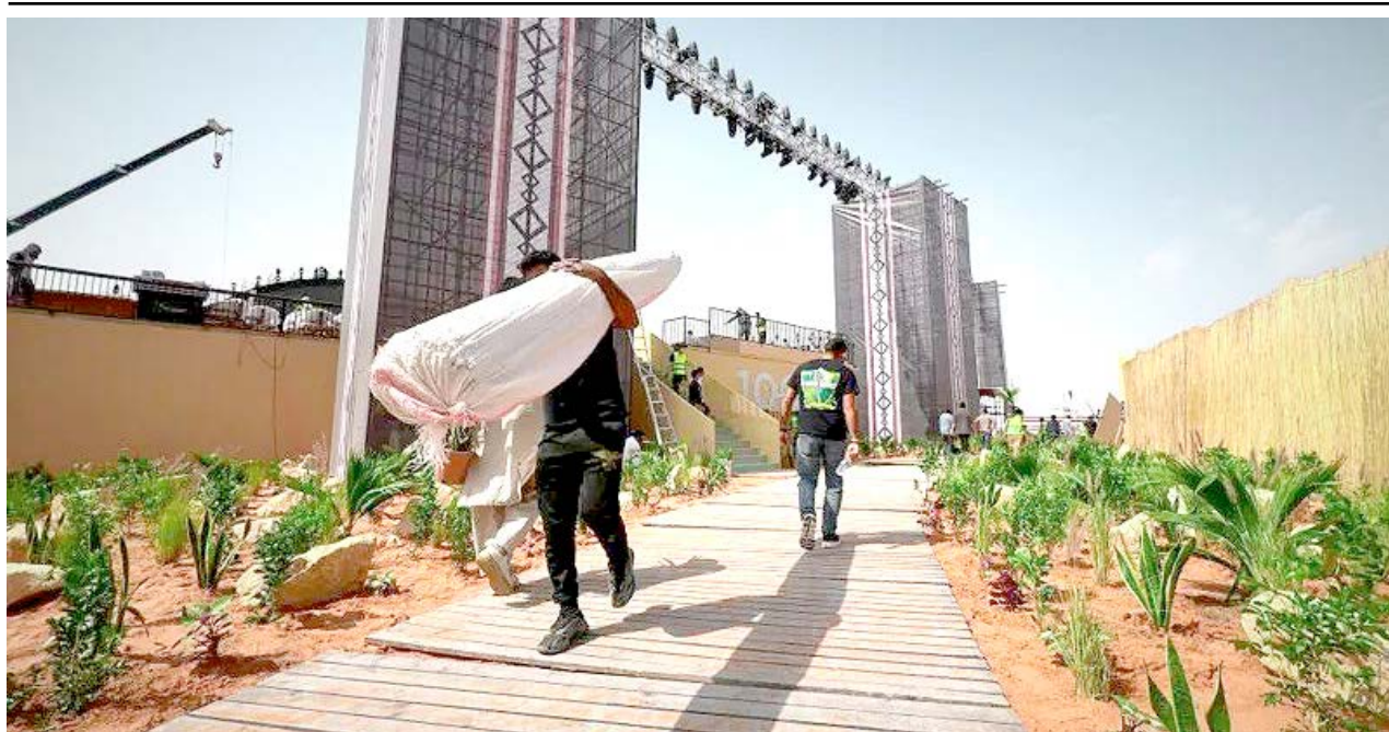
The Saudi government says there have been improvements to its occupational health and safety, but rights groups are sceptical of the changes.