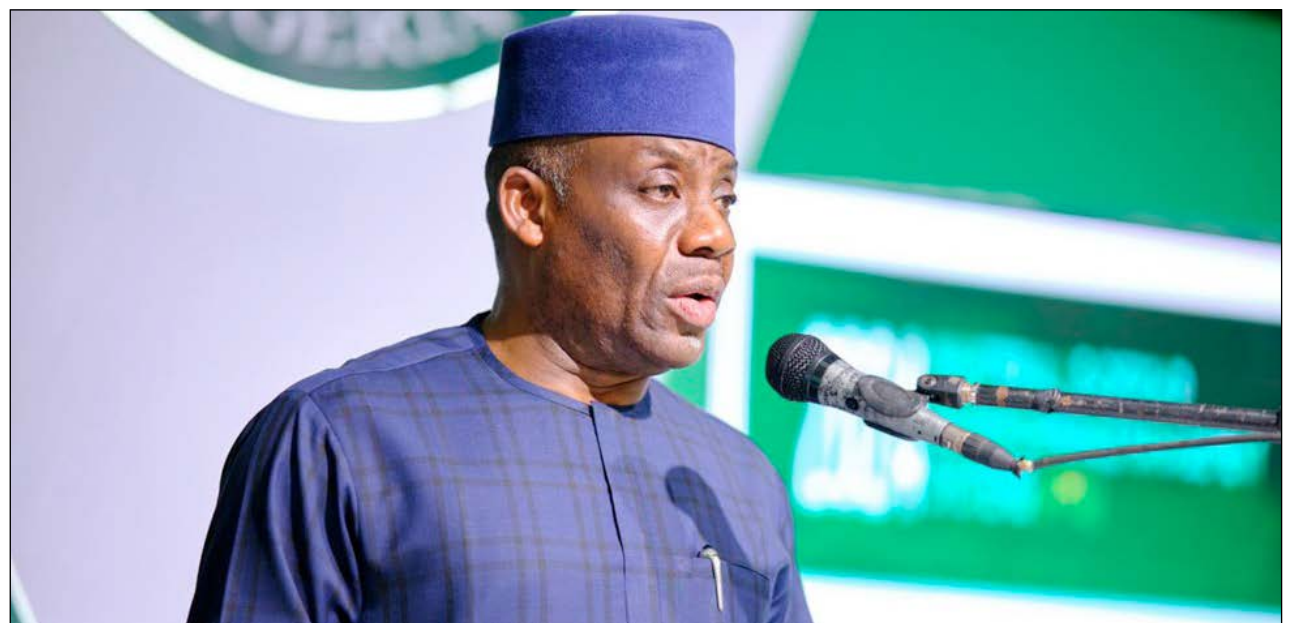
Minister of Education, Tunji Alausa

He assured that steps were being taken to address the matter and ensure transparency and efficiency in the operation of the loan scheme.