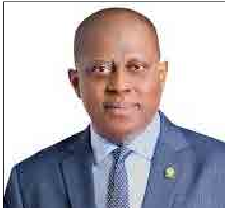
CBN GOVERNOR OLUYEMI CARDOSO

Nonetheless, financial reform cannot succeed in isolation. Sustainable progress requires close coordination with