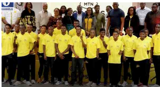
CHAMP PROJECT TEAM

Some beneficiaries of MTN Champs project, during the press conference in Calabar