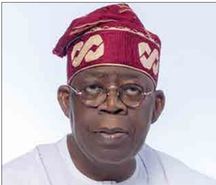
PRESIDENT BOLA TINUBU

No prophetic blabbing, scientific approach, or signal flare in the fog of counter-political strategy, nor any campaign brinkmanship, will truncate President Tinubu's path to winning the 2027 election. National Detective Magazine's investigations across the six geopolitical zones reveal a paucity of opposition strength and a lack of confidence to challenge Tinubu's maximum deployment of incumbency power. His financial muscle and nervous political system are no doubt central to his strategy and strength. His mapped-out targets, particularly the