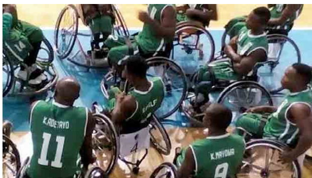
THE NIGERIA WHEELCHAIR BASKETBALL FEDERATION

The Commonwealth Games qualifiers will take place in Luanda, Angola, from March 22 to March 27.