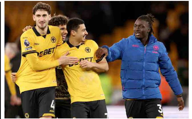
WOLVERHAMPTON TEAM CELEBRATE AFTER WINNING LIVERPOOL

At the second Niger Delta Games, Edo topped the medal table with an impressive haul of 52 gold, 34 silver and 25 bronze medals, amassing a total of 111 medals to surge past traditional powerhouses, Delta and defending champions Bayelsa in the keenly contested week-long regional sports fiesta which ended on Thursday, February 26, 2026 at the Samuel Ogbemudia stadium in Benin.