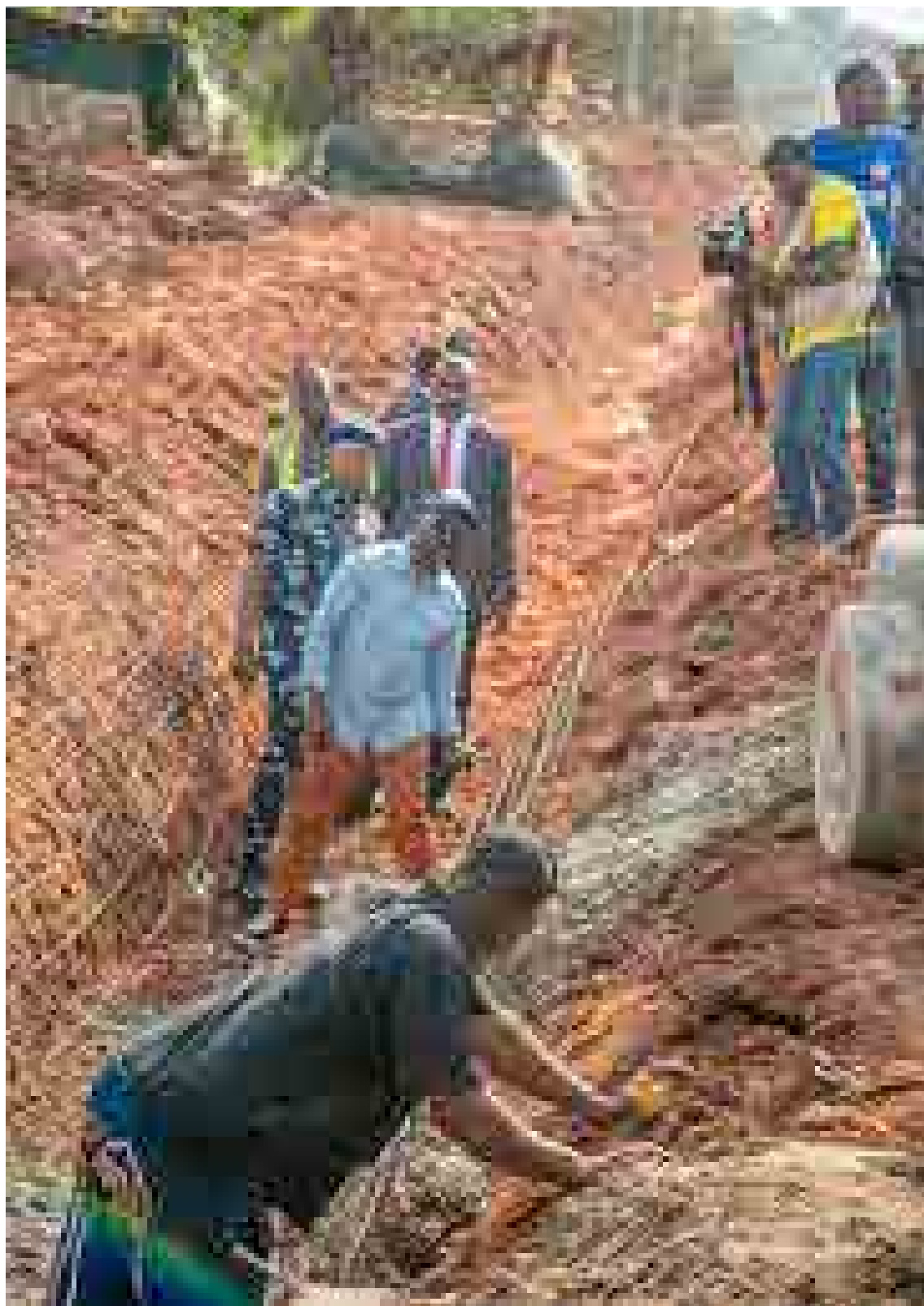
GOVERNOR SENATOR MONDAY OKPEBHOLO INSPECTING ONE OF THE CONSTRUCTED ROAD

As climate pressures intensify, the imperative to build flood-resilient cities will only grow stronger. In Edo State, the synergy between informed policy, active institutions, and engaged communities offers a promising path forward. The journey towards full resilience continues, but the trajectory is clear: a safer, cleaner, and more sustainable Edo driven by purposeful governance and practical action.