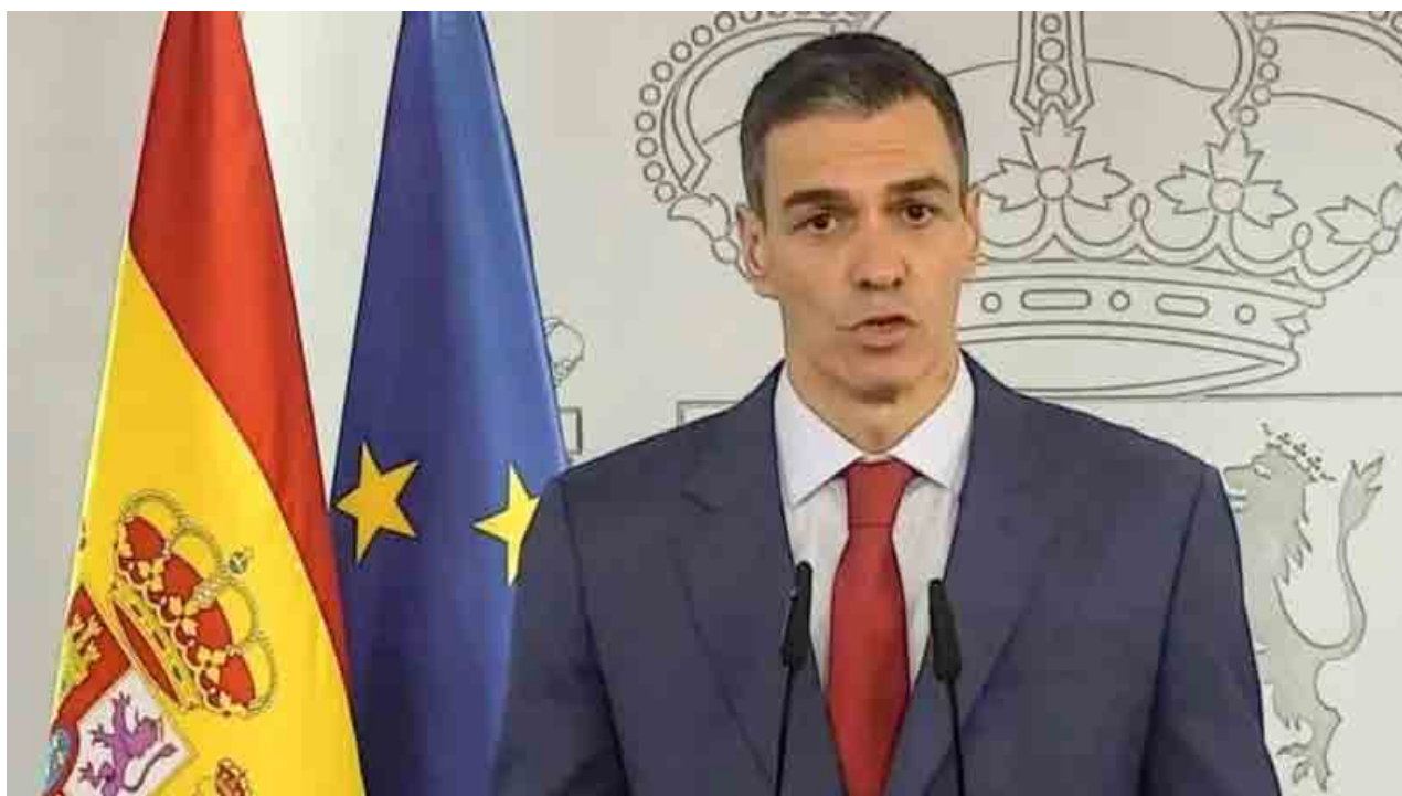
SPANISH PRIME MINISTER:

Trump has repeatedly accused Petro and his administration of failing to stem the flow of drugs to the US, suggesting that expanded strikes could also target Colombia.