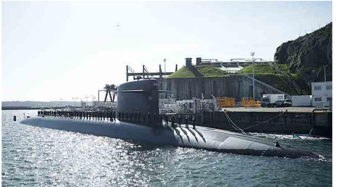
NUCLEAR NAVAL BASE:

The three countries have formed their own alliance, but a West African chief of staff says they will be encouraged to cooperate with the new force.