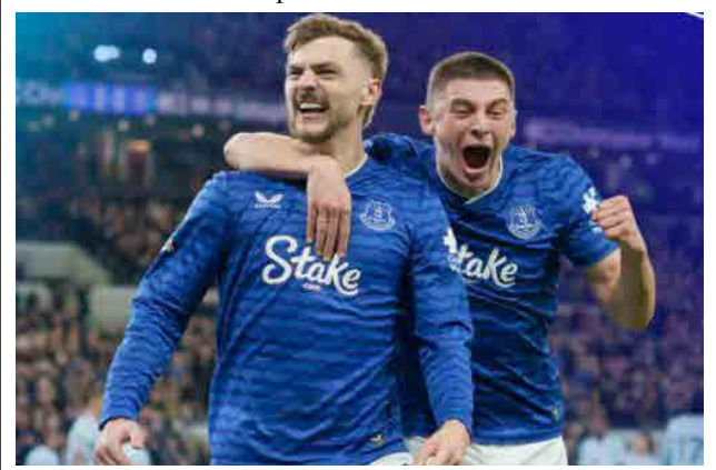
EVERTON PLAYERS CELEBRATE

Bournemouth and Brentford drew 0-0 — a result that moved Bournemouth into the top half and left Brentford seventh.