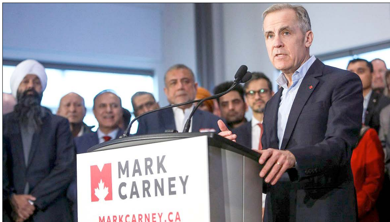
CARNEY ARRIVES TO ADDRESS:

Once sworn in as prime minister in the coming days, Carney will have to decide whether to call a snap election. If he doesn't, the opposition parties in parliament could force one later this month through a no-confidence vote.