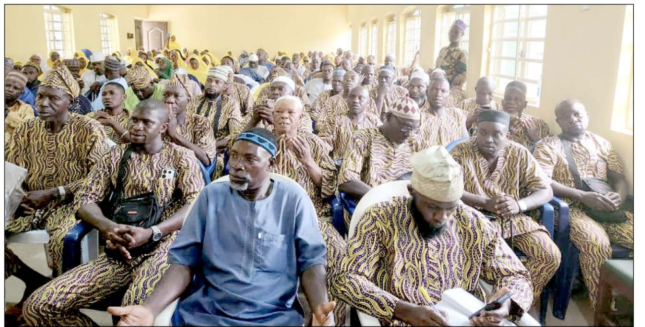
FAREWELL TO PILGRIMS:

encouraged the pilgrims, offering guidance for their time in Saudi Arabia and reminding them of the responsibilities they carry as spiritual envoys of the state.