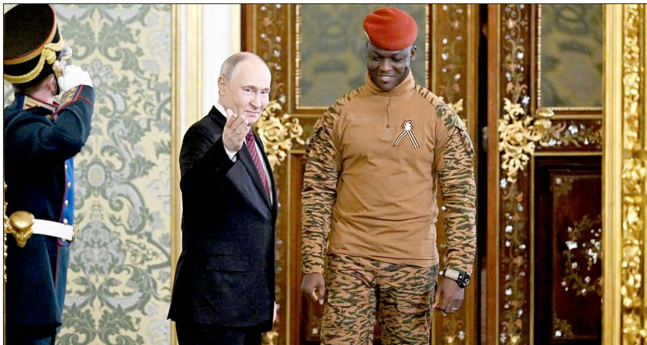
Ibrahim Traore of Burkina Faso (right), with Vladimir Putin of Russia, during the meeting of both leaders in Russia.

Israeli officials have said the plans for their expanded offensive include seizing all of the territory indefinitely, forcibly displacing Palestinians to the south, and taking over aid distribution with private companies despite opposition from the UN and its humanitarian partners, who say they will not co-operate because it appears to "weaponise" aid.