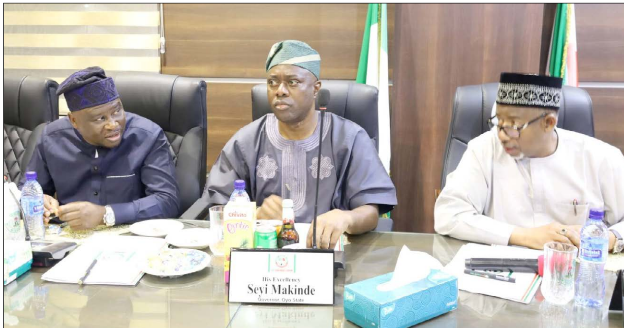
MEETING: L-R: Governors Ahmadu Umaru Fintiri (Adamawa State); Engr. Seyi Makinde (Oyo State), and Bala Mohammed (Bauchi State), during meeting of the Peoples Democratic Party (PDP)'s Governors Forum and stakeholders, yesterday.

At its last meeting on May 5, the Council approved the Renewed Hope Nigeria-First Policy aimed at prioritising the use of locally produced goods and services in all government procurement processes.