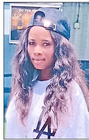
Police Command headquarters.