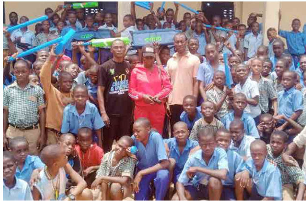
150 EBONYI STUDENTS

the Sports Writers Association of Nigeria (SWAN), Ebonyi State chapter, in collaboration with the Ebonyi State Ministry of Youths and Sports Development and the Nigeria Cricket Federation (NCF), marked the formal reintroduction of cricket in schools in the state.