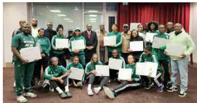
D'TIGRESS WITH THEIR NATIONAL HONOURS

"Mr President is happy to give you girls these honours and houses because you have consistently placed Nigeria on the global map with your performance, your patriotic spirit and your never give up mentality".