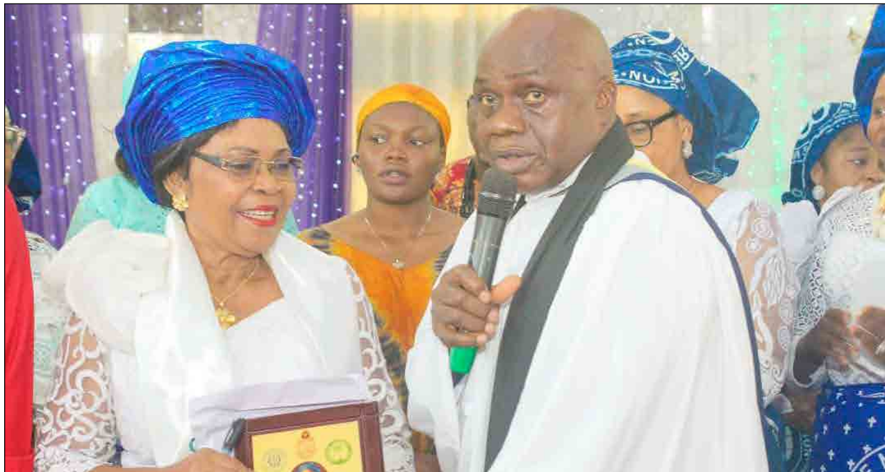
PRESENTING THE PILLAR OF EXCELLENCE AWARD:

He added that images circulating on social media likely showed only a few residents who had earlier relocated before security reinforcements arrived.