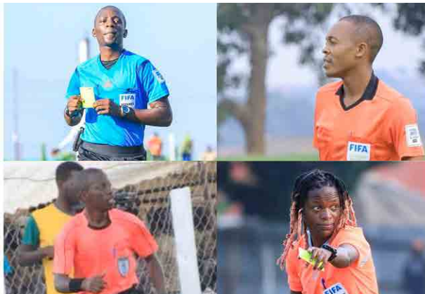
AFRICAN REFEREE FOR 2026 WORLD CUP