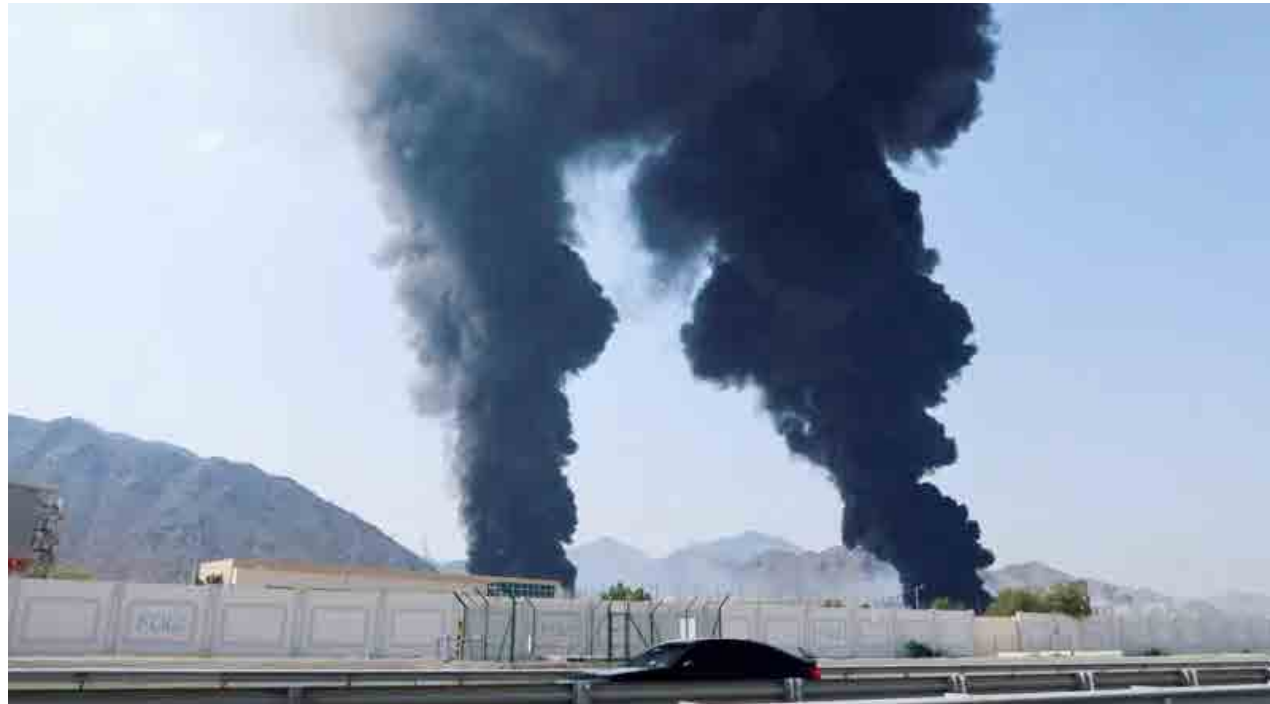
IRANIAN DRONE SMOKE: