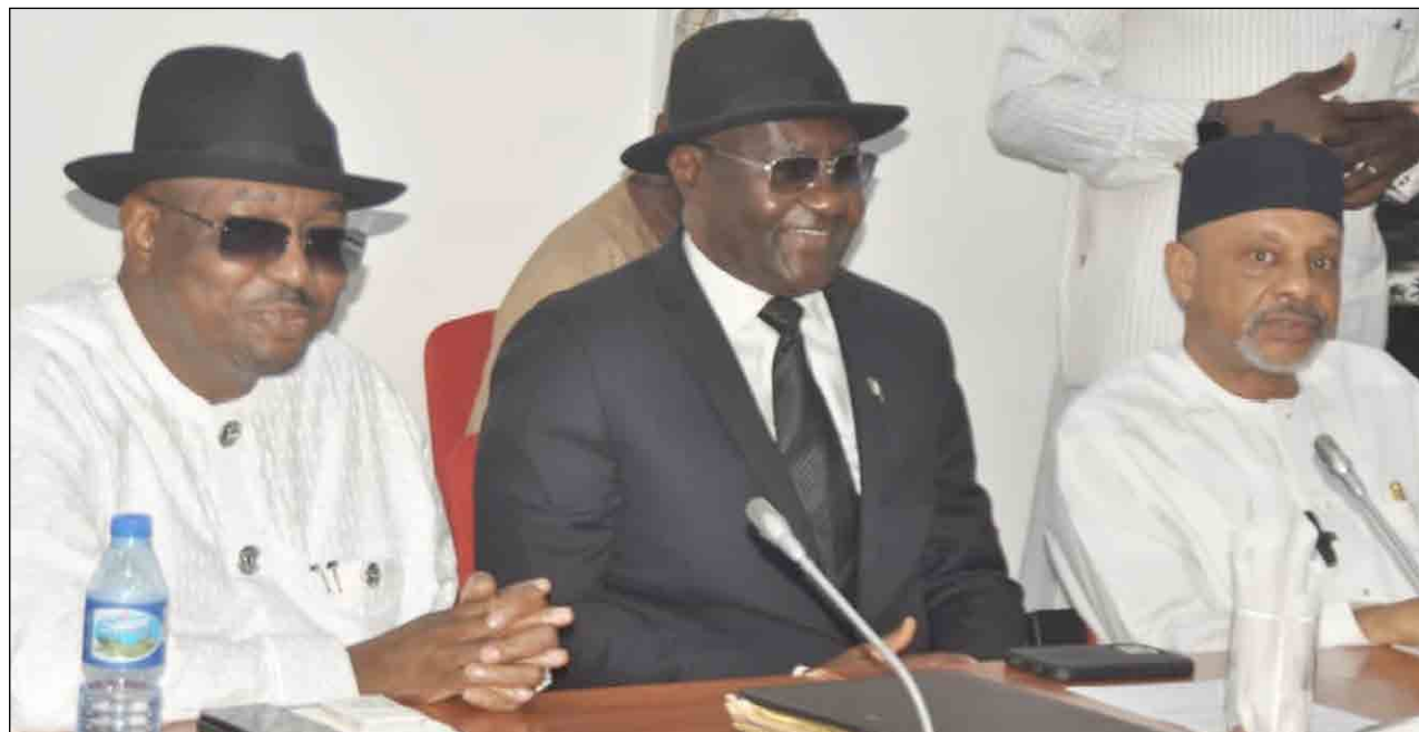
SENATE COMMITTEE ON PETROLEUM RESOURCES SCREENING:

L-R: Senator Philip Aduda; Chairman-designate of the Nigeria Upstream Petroleum Regulatory Commission (NUPRC), Senator Magnus Abe; and Special Adviser to the President on Senate Matters, Senator Basheer Lado, during Senate Committee on Petroleum Resources screening of the Chairman and Non-Executive commissioners of the NUPRC Board at the National Assembly, Abuja, yesterday.