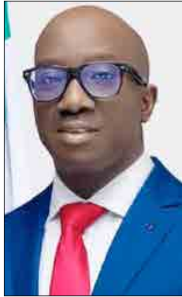
GOVERNOR MONDAY OKPEBHOLO

Determined to accelerate grassroots development, Governor Okpebholo recently procured 54 pieces of heavy equipment and distributed them across the state's 18 local gov-