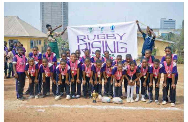
GRASSROOTS RUGBY TEAM

The four-month training programme kicked off in November and will officially conclude in February.