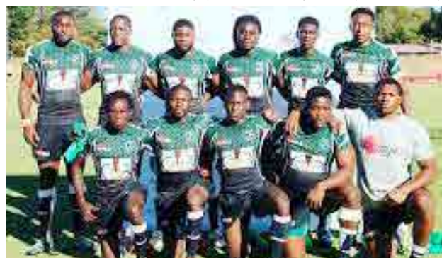
NIGERIA RUGBY TEAM

"This recognition is the result of the support from everyone involved. While we are not yet where we want to be, the positive signs give us confidence that we will reach our goals," he said.