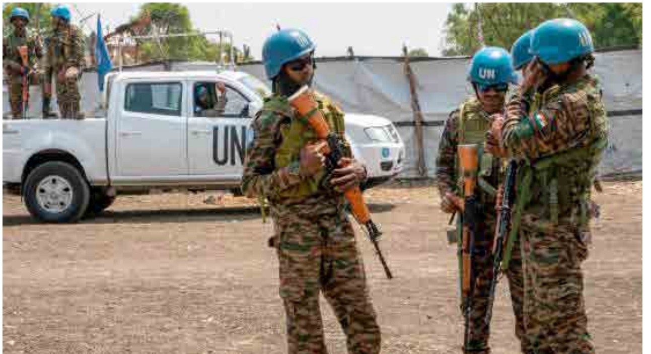
UNITED NATION ARMY:

Regional actors, especially the Economic Community of West African States (ECOWAS), have repeatedly urged restraint and a swift return to civilian rule, complicating the political landscape as Guinea-Bissau navigates one of its most volatile periods in recent history.