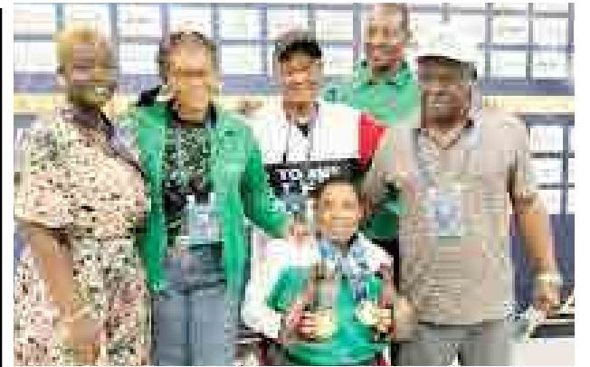
3RD NATIONAL PARA GAMES