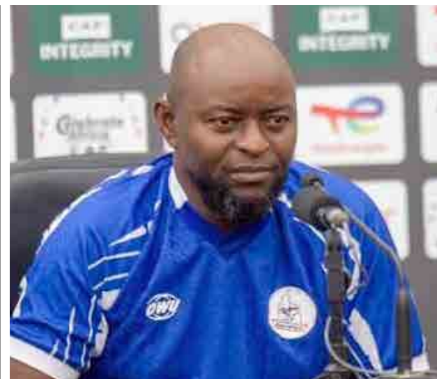
HEAD COACH FINIDI GEORGE