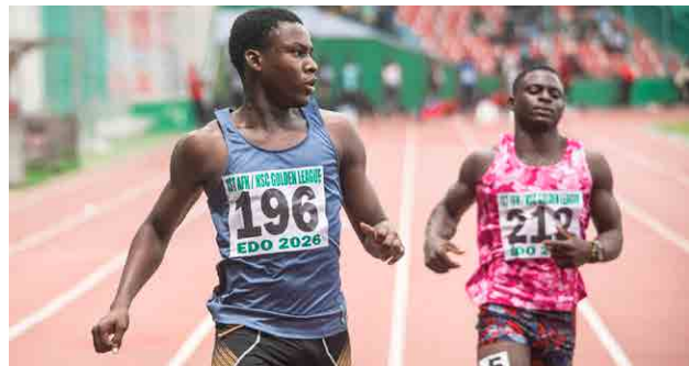
EDO STATE ATHLETES

This is coming three days after the second Niger Delta Games had been concluded at the same stadium in Benin city.