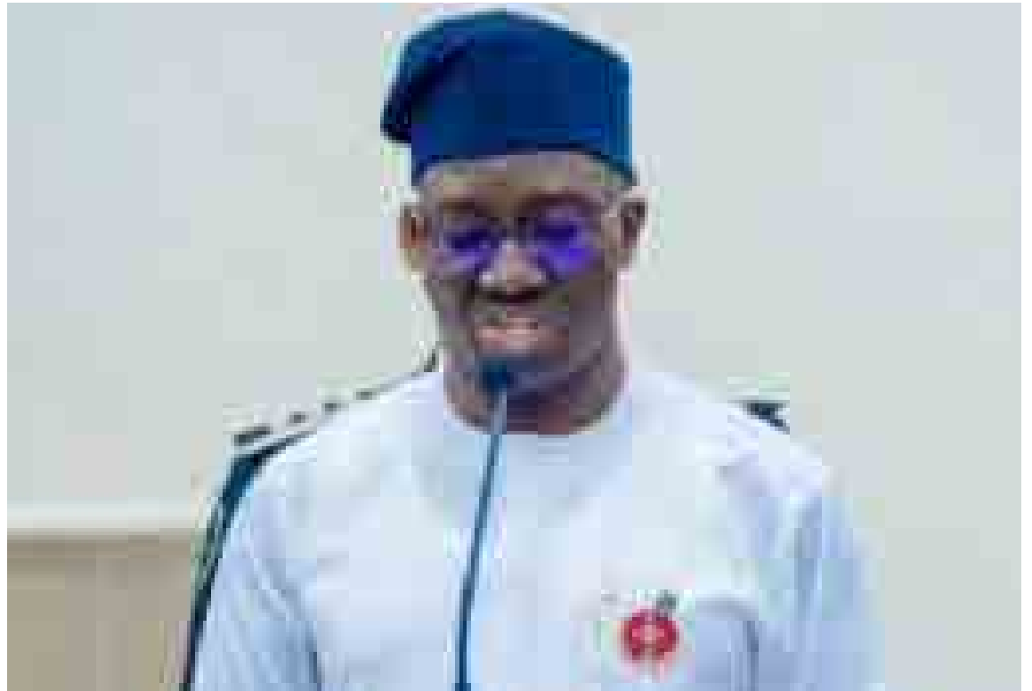
EDO STATE GOVERNOR, MONDAY OKPEBHOLO

across the state, one thing remains clear: Edo people are resilient. They have endured economic hardship, political disagreements, and social challenges, yet their hope for a better tomorrow remains strong. That hope must now be transformed into collective action.