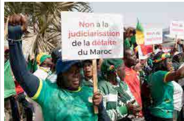
SENEGAL FANS PROTESTING

Senegal's Prime Minister, Ousmane Sonko, criticised the severity of the ruling, telling parliament that Morocco's handling of the case "does not honor" the two nations' bilateral relations. He added that the Senegalese government was doing "everything it had to do" to secure the release of its citizens.