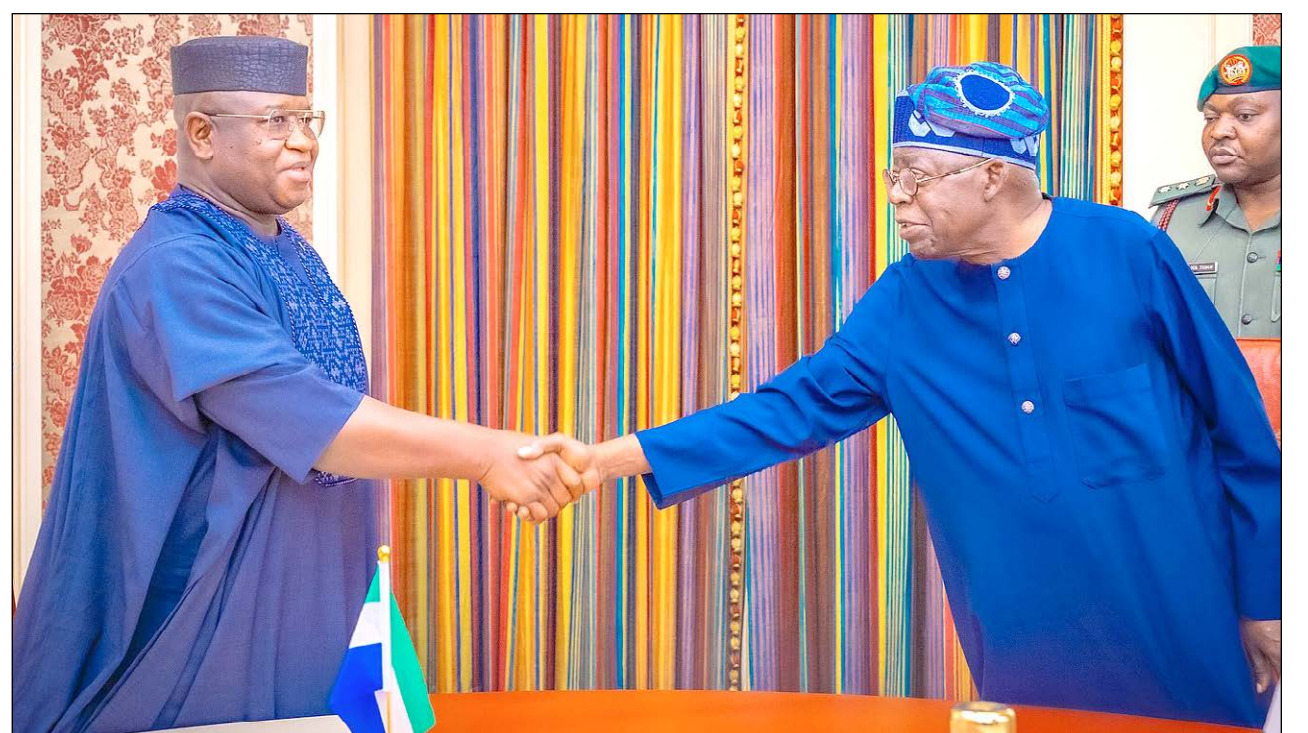
TINUBU WELCOMES BIO:

President Bola Tinubu (right), welcoming the Sierra Leone President, Julius Bio, at the Aso Rock Presidential Villa, Abuja on Monday