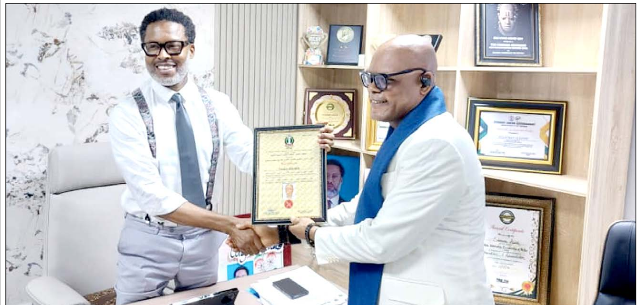
CERTIFICATE OF PARTICIPATION:

The refinery emphasised that this initiative extends beyond MRS Holdings, Ardova Plc (AP), and Heyden.