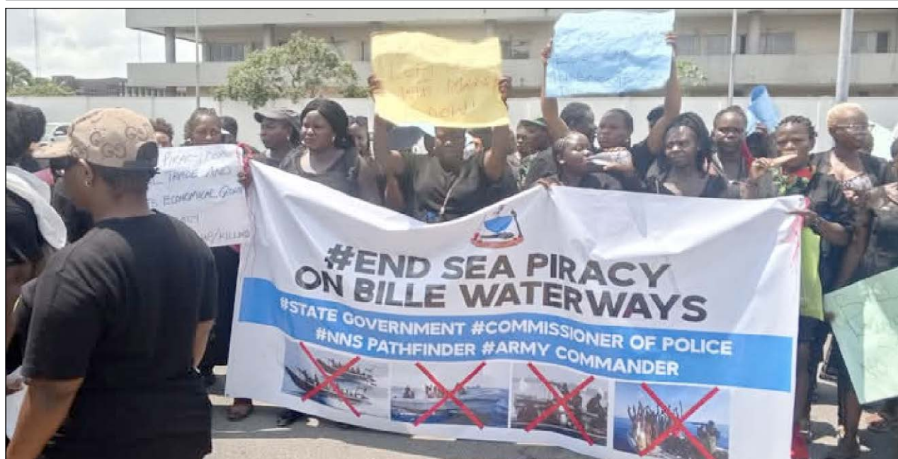
ABDUCTED WAEC STUDENTS:

"Through collaboration with partners, we will build a sustainable ecosystem where small businesses grow, create jobs, and improve livelihoods," he concluded.