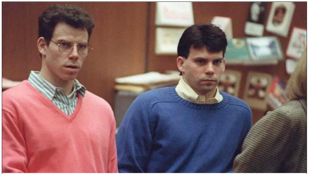
The brothers' trial in 1993 was one of the first high-profile murder cases to be shown live on television

Among the more than 200 species that have been killed, which range from the smallest of baby fish to great whites, some are more vulnerable than others.