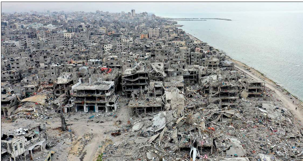
GAZA: Gaza, the ruins of war born out of extremism

Hamas has previously said it will only agree to a deal that includes the end of the war. This has been repeatedly rejected by Netanyahu.