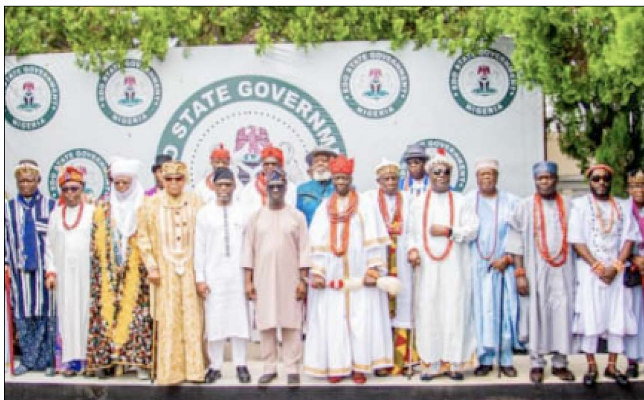
SOUTH-SOUTH MONARCH'S FORUM: