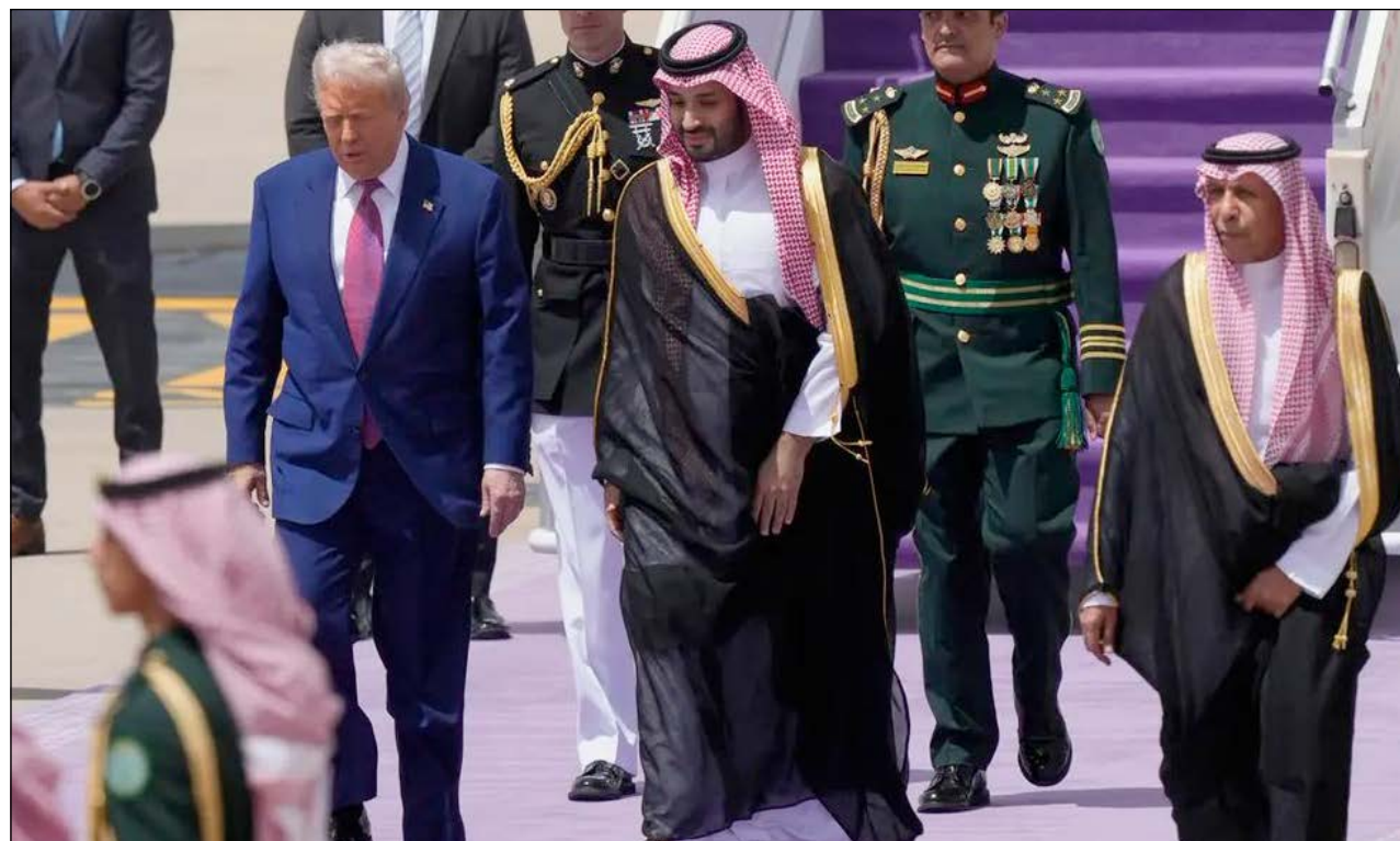
SAUDI CROWN PRINCE & TRUMP:

Despite these arguments, the bill failed to gain enough traction, and the House rejected it alongside six other constitutional amendments, including proposals to transfer party registration from INEC to a Registrar General of Political Parties, to establish independent State Auditors-General for Local Governments.