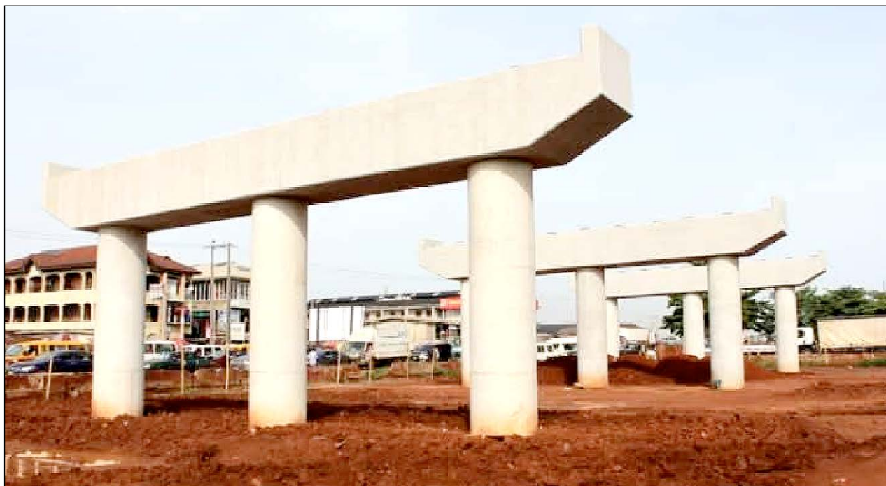
BENIN CITY FLYOVER:

In closing, the PDP Senate caucus called on all party faithful to recommit to its founding vision and work collectively towards building a revitalised, unified platform capable of offering a credible alternative to the ruling party.