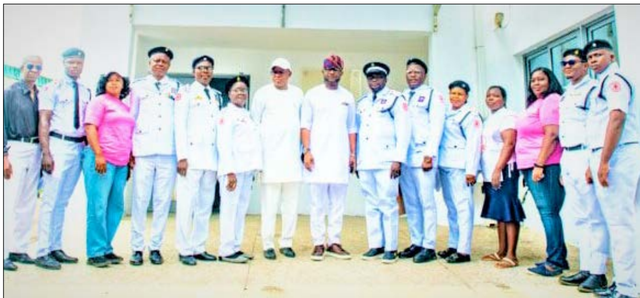
NIGERIAN RED CROSS SOCIETY:

Quoting Section 18(1) of the 1999 Constitution, the caucus insisted the flawed UTME denied many South-East students their right to equal and adequate educational opportunities.