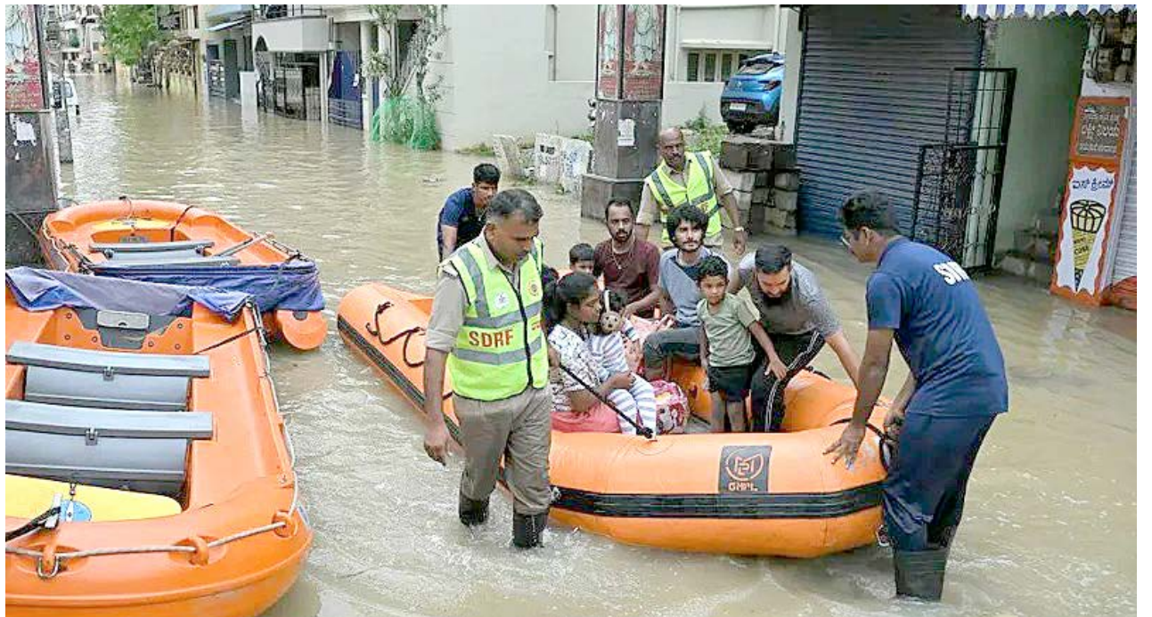
100MM OF RAIN:

"Bengaluru contributes significantly in taxes - both at an individual level and property tax. There is no return on this investment," he said, calling on the state government to work on long-term solutions to improve the city's infrastructure.