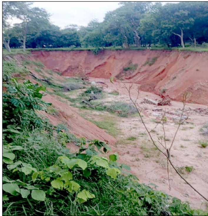
GULLY EROSION: Jattu Ibie road gully erosion site.

Once the annex is adopted, the full agreement will be open for signature and ratification. It will enter into force after ratification by 60 countries.