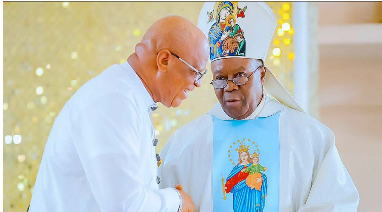
75TH BIRTHDAY CELEBRATION: