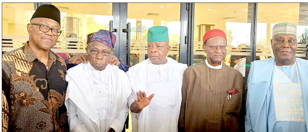
60TH BIRTHDAY CELEBRATION:

eign exchange. What we have brought back is jobs for Nigerians."