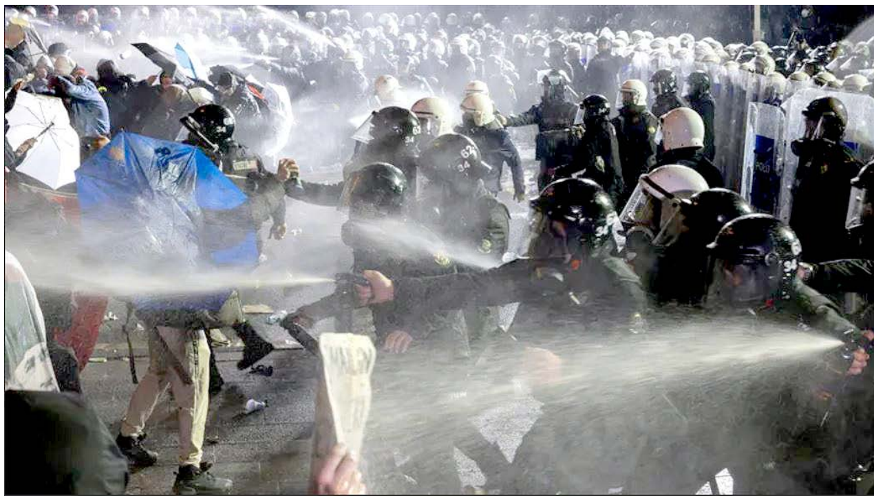
PROTESTER SPRAY PEPPER:

Prosecutors had also accused him of "aiding an armed terrorist organisation", but this was not included in the charges.