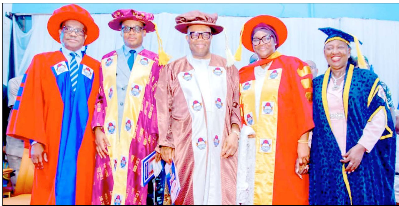
UNICAL 50TH ANNIVERSARY:

This initiative seeks to strengthen migration governance while ensuring the protection of migrants' rights and fostering community engagement.