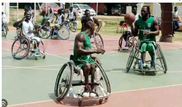
NIGERIA WHEELCHAIR BASKETBALL