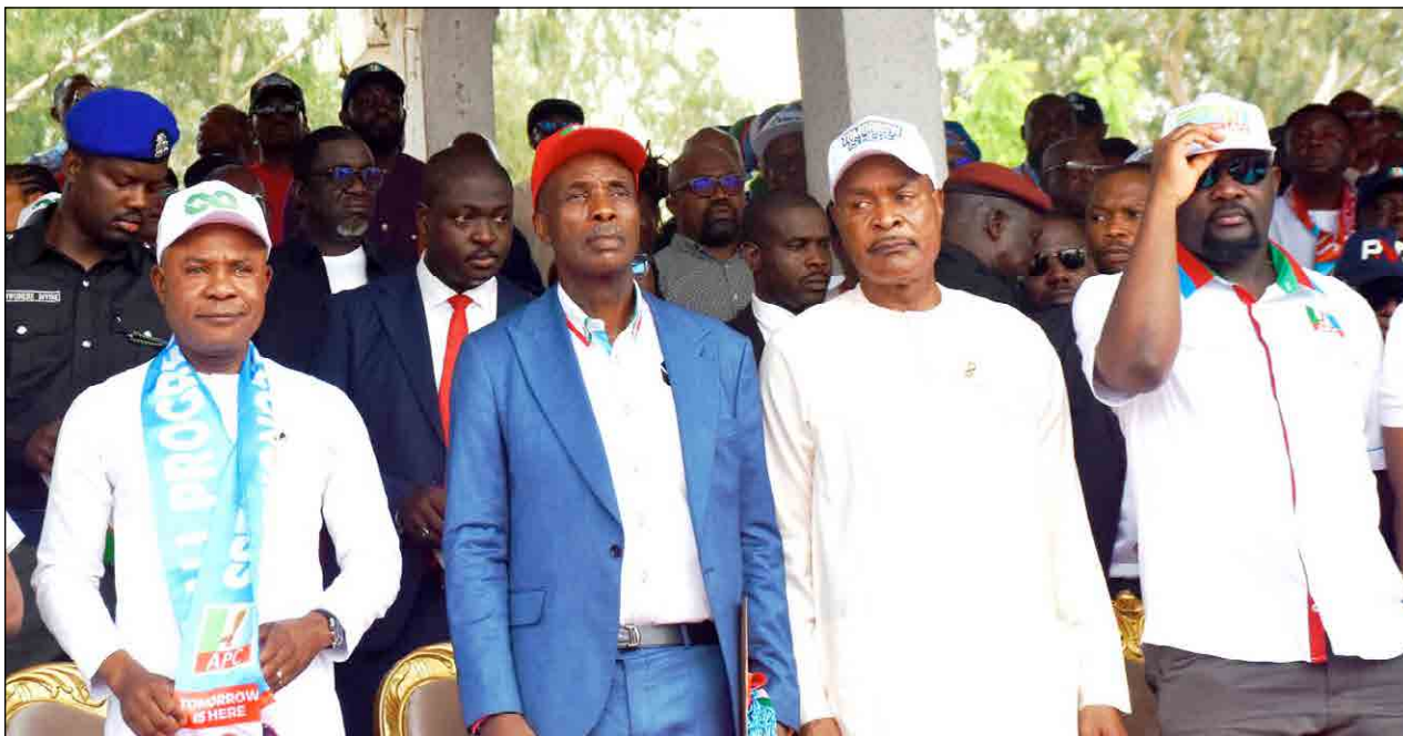
APC ENUGU STATE CONGRESS: