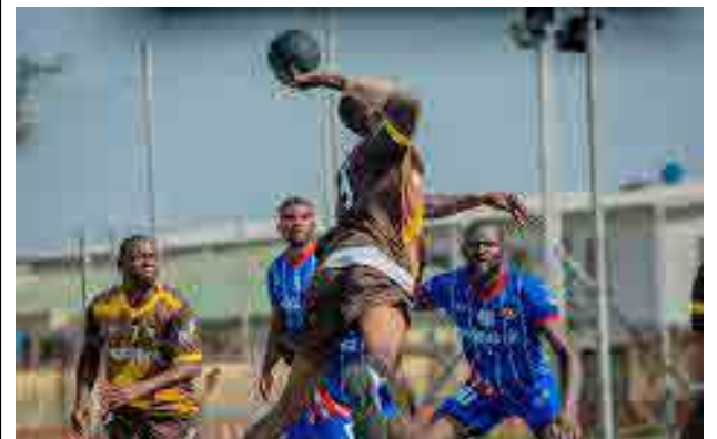
SOUTHWEST ZONE OF THE HANDBALL FEDERATION

"We are grateful to the Southwest states for standing firmly with the federation during the elections. Your support has strengthened our resolve to deliver on our promises," he said.