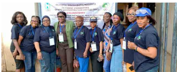
NIGERIAN OLYMPIC COMMITTEE (NOC) COMMITTEE

The participants will receive internationally recognized training in governance reform and strategic planning; financial oversight and organisational accountability; ethical leadership and safeguarding principles; and policy implementation and institutional management.