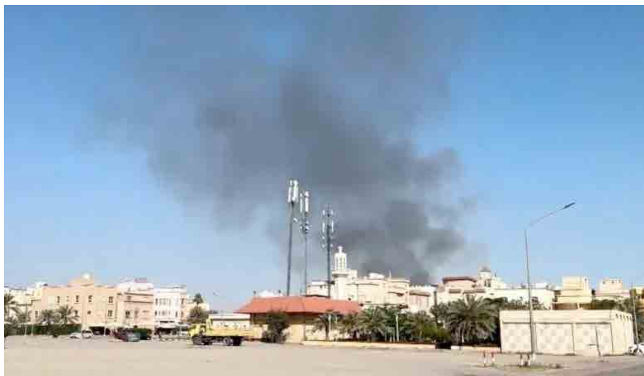
US EMBASSY IN KUWAIT:

A top consideration of all these European leaders is not wanting to alienate Donald Trump. They desperately hope events in the Middle East will not be another distraction for the US president, preventing him - again - from engaging in finding a sustainable solution to another conflict, this one on their own continent: Ukraine.