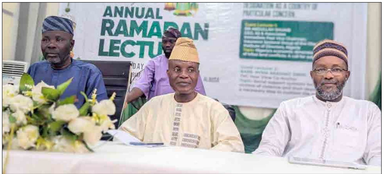
2026 ANNUAL RAMADAN LECTURE:

The congress was attended by senior party leaders, including former Governor Akinwunmi Ambode, former Deputy Governor Adejoke Orelope-Adefulire and other political stakeholders. Officials of the Independent National Electoral Commission monitored the exercise.