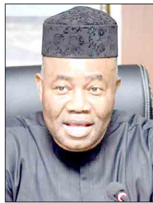
SENATE PRESIDENT, GODSWILL AKPABIO