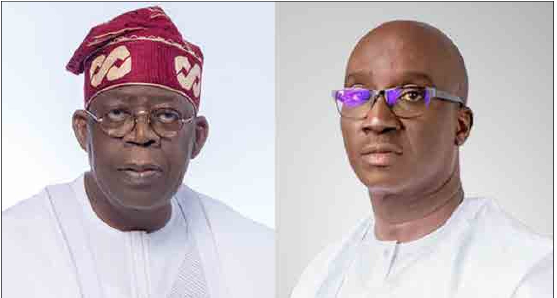
PRESIDENT BOLA TINUBU