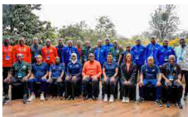
FIFA COACH EDUCATORS DEVELOPMENT