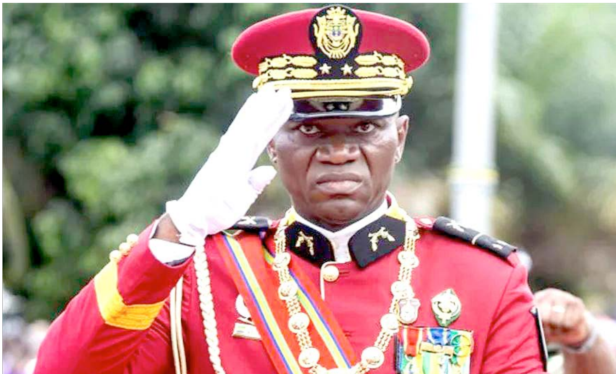
FOLLOW A COUP:

A Facebook page associated with Nguema clarified on