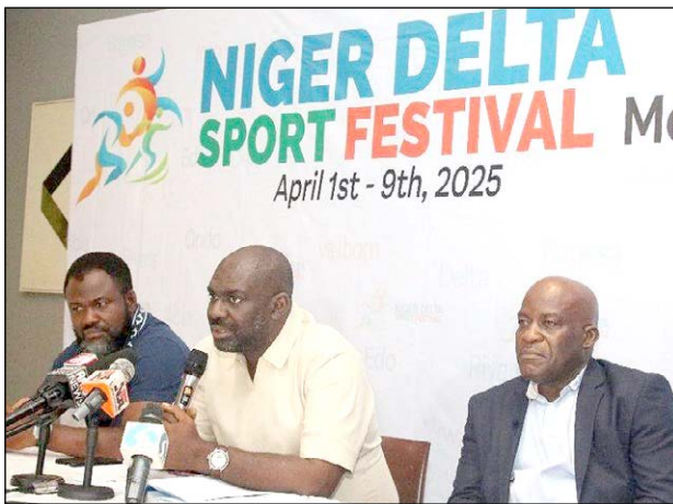
NIGER DELTA SPORTS FESTIVAL MEDIA CHAT

ful debut in 2024, and organizers expect this year's edition to boost tourism and youth engagement.