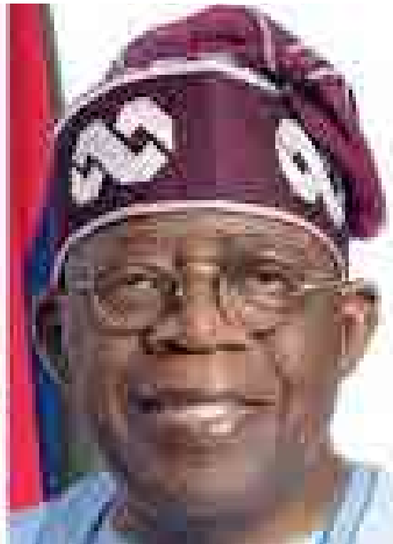
President Bola Ahmed Tinubu

zero. Talking about our country. This is our country. Are you not in Nigeria? Why the capital of the Nigerian government remains at zero in 2026?"