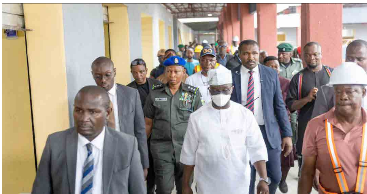
AN INSPECTION VISIT:

where gas was observed floating on the surface, heightening fears of escalating environmental and public health consequences.