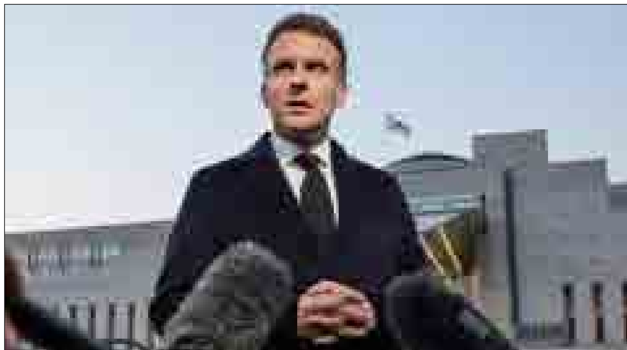
FRANCE PRESIDENT: Macron calls Trump's remarks on his marriage 'inelegant'

Pointing to the three-prong plan he said the US was pursuing, he assured viewers that Venezuela had moved into the second phase: that of recovery.