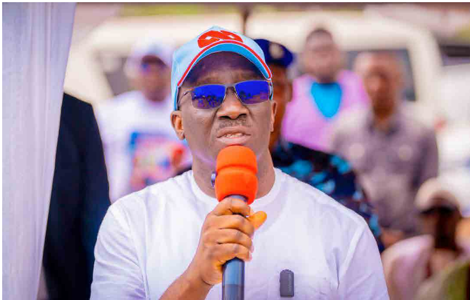
Governor Monday Okpebholo

Upon assuming office, Governor Monday Okpebholo ordered a thorough review of the state's digital governance framework. According to the