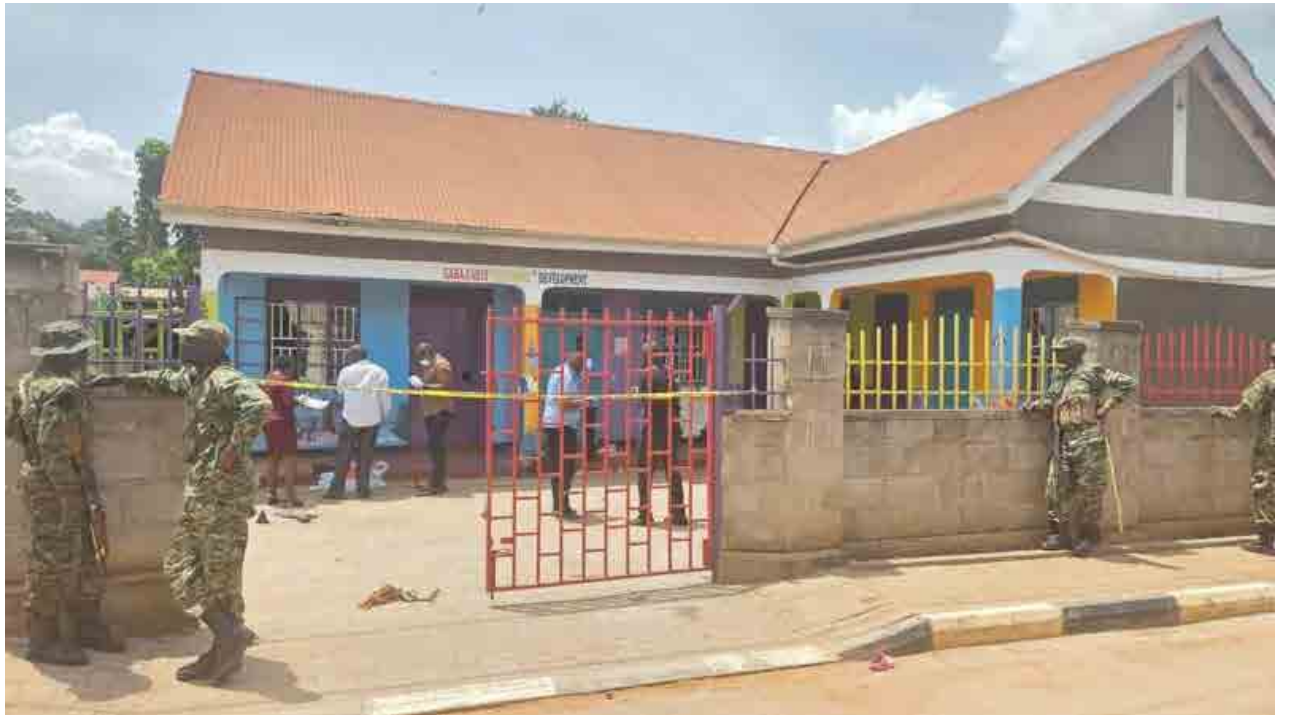
SCHOOL IN KAMPALA:

"There were many people outside... I even saw some people leaving their house without having finished their shower," he told AFP news agency.