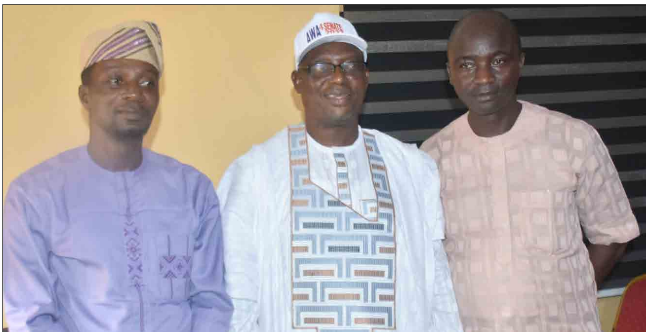
A COURTESY VISIT:

"FAAN does not see investors as counterparties to be managed, but as partners to be engaged," she said, stressing the agency's commitment to continuous dialogue and policy refinement.