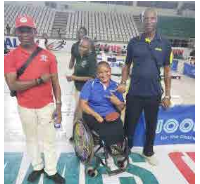
TEAM EDO PARA TABLE TENNIS

Curtains will be drawn on the competition on Friday, April 3, 2026.