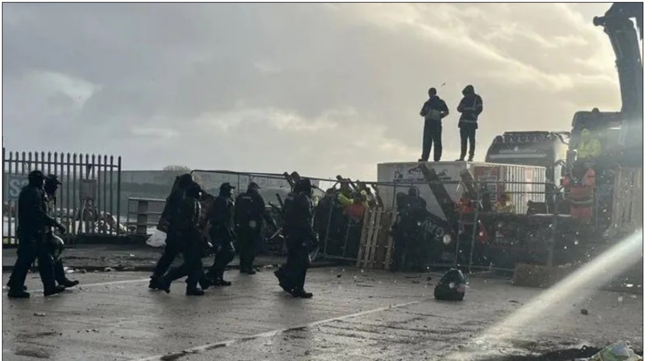
IRISH FUEL PROTESTERS: