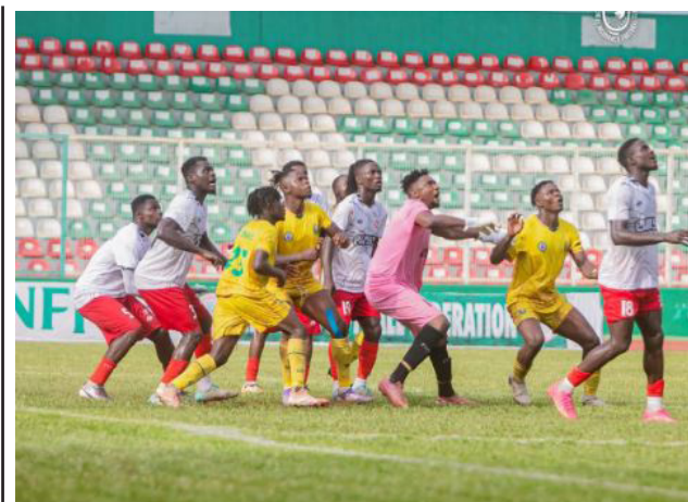
BENDEL INSURANCE VS ABIA WARRIORS

The double success highlights Nigeria's continued investment in grassroots handball development, as envisioned by the National Sports Commission.