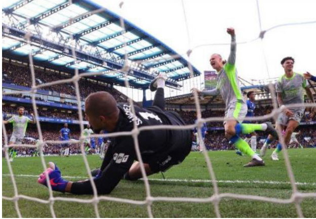
MAN CITY VS CHELSEA MATCH

Manchester City reignited the Premier League title race with a dominant 3-0 victory over Chelsea at Stamford Bridge,