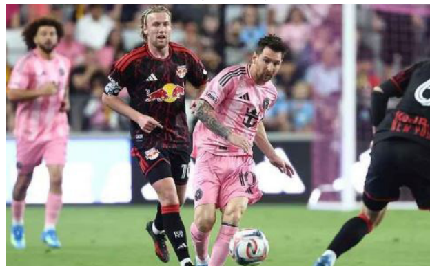
MESSI IN ACTION FOR INTER MIAMI