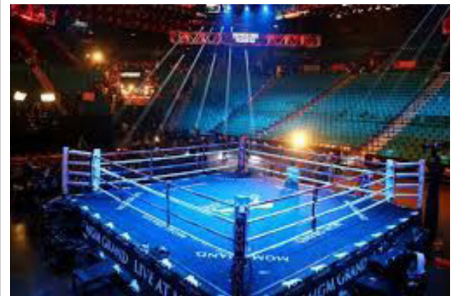
OLYMPIC-SIZE BOXING RING