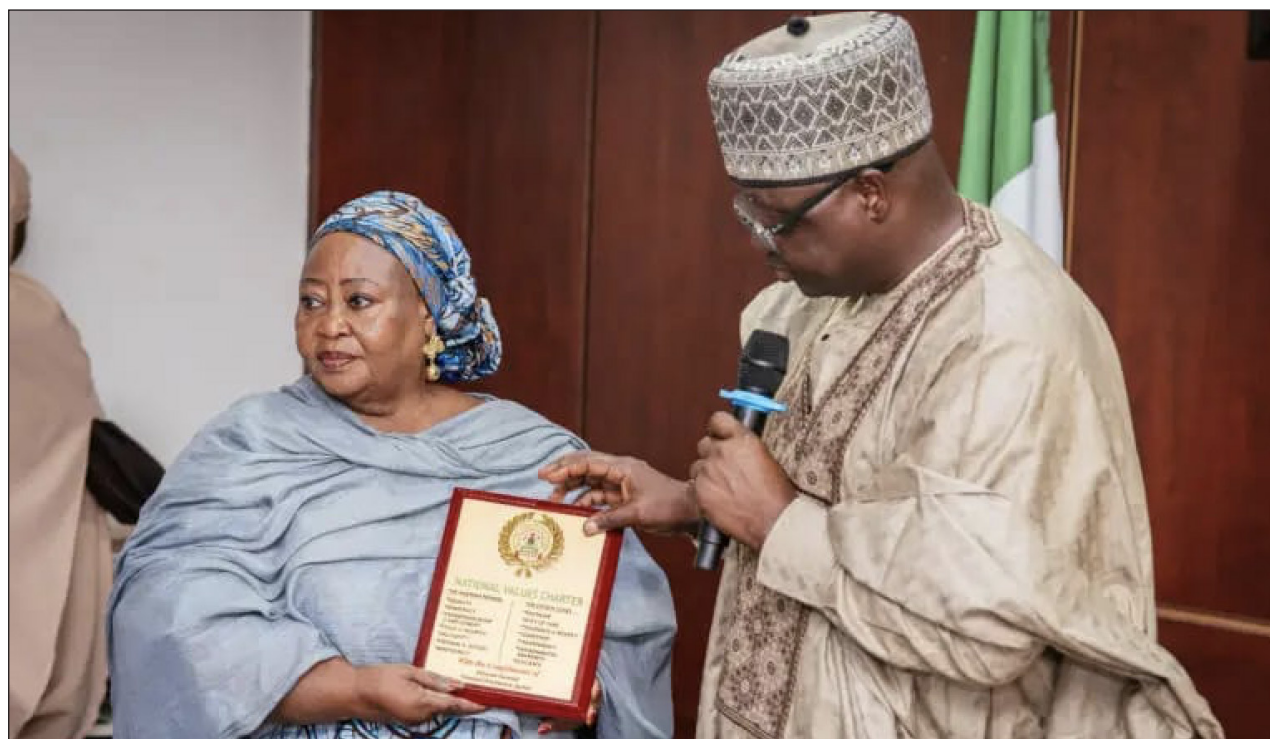
NAWOJ COURTESY VISIT

In addition, he outlined plans to increase local children's media content, targeting at least 70 per cent of cartoons to reflect indigenous culture and values.