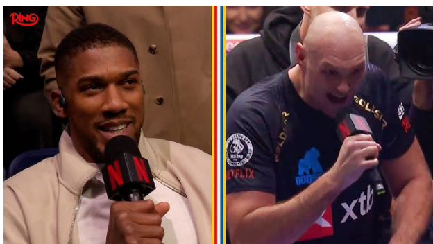
ANTHONY JOSHUA AND TYSON FURY