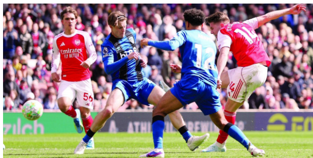
ARSENAL VS BOURNEMOUTH

On whether the players are hurting, he added: "A lot. It has to hurt. They have to take it on the chin. You stand up and go for the fight or you're out.