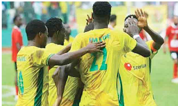
BENDEL INSURANCE PLAYERS CELEBRATING

In their first round meeting in Benin, Insurance FC thrashed Wikki Tourists FC 3-0.