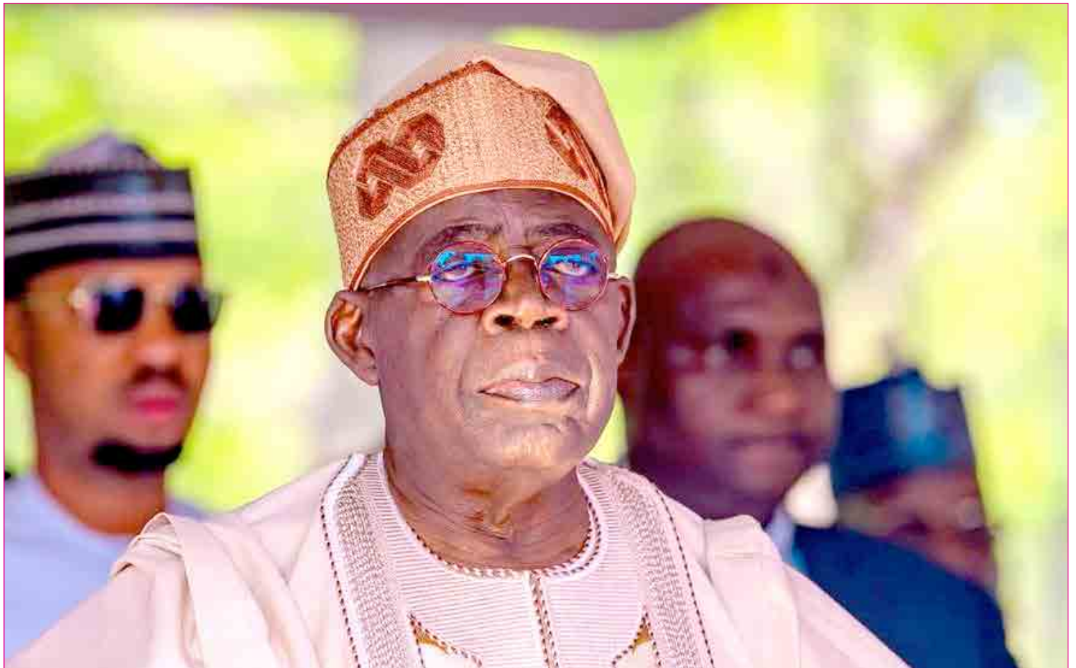
PRESIDENT BOLA TINUBU

Atiku Abubakar is not the future. He is a perpetually unelectable candidate, a man who has spent more time pursuing power than explaining why he should be trusted with it. He represents a tired recycling of elite ambition, not a fresh governing vision. His politics increasingly feels like a