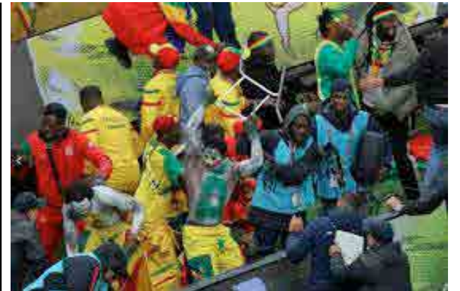
SENEGALISE FANS FIGHTING