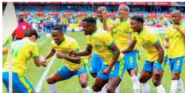
MAMELODI SUNDOWNS PLAYERS