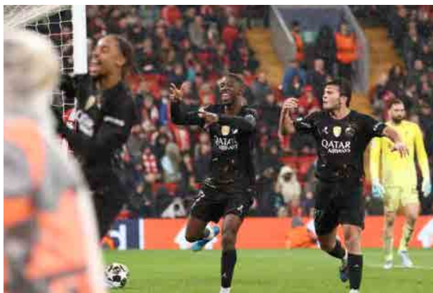
PARIS SAINT-GERMAIN CELEBRATE

Liverpool, meanwhile, excited the competition and will now focus on securing a top-five finish in the English Premier League to qualify for next season's UEFA Champions League