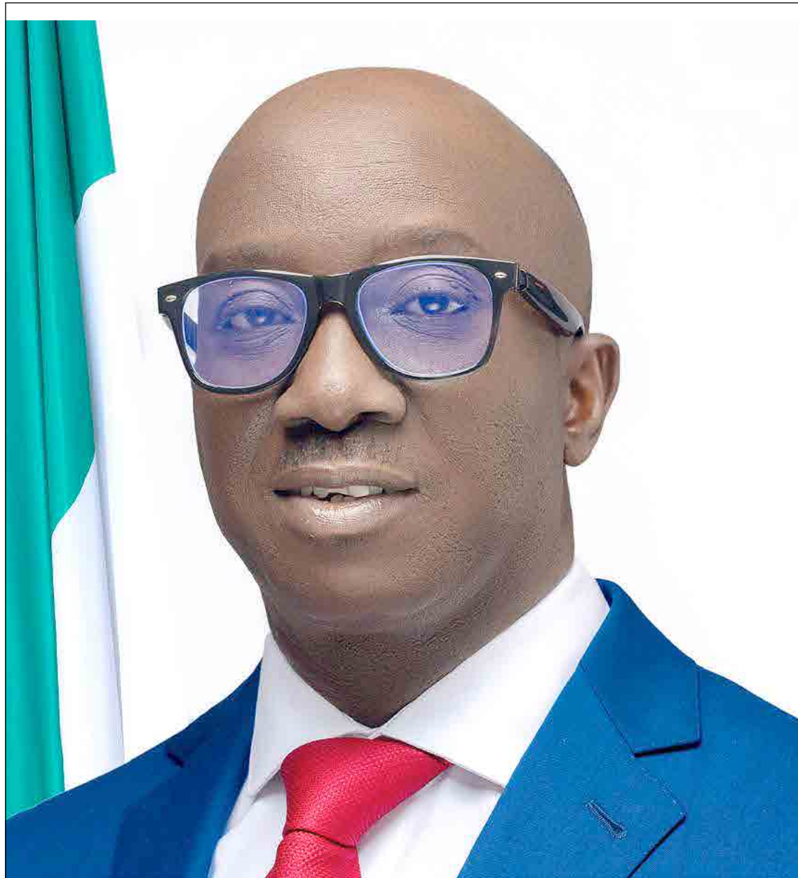
HIS EXCELLENCY SEN. MONDAY OKPEBHOLO GOVERNOR OF EDO STATE

Understanding the socio-geographic dynamics of Edo State, Governor Okpebholo has emphasised the importance of grassroots penetration. The involvement of local government structures introduces a decentralised framework for sensitisation, ensuring