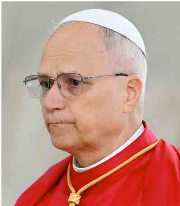
TRUMP AND POPE:

US President, Donald Trump's and Pope Leo.